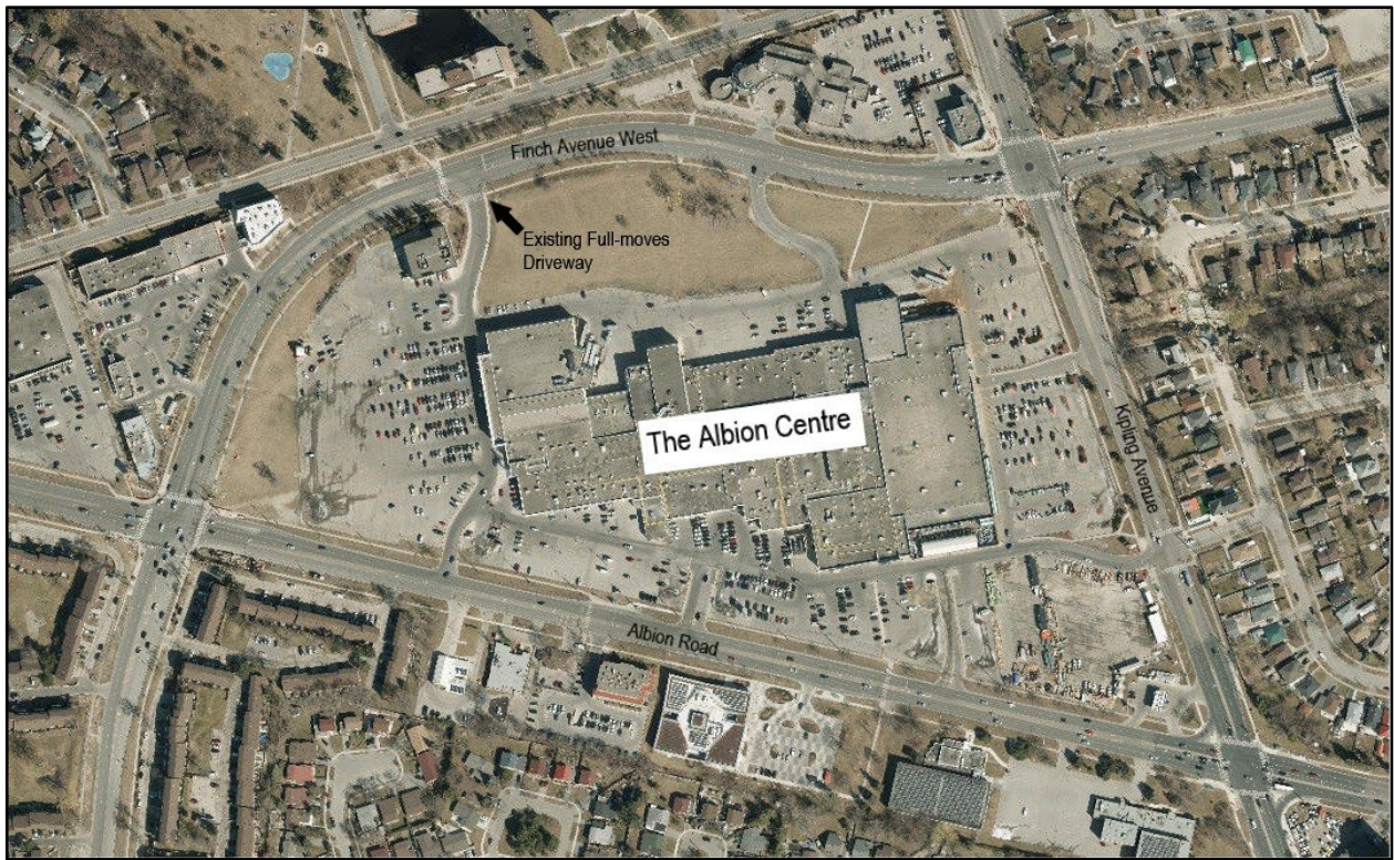
Figure 1 – The Albion Centre Location