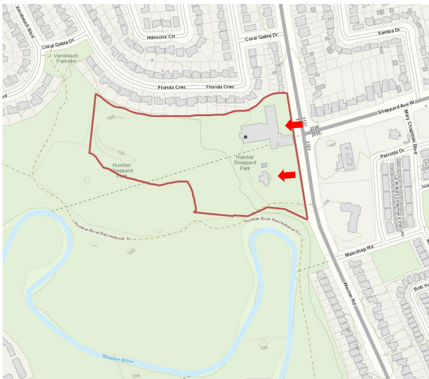
Map of the property at 3100 Weston Road, outlined in red. Red arrows indicate the former school complex (top), and the former estate home of Rivermede (bottom). Note: This location map is for information purposes only; the exact boundaries of the property are not shown. City of Toronto Mapping.