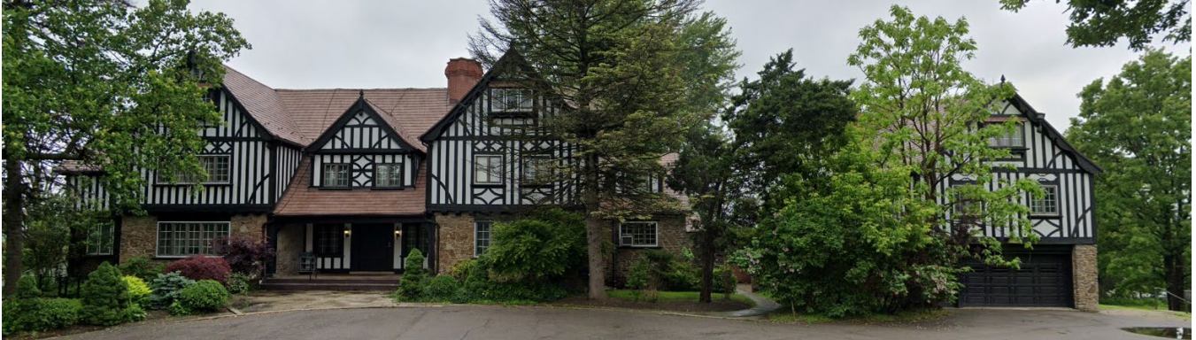
(Top) View of main (east) façade of former estate home with garage (right) at 3100 Weston Road.