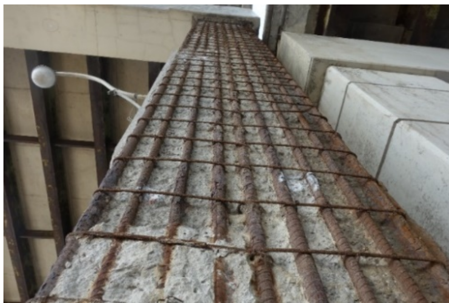
Figure 2: Condition of Reinforced Concrete Column at Bent 319

The results of the assessment indicated that concrete deterioration and spalling has resulted in the reinforcing steel being exposed on large areas of the columns. When reinforcing steel becomes detached from the concrete, loss of capacity can occur and compromise the strength of the reinforced concrete elements. In addition, comparisons with previous inspection reports indicate that the concrete deterioration has accelerated significantly, meaning that immediate repair work is required to halt further debonding of the reinforcing steel. Figure 2 and Figure 3 illustrate the typical condition of the concrete columns that require immediate repair.