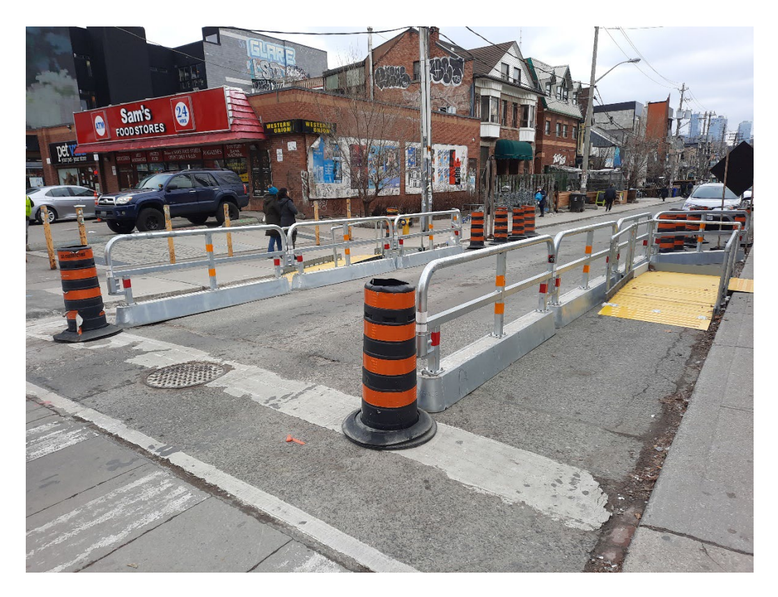
College & Augusta (Kensington Market) Dec 2022 Pilot installation