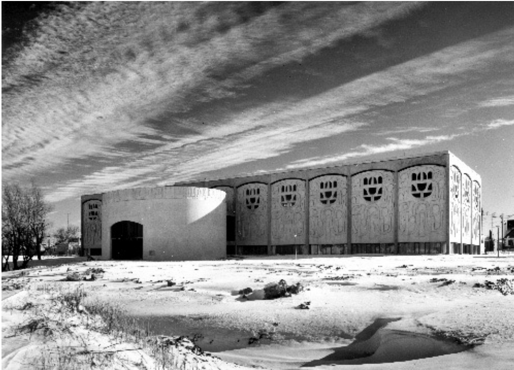
Beth David B'nai Israel Synagogue, 1959 ERA Architects