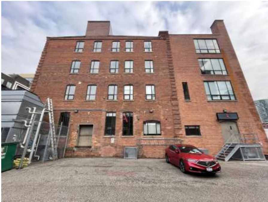
Figure 11: West (rear) elevation of the property at 46 Spadina Avenue, 2022. (Heritage Planning)