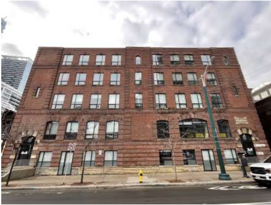
Figure 8: East (principal) elevation of the property at 46 Spadina Avenue, 2022.