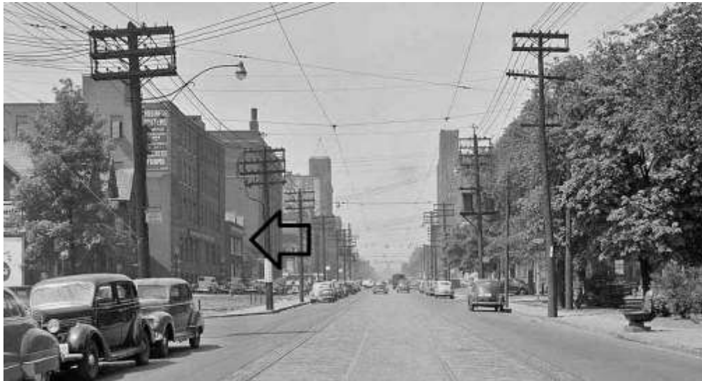
Figure 15: Archival Photograph, Spadina Avenue north of Wellington Street West, 1949: showing the Systems Building on the west side of the street, with the signage on the south elevation.