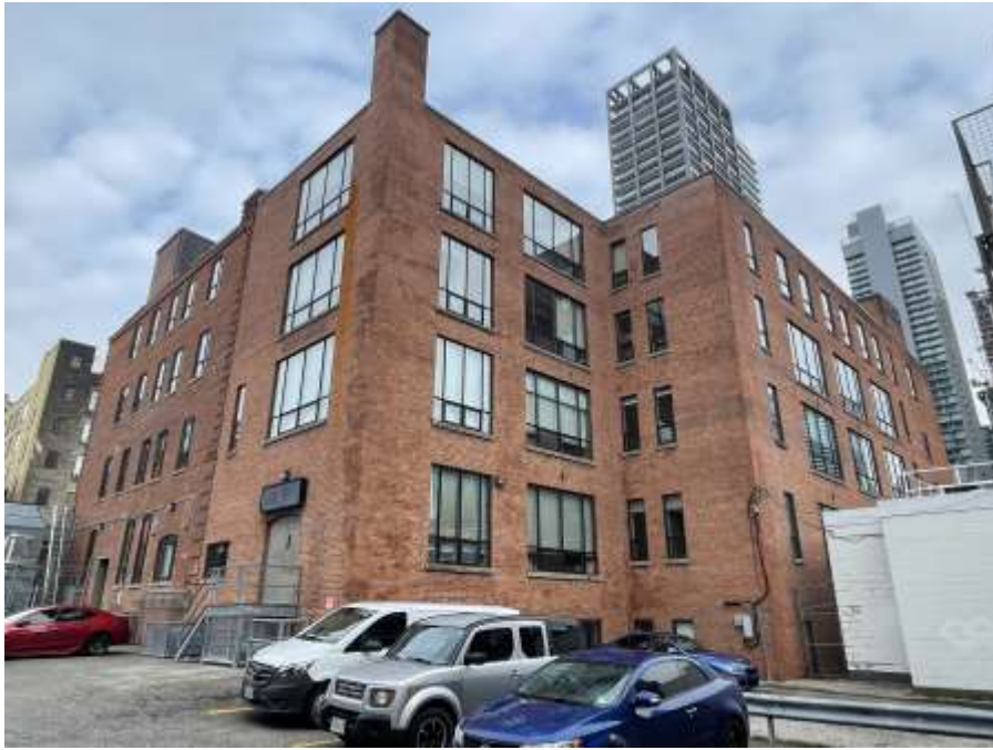
Figure 10: Southwest corner of the property at 46 Spadina Avenue, 2022.