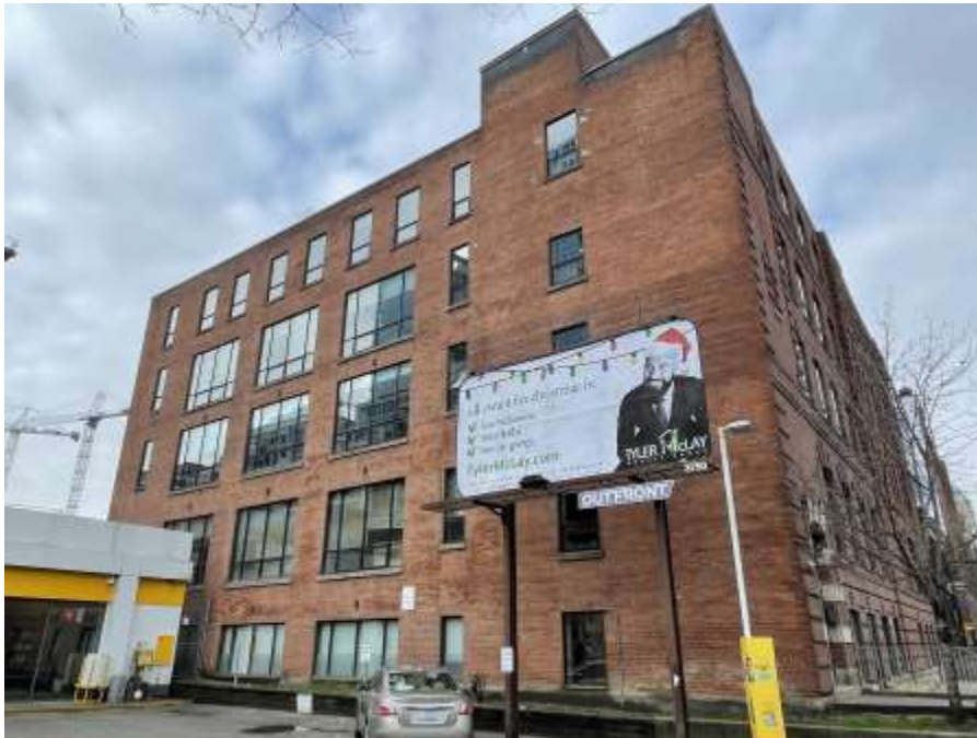
Figure 9: South elevation of the property at 46 Spadina Avenue, 2022.