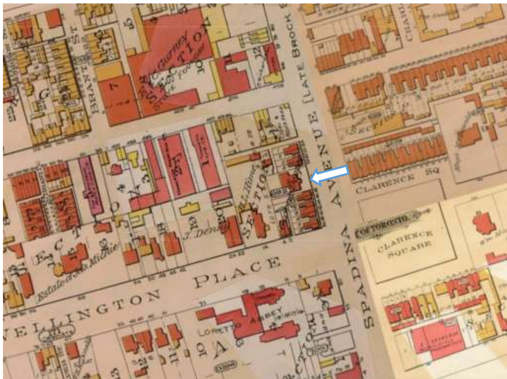
Figure 3: 1903 Goad's Atlas of the City of Toronto; future location of 46 Spadina Avenue indicated by the arrow.