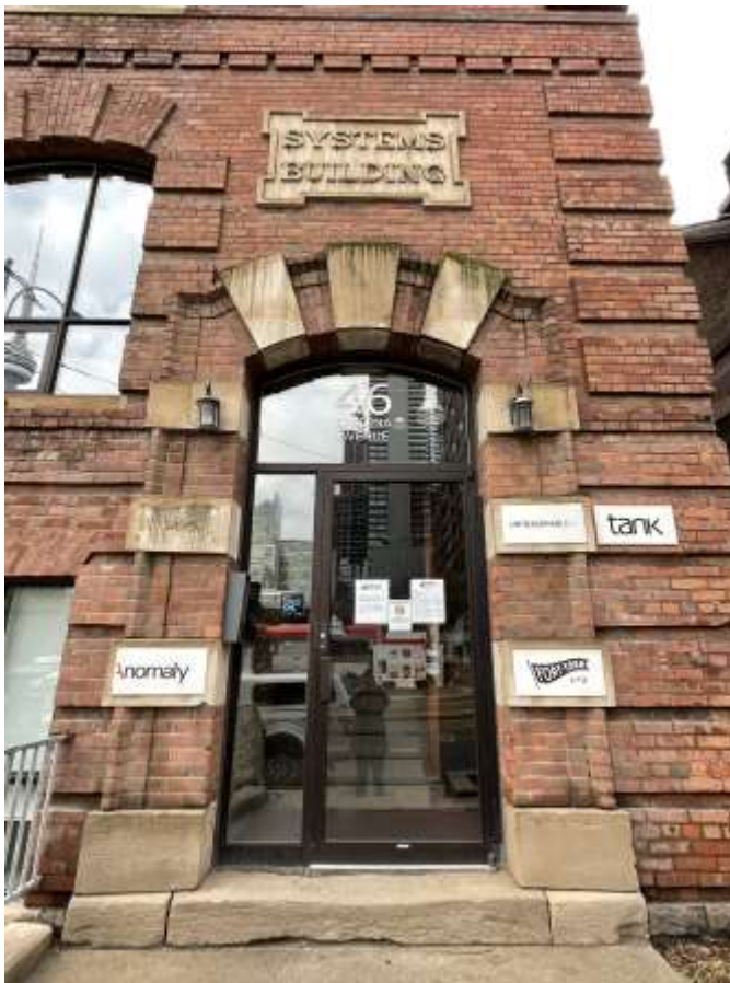
Figure 13: Detail of the primary entry on the west elevation of the subject property, 2022. Note Gibbs surround and Systems Building name plate. (Heritage Planning)