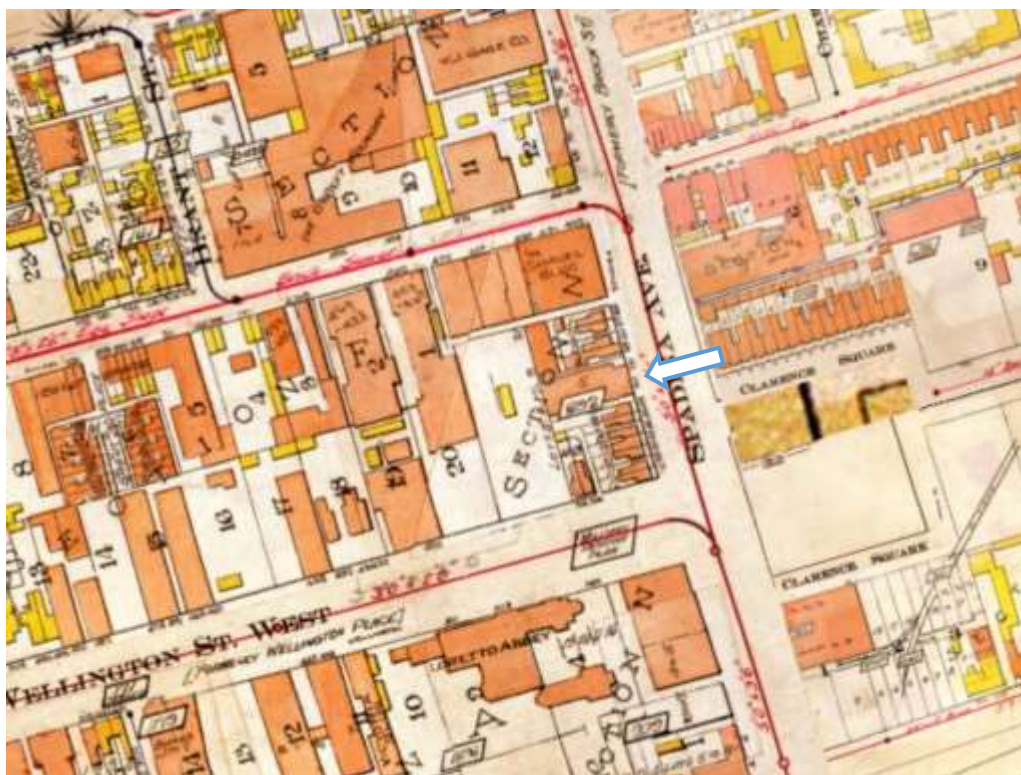
Figure 5: 1924 Goad's Atlas of the City of Toronto; location of 46 Spadina Avenue indicated by the arrow.