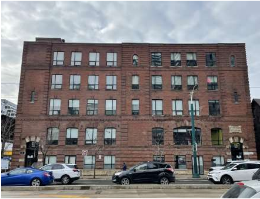
Figure 1: 46 Spadina Avenue, 2022.