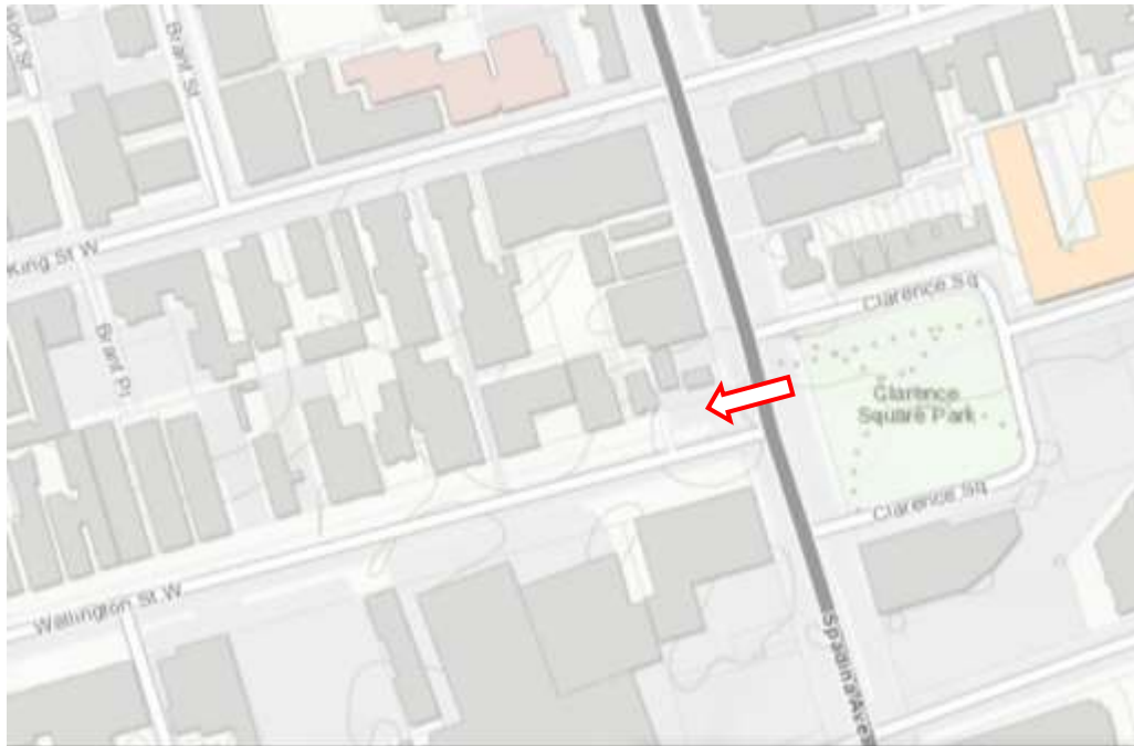
Figure 2: Location of 46 Spadina Avenue indicated by the arrow. Note: This location map is for information purposes only; the exact boundaries of the property are not shown. North is located at the top of the map. (City of Toronto mapping.)