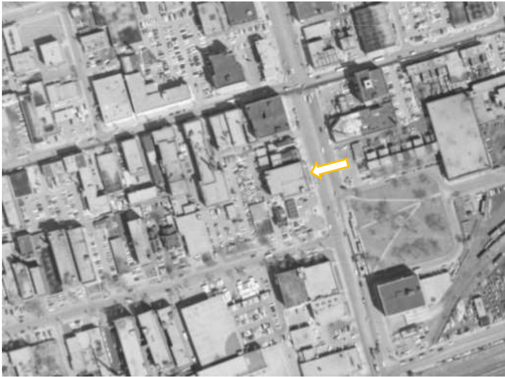
Figure 6: 1965 aerial photograph; location of 46 Spadina Avenue indicated by the arrow.