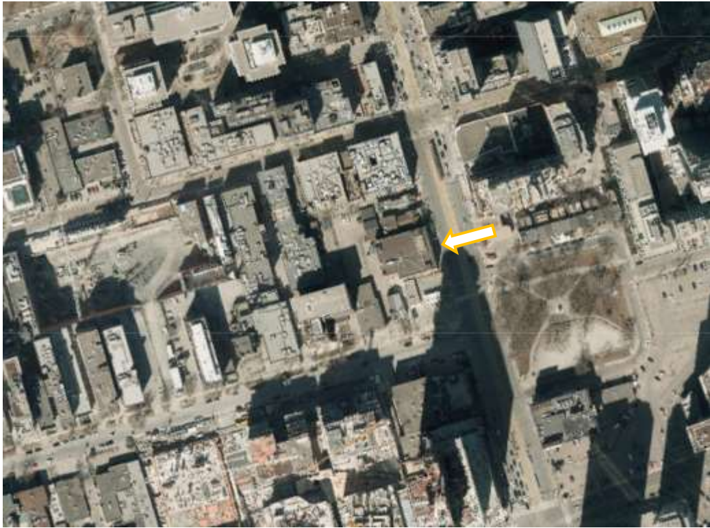
Figure 7: 2021 aerial photograph; location of 46 Spadina Avenue indicated by the arrow.