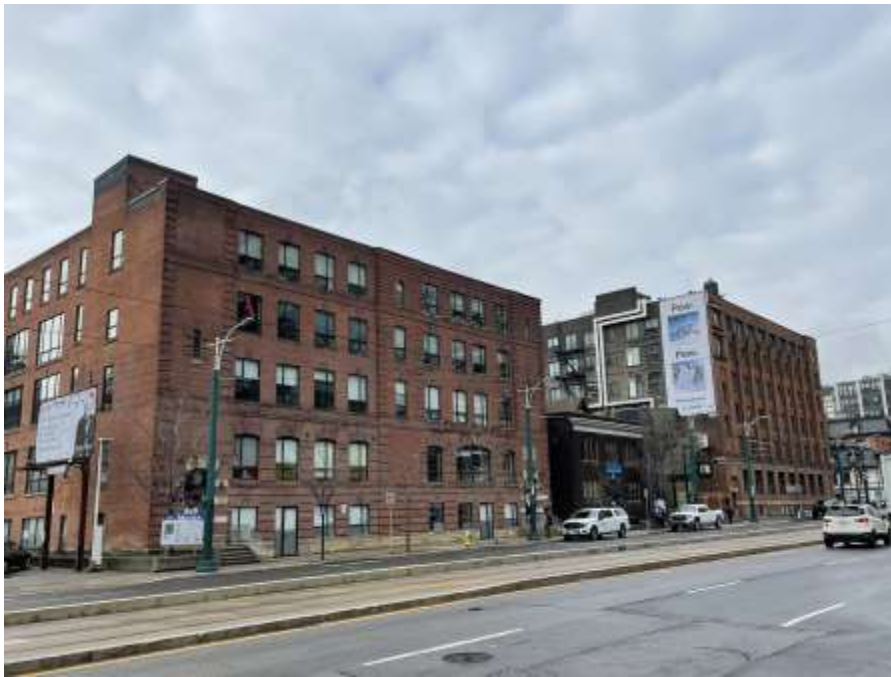
Figure 12: Northwestward view of the subject property within its streetscape on the west side of Spadina Avenue, with 46 Spadina Avenue at left; 425 King Street West visible at right, 2022.