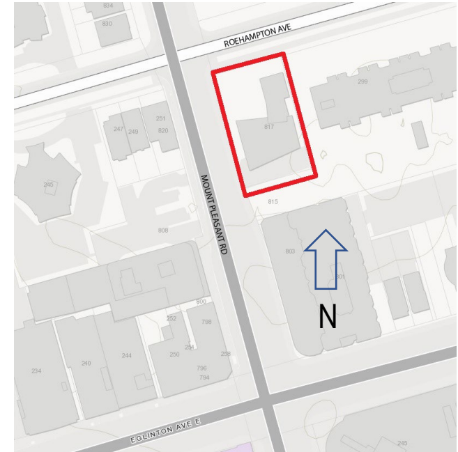
This location map is for information purposes only.

The subject property has design value as a representative example of a Mid-Century Modernist church. St. Peter's Estonian Lutheran Church was designed by Estonian-Canadian architect Michael Bach in 1955. The technical achievement of Bach's design includes the use of structural laminated wood beams arranged in a crossing pattern and terminating as pillars at grade. The Glulam arched beams and the wood roof decking are exposed within the interior, and the beams are visually represented in the copper-sheathed roof on the exterior.