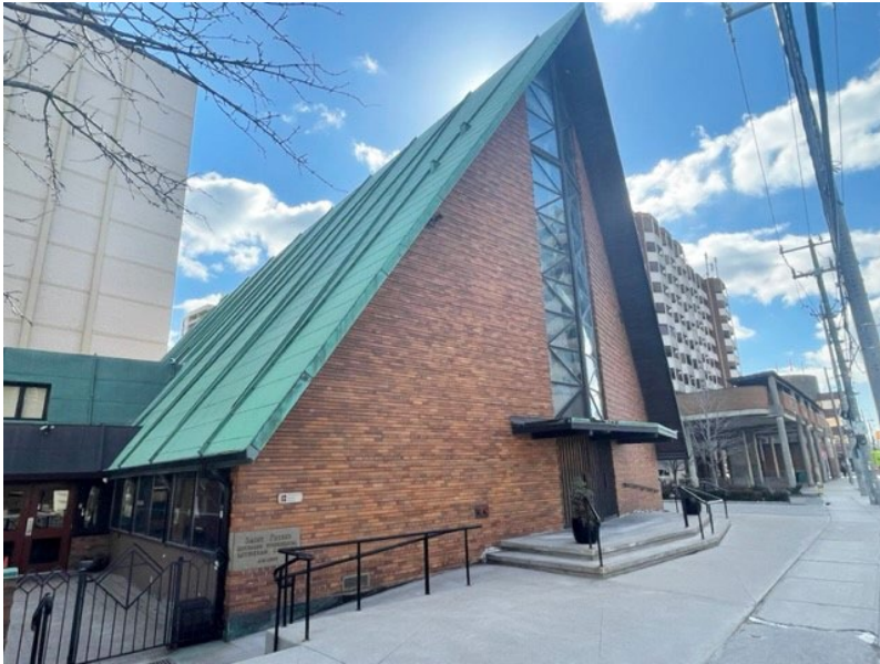
817 Mount Pleasant Road, Heritage Planning, 2023