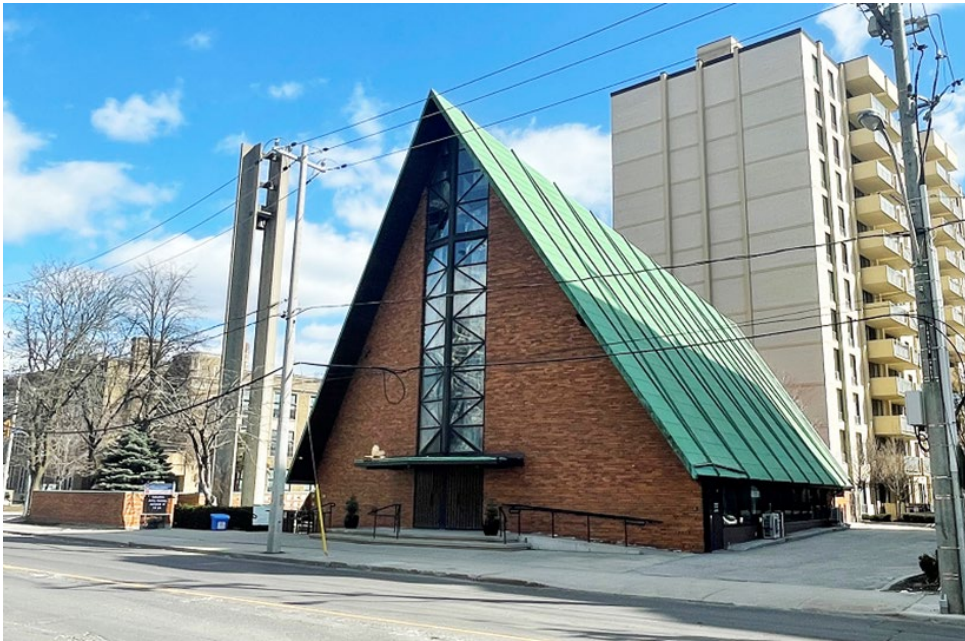
817 Mount Pleasant Road, Heritage Planning, 2023

The subject property has design value as a representative example of a Mid-Century Modernist church. St. Peter's Estonian Lutheran Church was designed by Estonian-Canadian architect Michael Bach in 1955. The technical achievement of Bach's design includes the use of structural laminated wood beams arranged in a crossing pattern and terminating as pillars at grade. The Glulam arched beams and the wood roof decking are exposed within the interior, and the beams are visually represented in the copper-sheathed roof on the exterior.