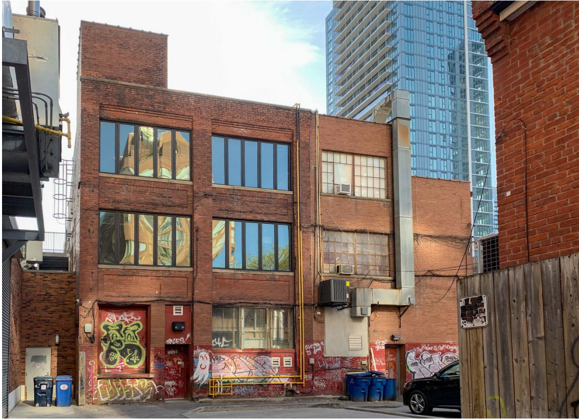
Figure 15. Rear (west elevation of 678-680 Yonge Street, showing the warehouses constructed by Jacob Yolles (Heritage Planning, 2023).