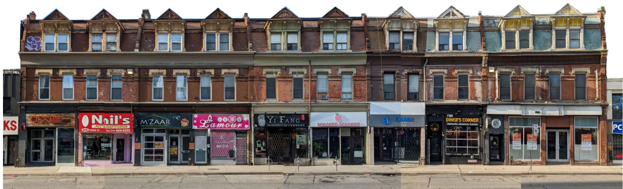
Figure 8. Composite image of 664-680 Yonge Street (Heritage Planning, 2023).