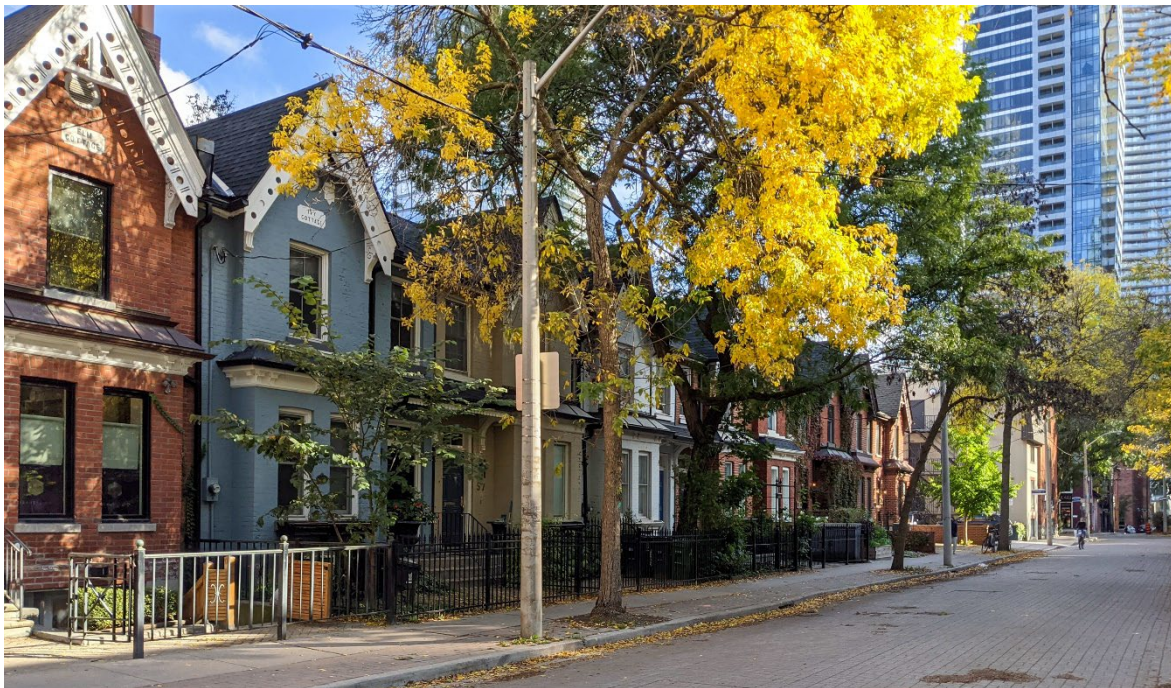
Figure 18. Row of cottages on St Nicholas Street, constructed in 1883 by the Scottish Ontario and Manitoba Land Company (Heritage Planning, 2022).