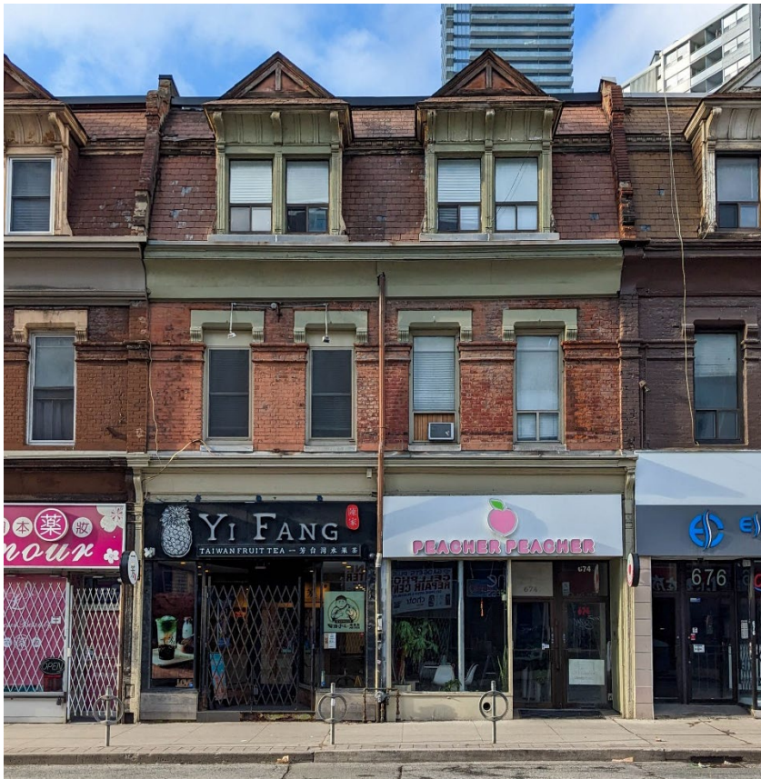
Figure 11. Primary (east) elevation of 672 Yonge Street (Heritage Planning, 2023).