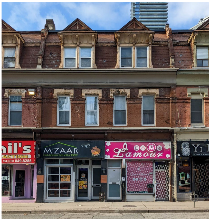
Figure 10. Primary (east) elevations of 668-670 Yonge Street (Heritage Planning, 2023).