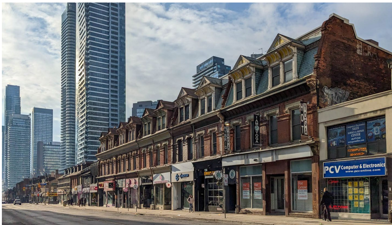
View of the subject properties at 664-680 Yonge Street, looking southwest

While the research and evaluation of the properties referenced above is, in staff's determination, sufficient to support the designation of the properties at 664, 666, 668, 670, 672 (including structure address at 674), 676, 678 and 680 (including entrance address at 682) Yonge Street, it should be noted that new and additional relevant information on the subject properties further expanding on their cultural heritage value following community input and additional access to archival records may be incorporated in the final version of a Part IV designation by-law.