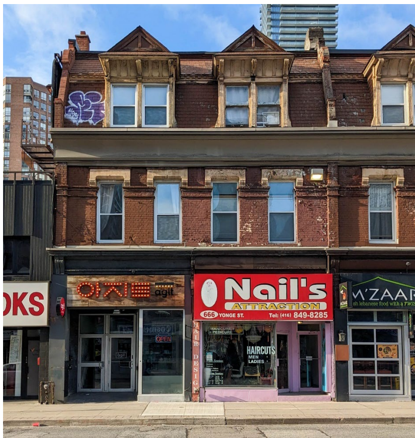
Figure 9. Primary (east) elevations of 664-666 Yonge Street (Heritage Planning, 2023).