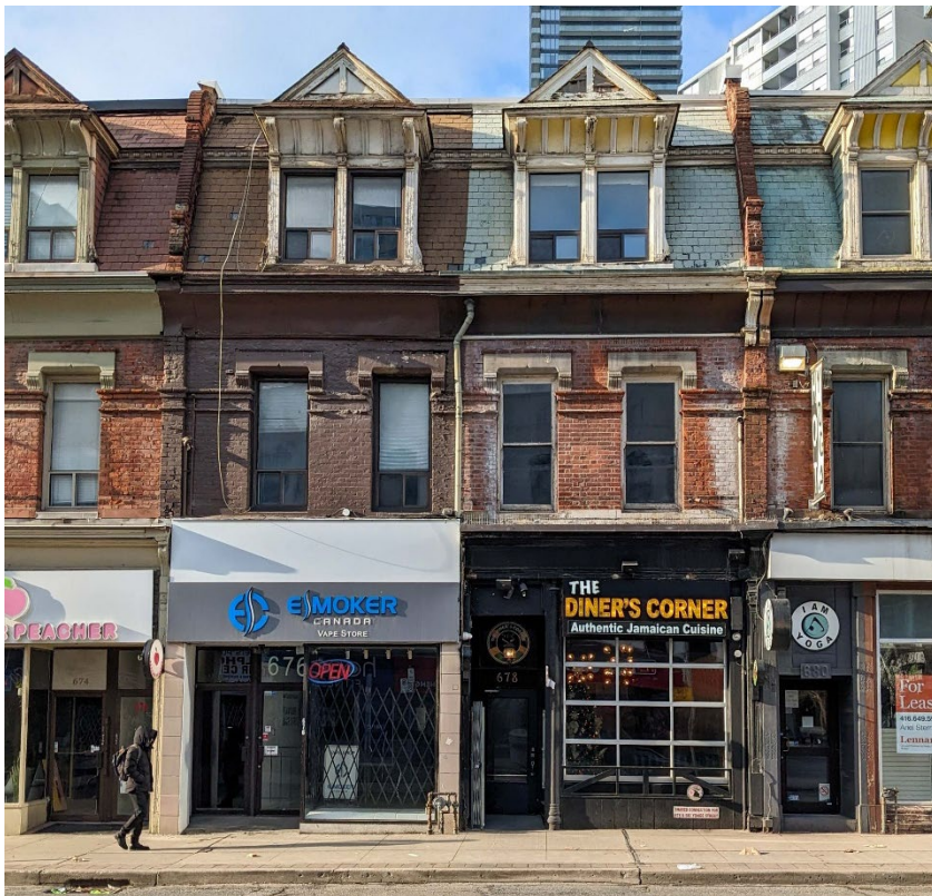
Figure 12. Primary (east) elevations of 676-678 Yonge Street (Heritage Planning, 2023).