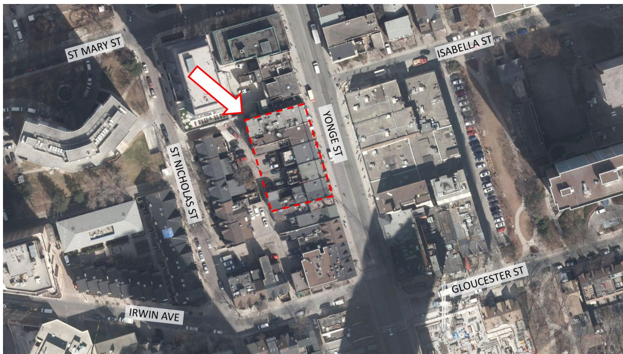
Figure 2. Aerial View (base image 2018) showing the location of the properties on Yonge Street midblock between Irwin Avenue and St Mary Street. The approximate boundary of the properties is outlined in red (City of Toronto Mapping).