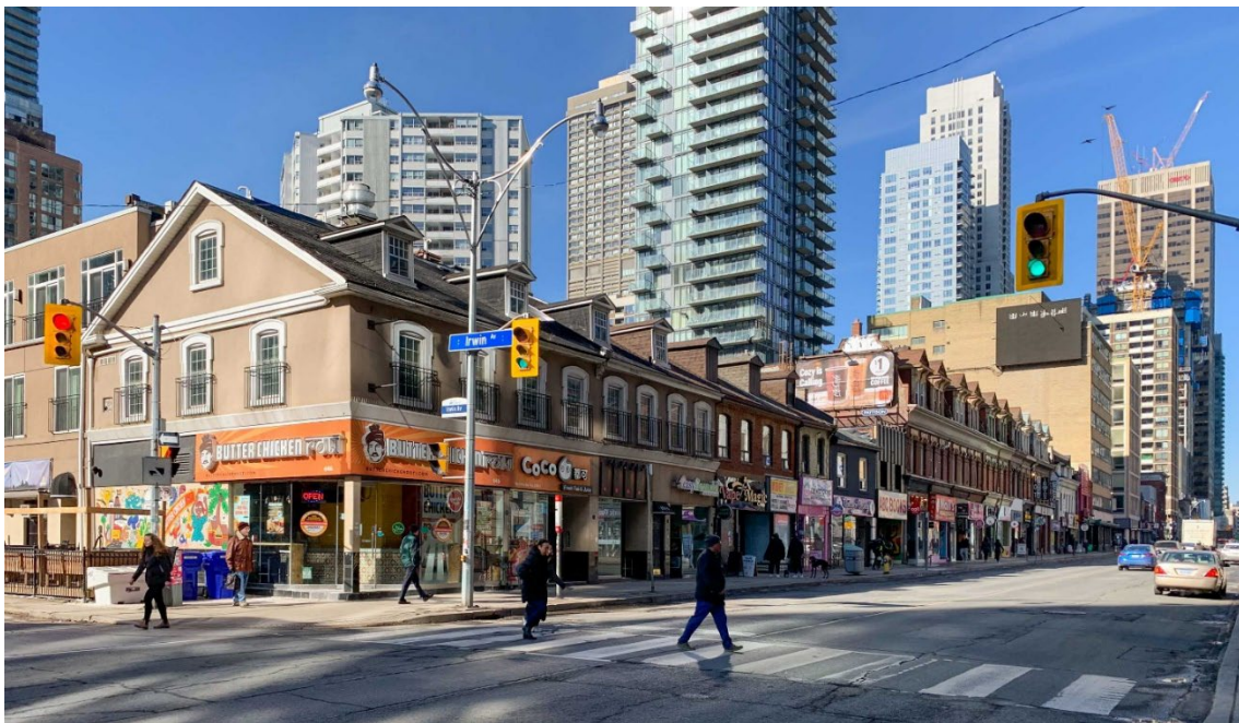
Figure 16. View of the west side of Yonge Street at Irwin Avenue/Gloucester Street, looking northwest towards the subject properties (Heritage Planning, 2022). The properties at 646-658 Yonge Street and the subject properties at 664-680 Yonge Street are both examples of the groupings of row properties found on this portion of Yonge Street.