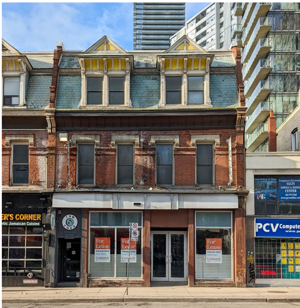
Figure 13. Primary (east) elevation of 680 Yonge Street (Heritage Planning, 2023).