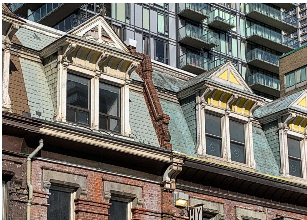
Figure 14. Detail of dormers, 678-680 Yonge Street (Heritage Planning, 2023).