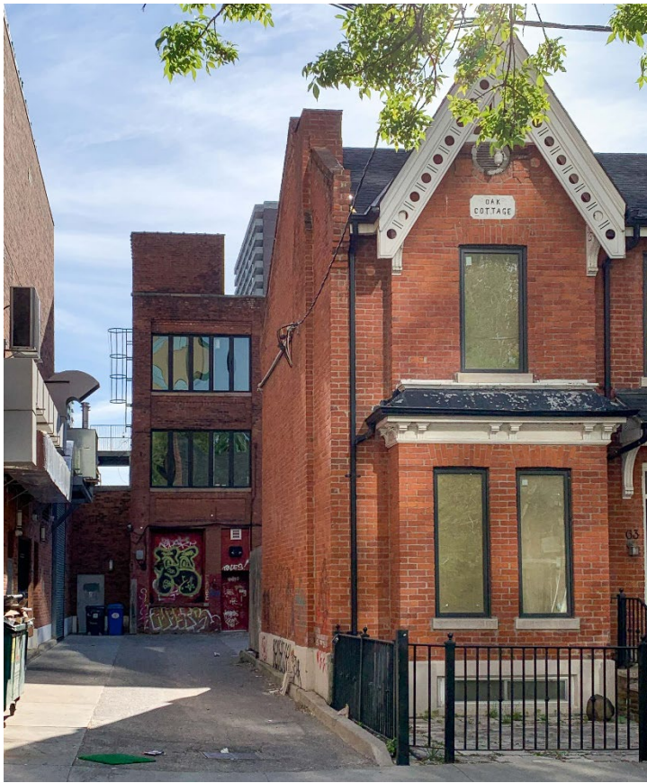
Figure 17. West elevation of 680 Yonge Street as viewed from St Nicholas Street, with one of the Scottish Ontario and Manitoba Land Company Cottages visible on the right (Heritage Planning, 2023).