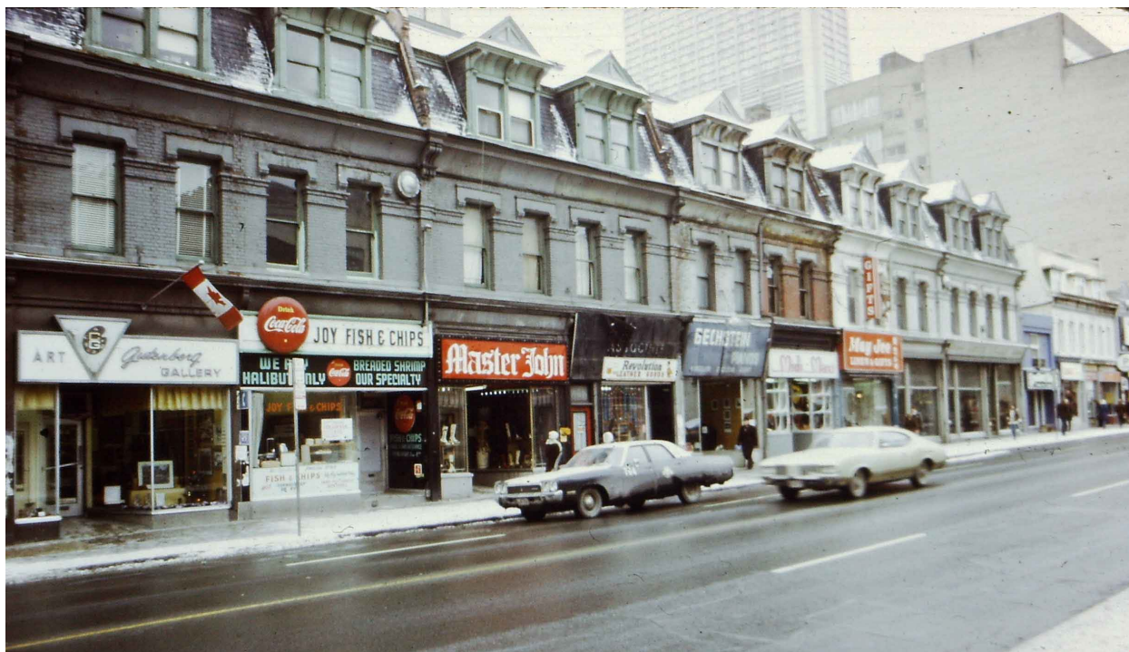
Figure 5. Archival photograph from 1974, showing 664-680 Yonge Street.