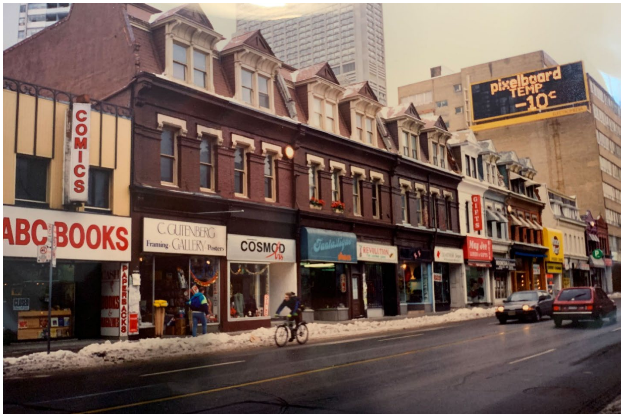
Figure 7. Archival photograph from 1991, showing 664-680 Yonge Street (City of Toronto Archives).