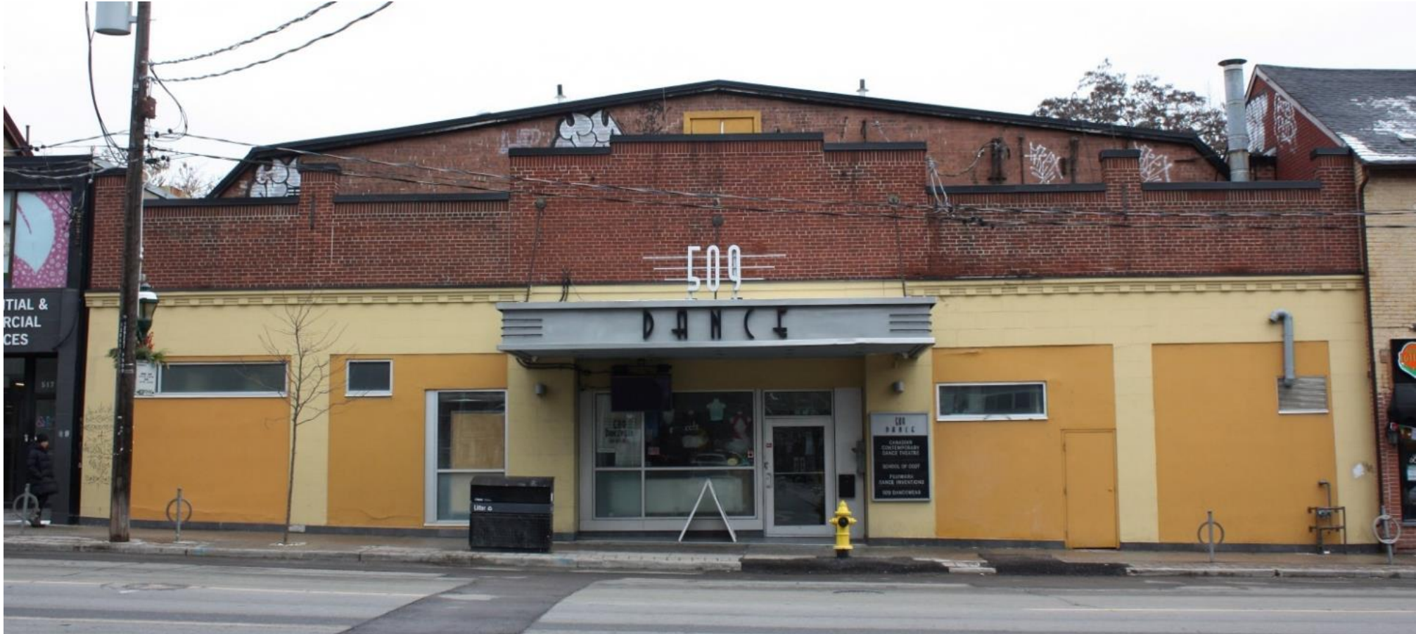
509 Parliament Street (Heritage Planning, 2023)