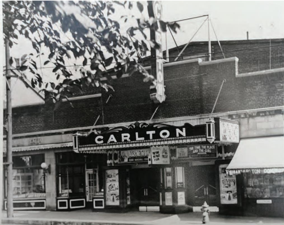
1937 image showing historic façade appearance

FIRST BILL IS ACCLAIMED IN ALL-BRITISH THEATRE