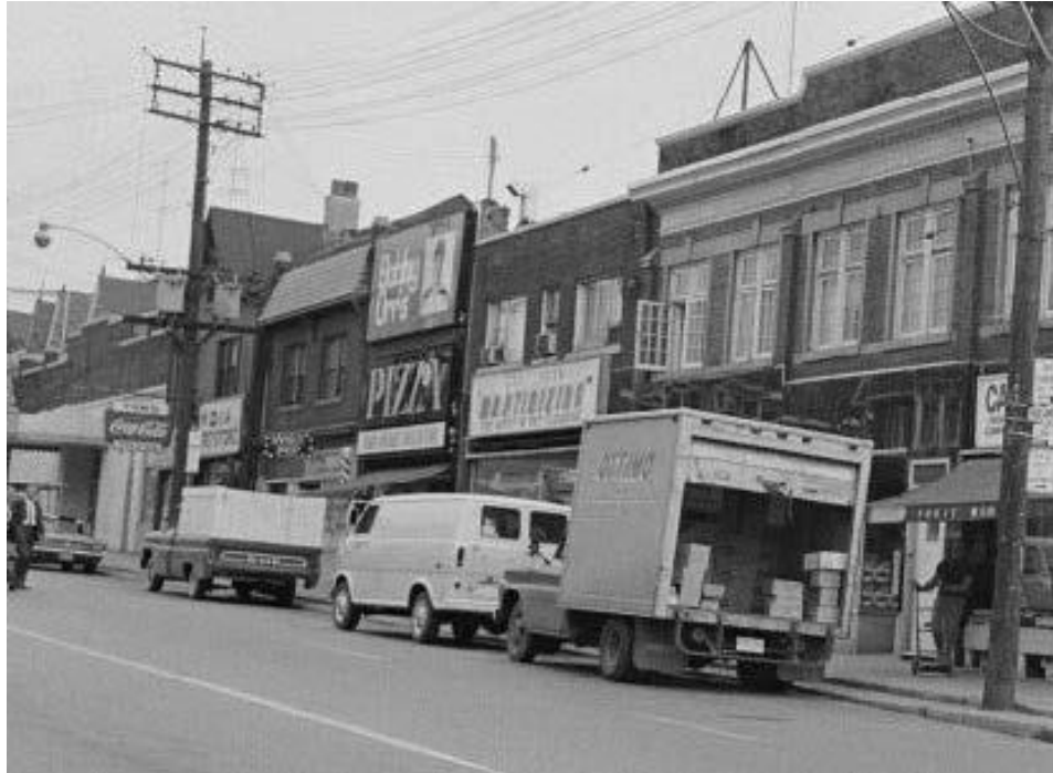
Contextual view of east side of 500 blk Parliament Street (HIA – ERA Architecture / City of Toronto Archives)