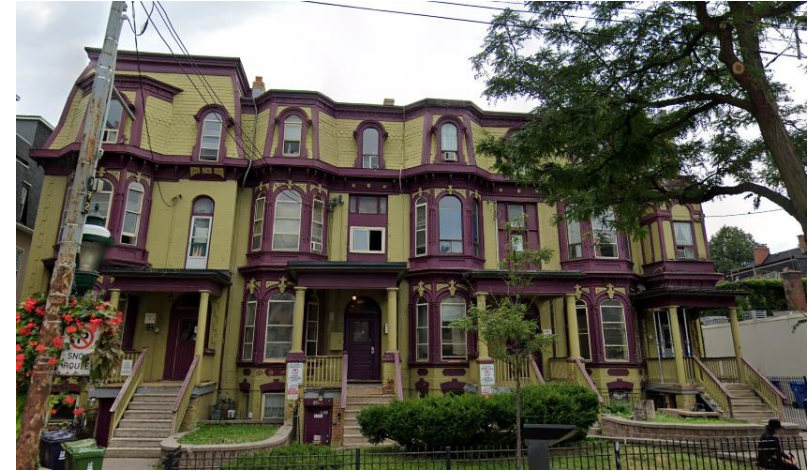
Adjacent context - 502-508 Parliament Street, built 1879; Register listed 1975 (Google maps)