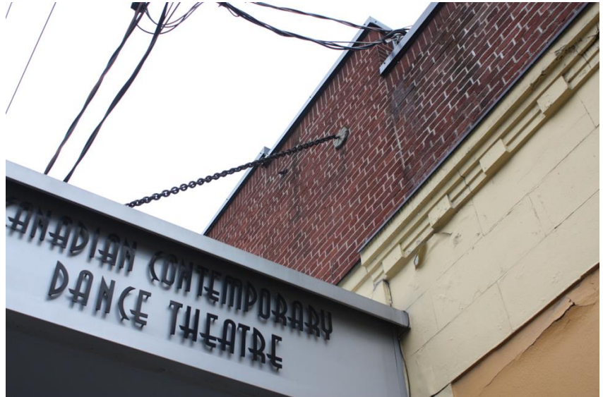
Detail image of main façade showing cast-stone storefront detailing and classical cornice (Heritage Planning, 2023)