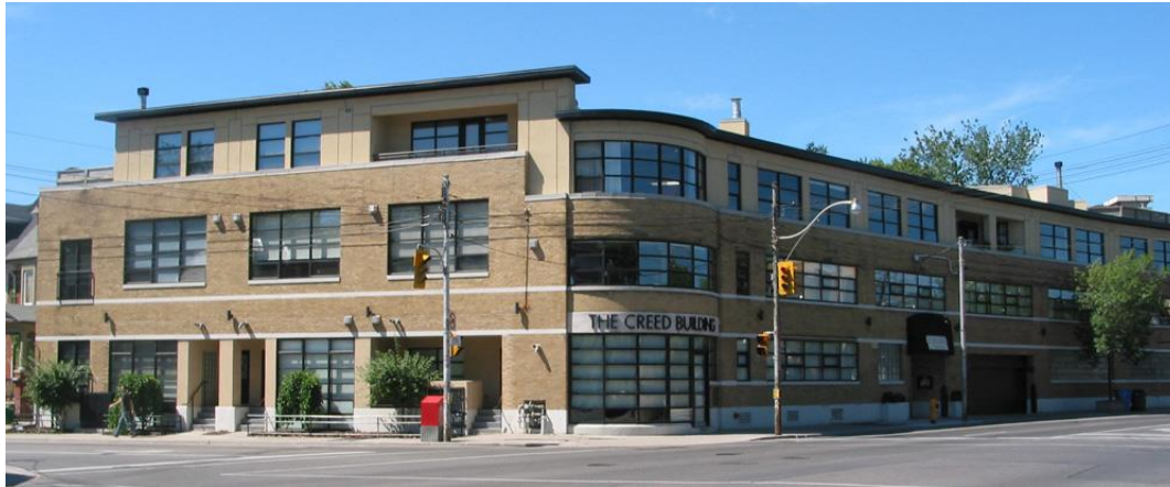
Creeds Furs Building, 1937 – 295 Davenport Road; extant, Register-listed 1997