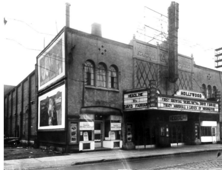
Hollywood Theatre, 1930 – Yonge / Heath Streets, demolished