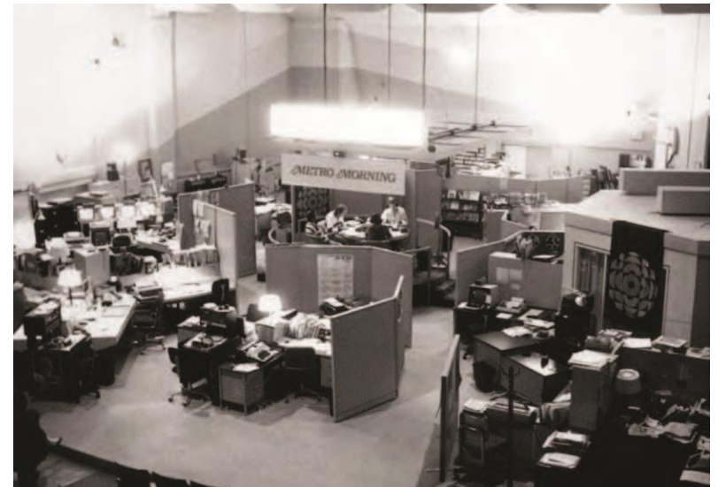
509 Parliament St as a CBC studio, showing Metro Morning set c. 1970s (nd, CBC)