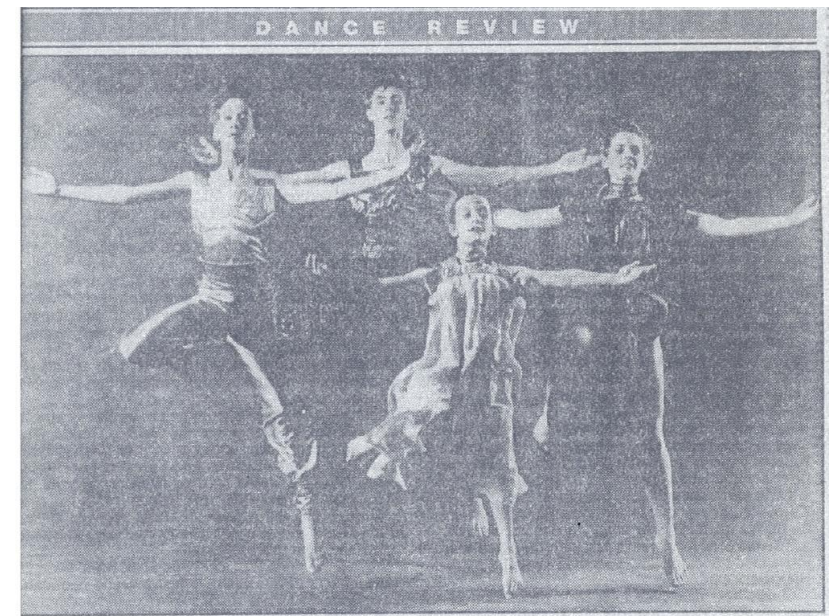
Members of the Canadian Children's Dance Theatre in David Earle's Chichester Psalms: a national treasure. Canadian Children's Dance Theatre - occupant of 509 Parliament St. 1995- present

Feb. 17, 1934 Globe and Mail newspaper headline