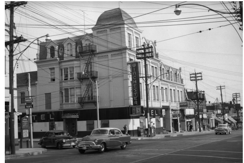
Contextual view from north showing 1888 Winchester (Lakeview) Hotel, designated 1995 (1954,)