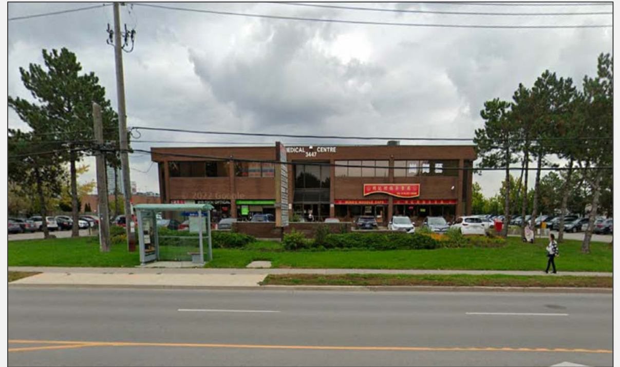
View facing East, across from Kennedy Road towards the Subject Site