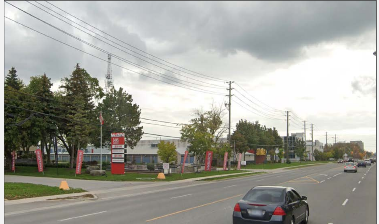
Area context, to the south of the Subject Site along Kennedy Road