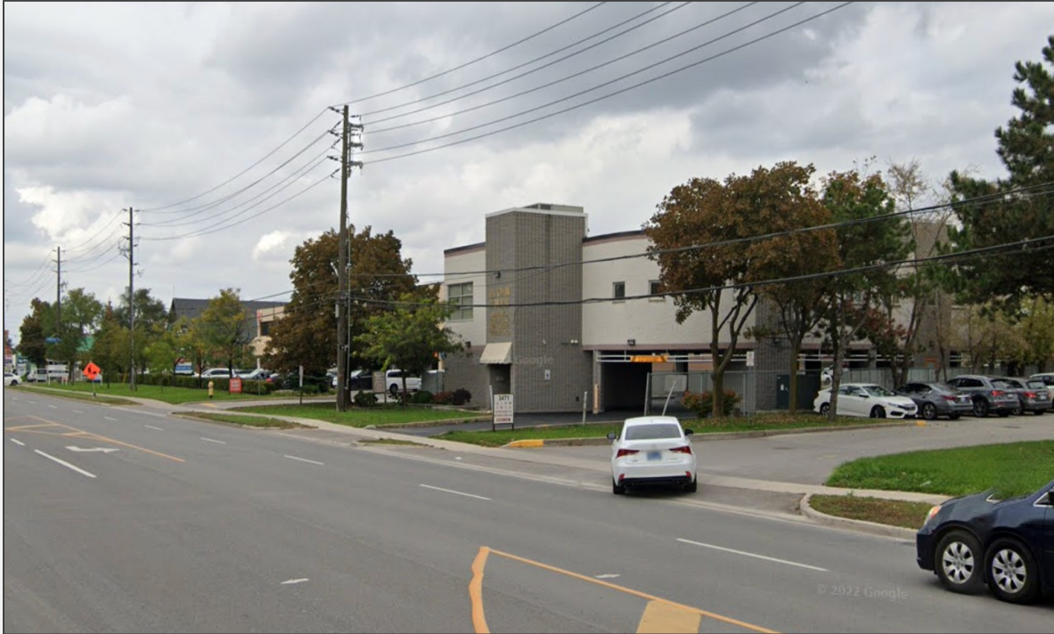
Area context, to the north of the Subject Site along Kennedy Road