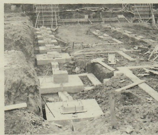
LATEST ON-SITE PHOTO - Further progress has been made since this picture was taken. Why not visit the scene and see for yourself.