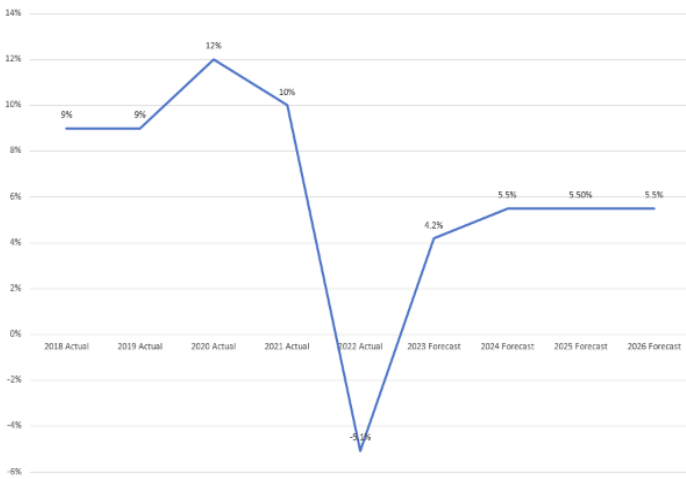
Portfolio Annual Return