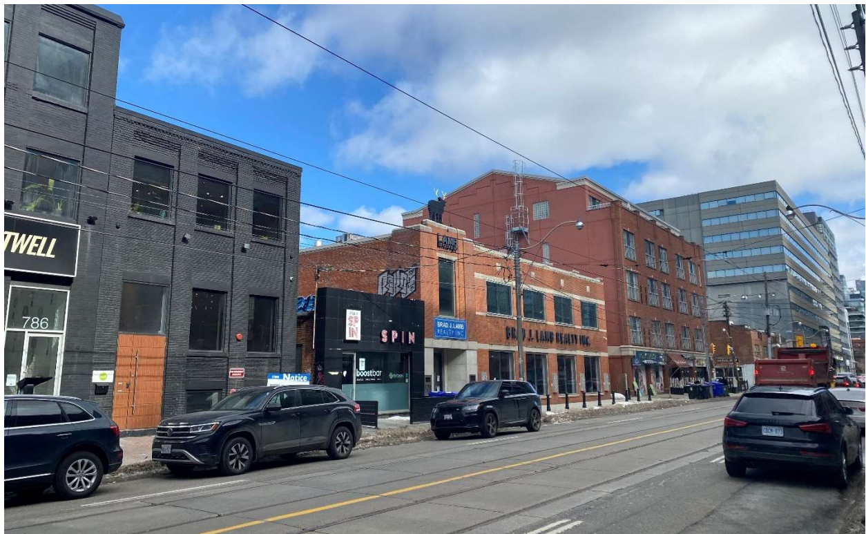
Northeastward view of 778 King Street West Context. West elevation in view.