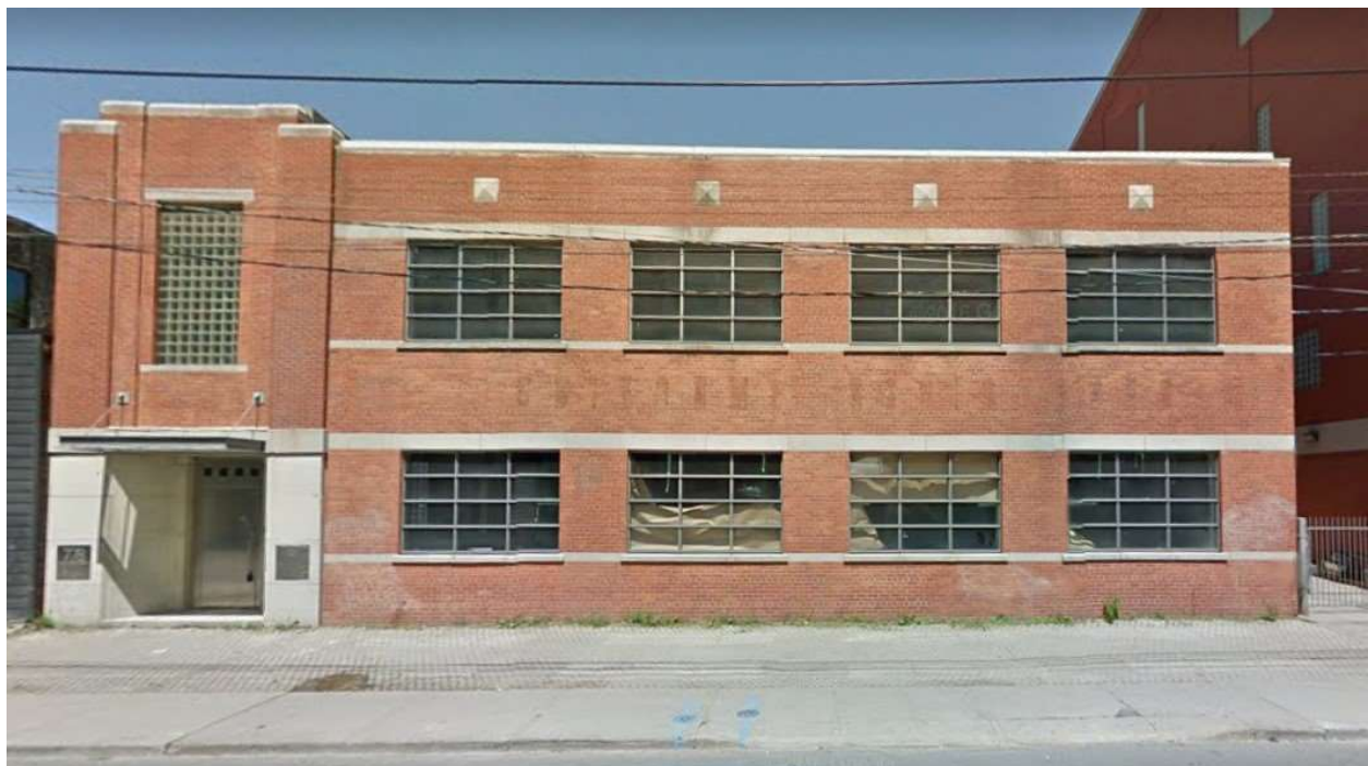
Primary South Elevation of 778 King Street West in 2013 with divided lite windows. Divided (simulated) lite windows proposed to be reinstated at this façade.