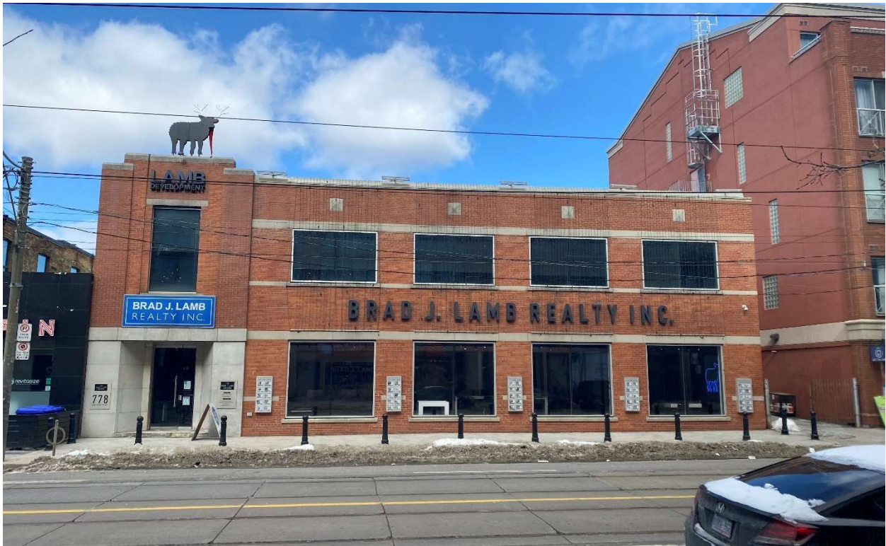
Primary (south) elevation of 778 King Street West (Heritage Planning, 2022).