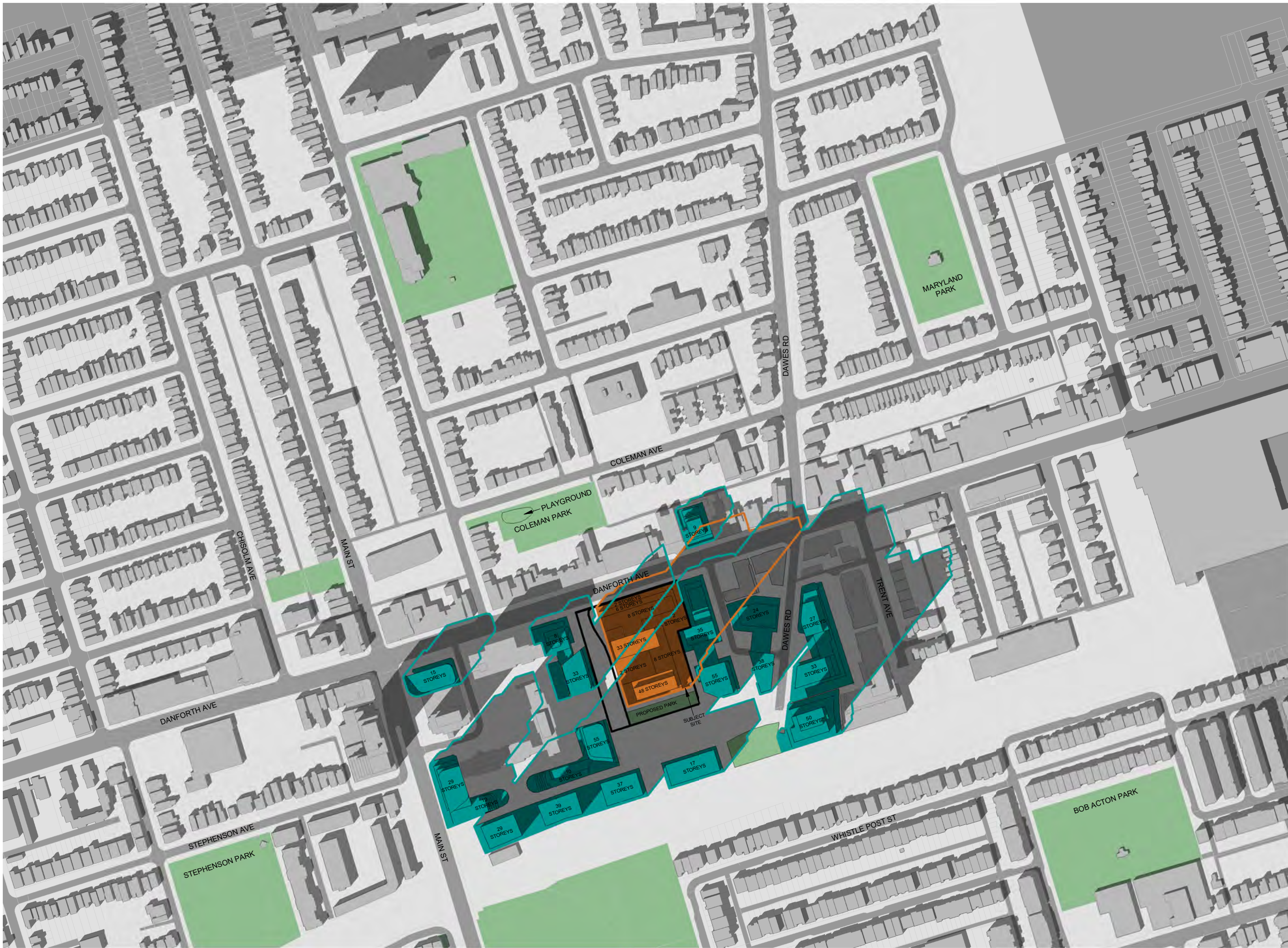
3 MARCH 21 - 03:18 PM RZ812 1 : 3500