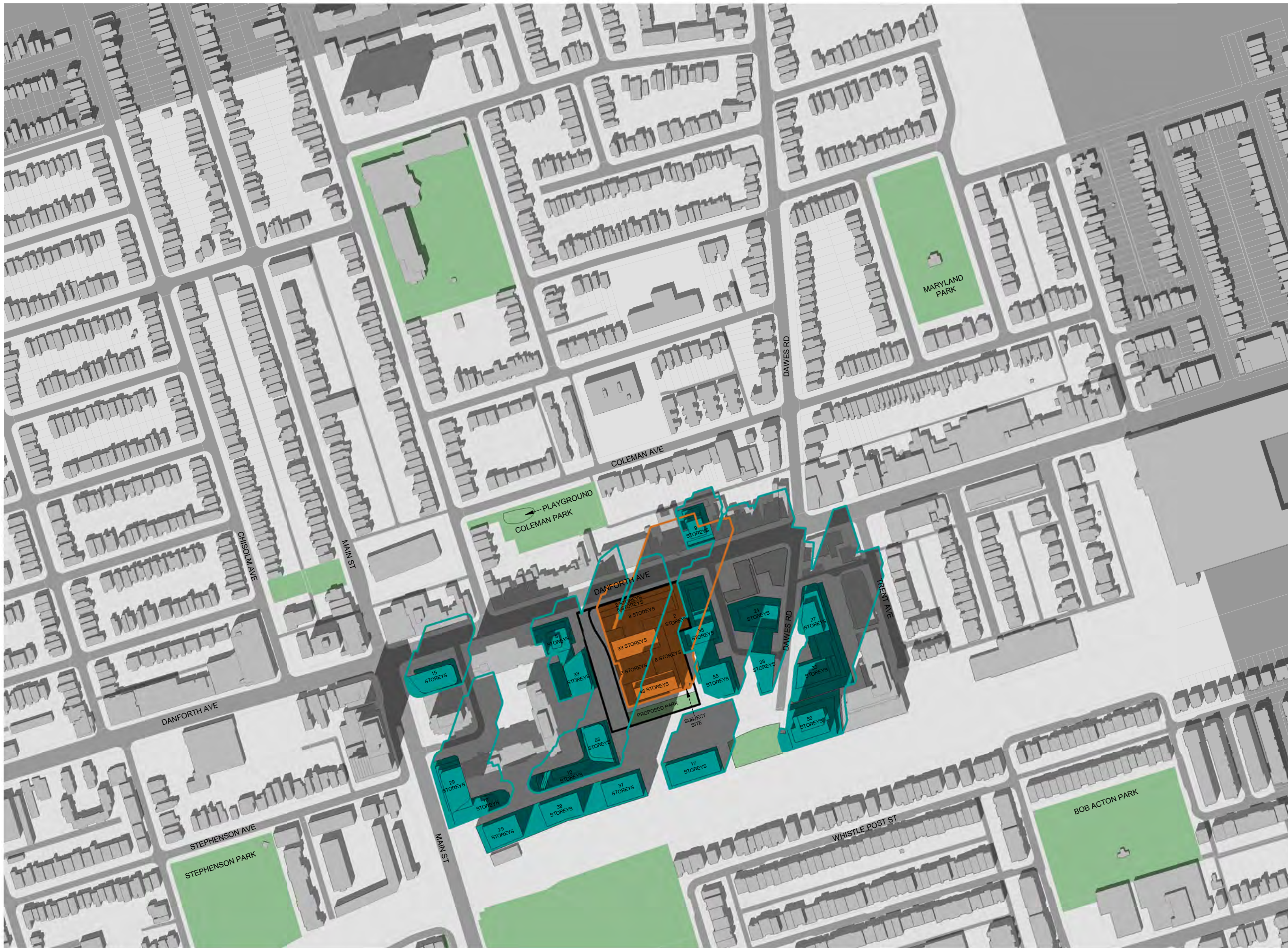
2 MARCH 21 - 02:18 PM RZ812 1 : 3500