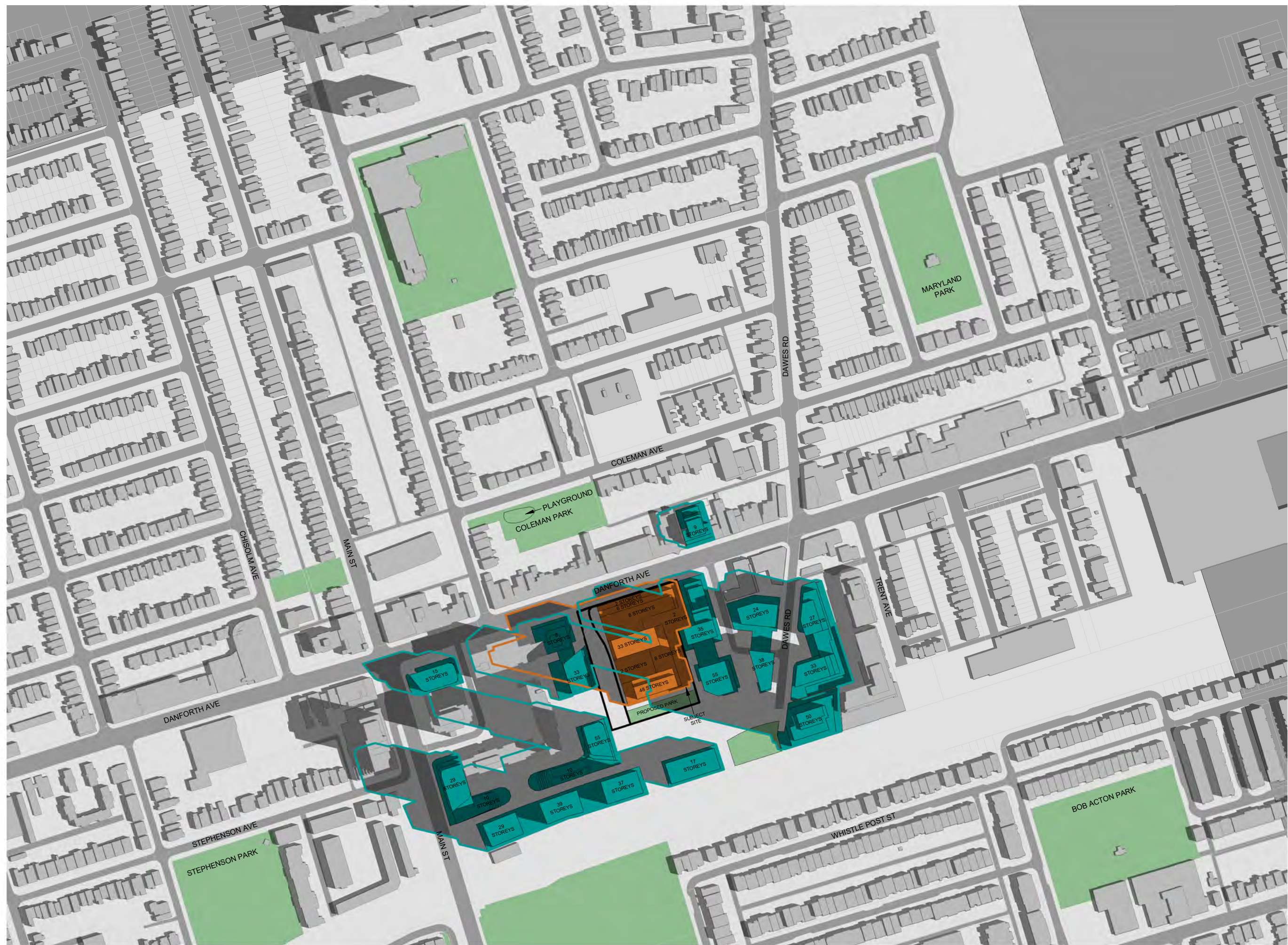
2 JUNE 21 - 10:18 AM RZ814/ 1 : 3500