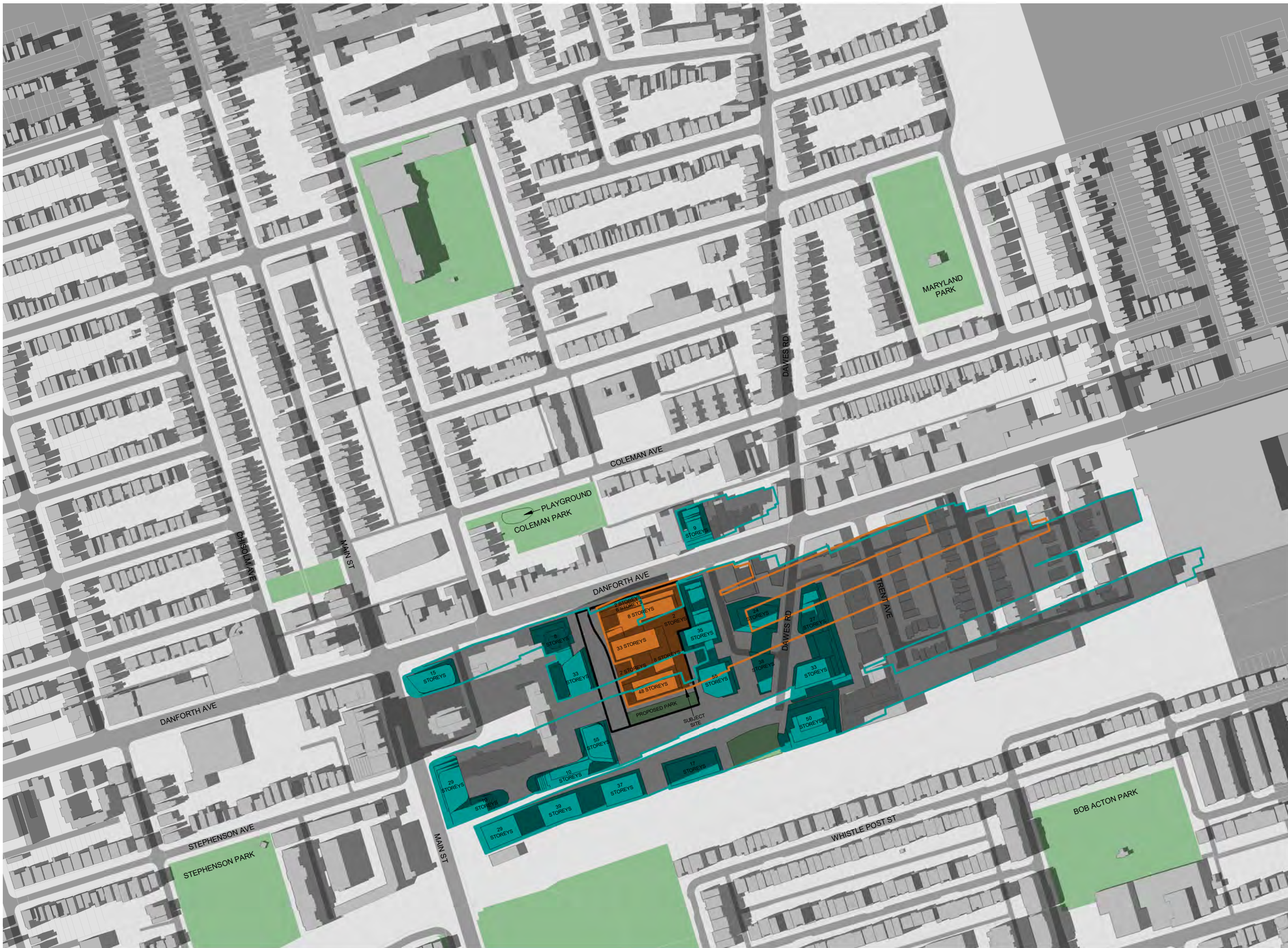
1 MARCH 21 - 05:18 PM RZ813 1 : 3500