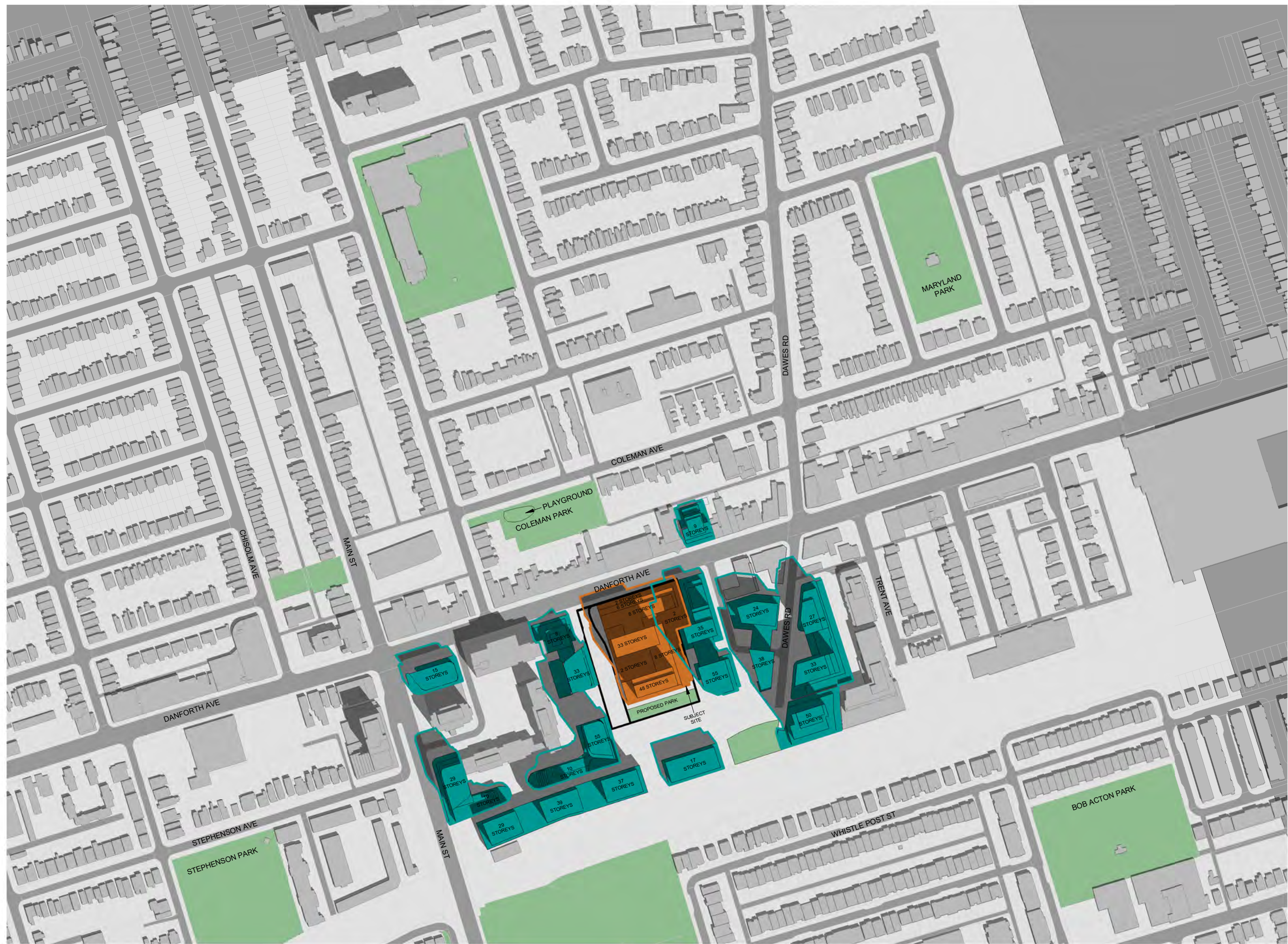
4 JUNE 21 - 12:18 PM RZ814/ 1 : 3500