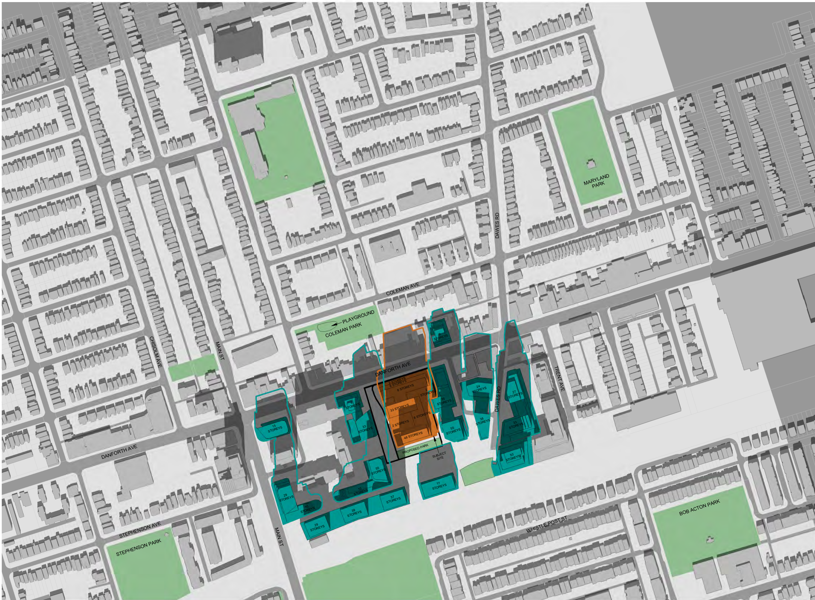
1 MARCH 21 - 01:18 PM RZ812 1 : 3500