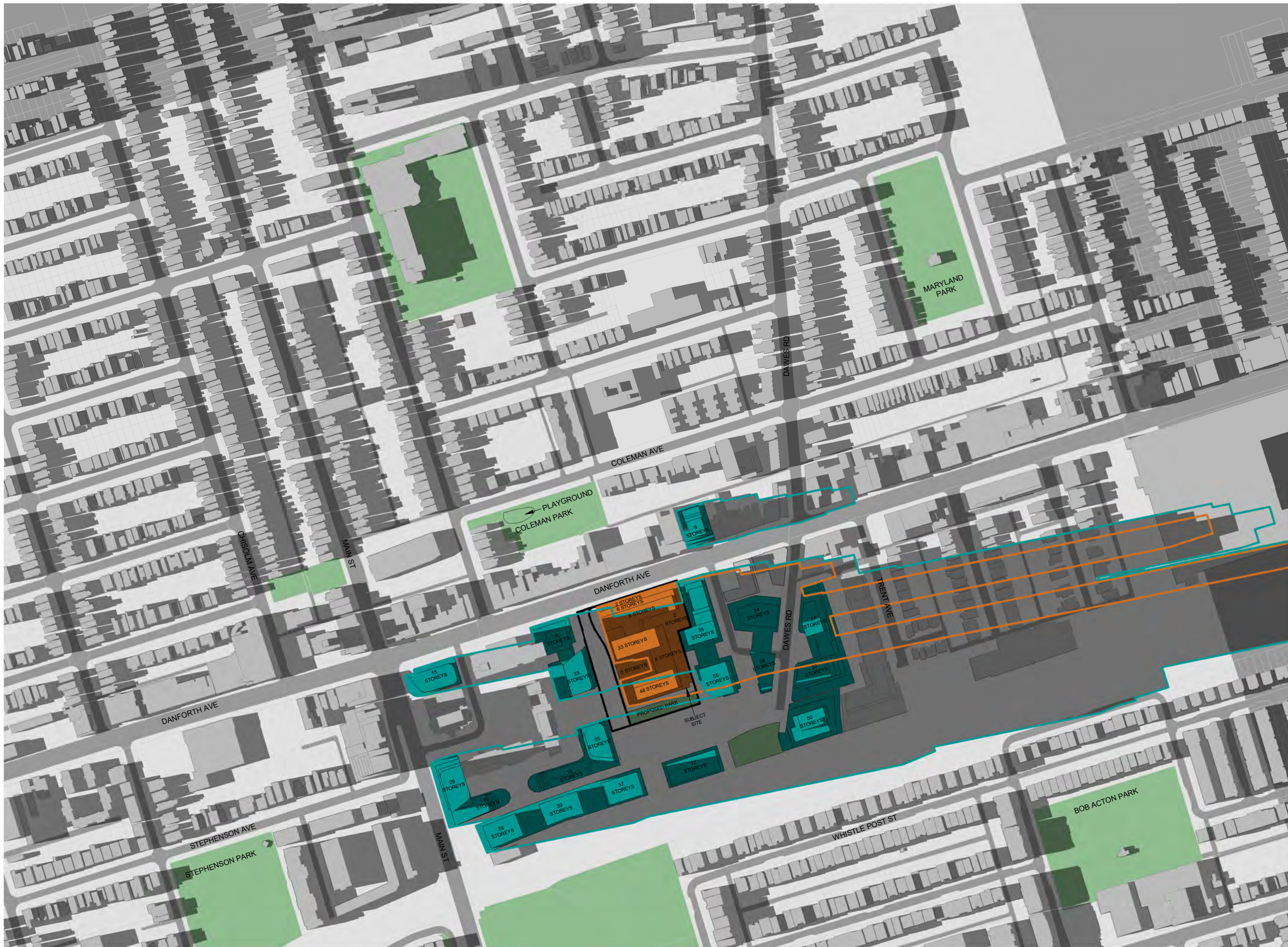
2 MARCH 21 - 06:18 PM RZ813 1 : 3500

This drawing, as an instrument of service, is provided by and is the property of Turner Fleischer Architects Inc. The contractor must verify and accept responsibility for all dimensions and conditions on site and must notify Turner Fleischer Architects Inc. of any variations from the supplied information. This drawing is not to be scaled. The architect is not responsible for the accuracy of survey, structural, mechanical, electrical, etc., information shown on this drawing. Refer to the appropriate consultant's drawings before proceeding with the work. Contractor must conform to all applicable codes and requirements of authorities having jurisdiction. The contractor working from drawings not specifically marked "For Construction" must assume full responsibility and bear costs for any corrections or damages resulting from his work.