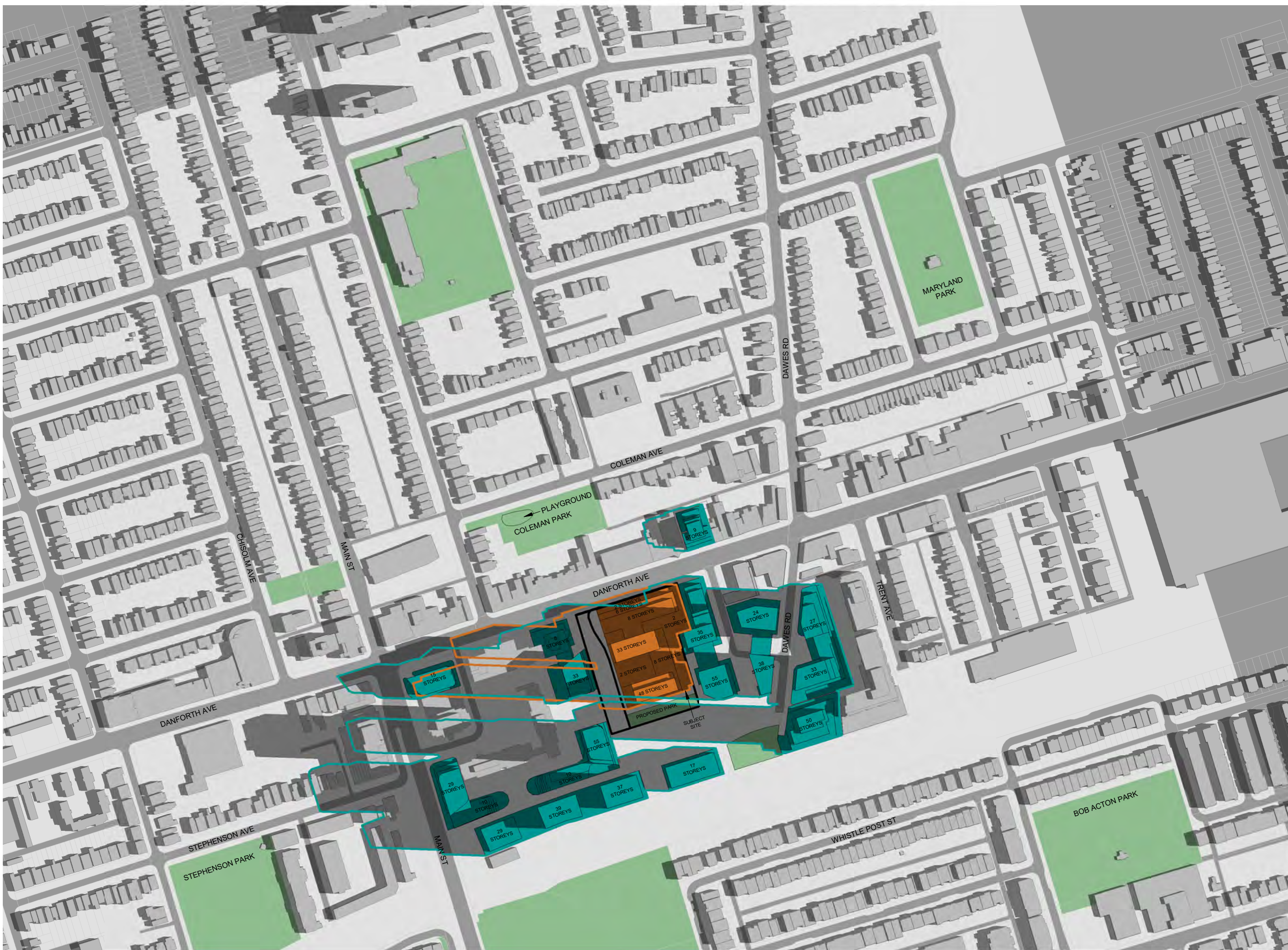
1 JUNE 21 - 09:18 AM RZ814/ 1 : 3500