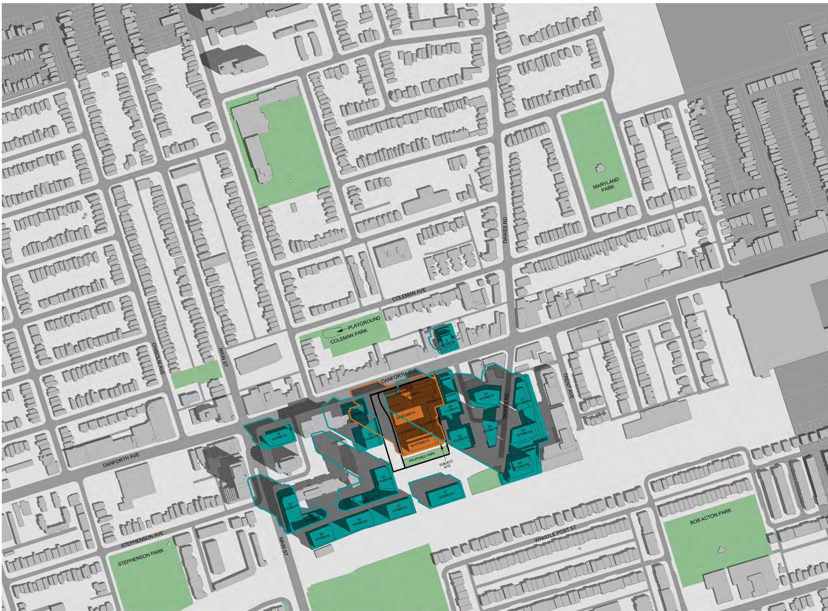
3 JUNE 21 - 11:18 AM RZ814/ 1 : 3500