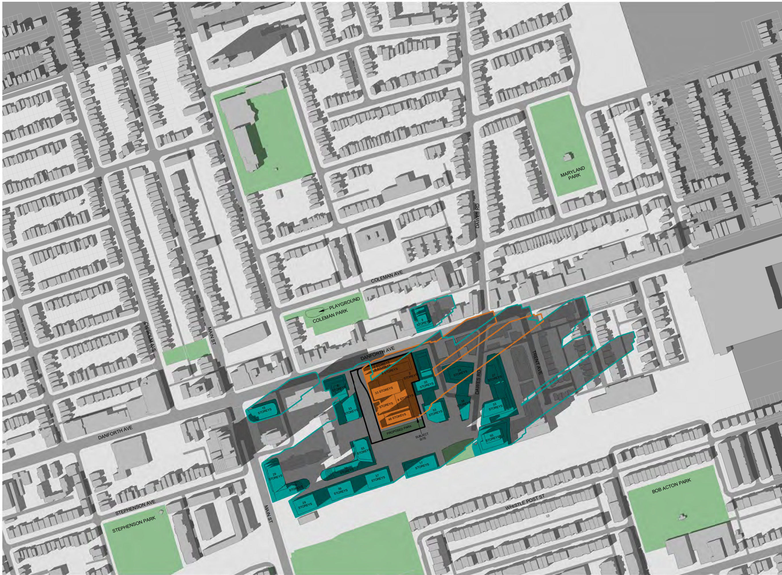
4 MARCH 21 - 04:18 PM RZ812 1 : 3500