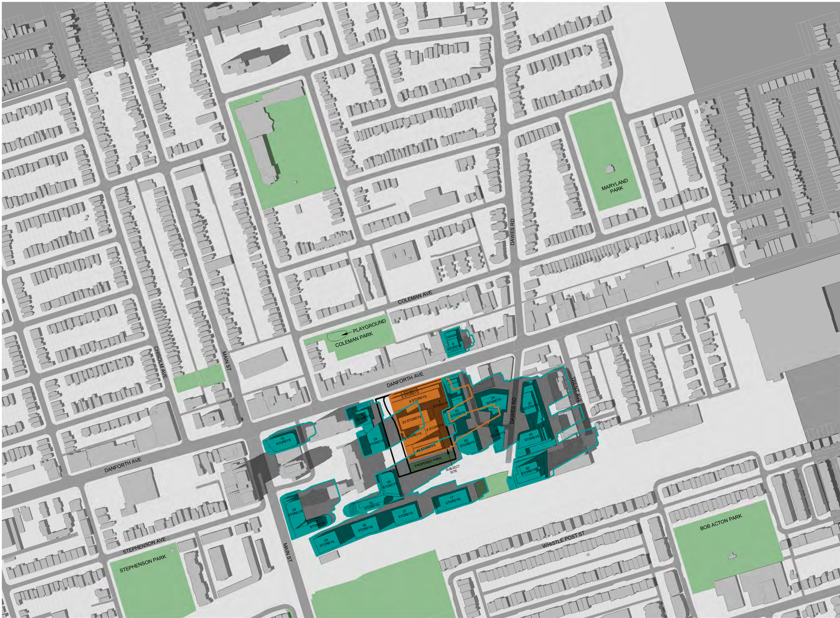
3 JUNE 21 - 03:18 PM RZ815/ 1 : 3500