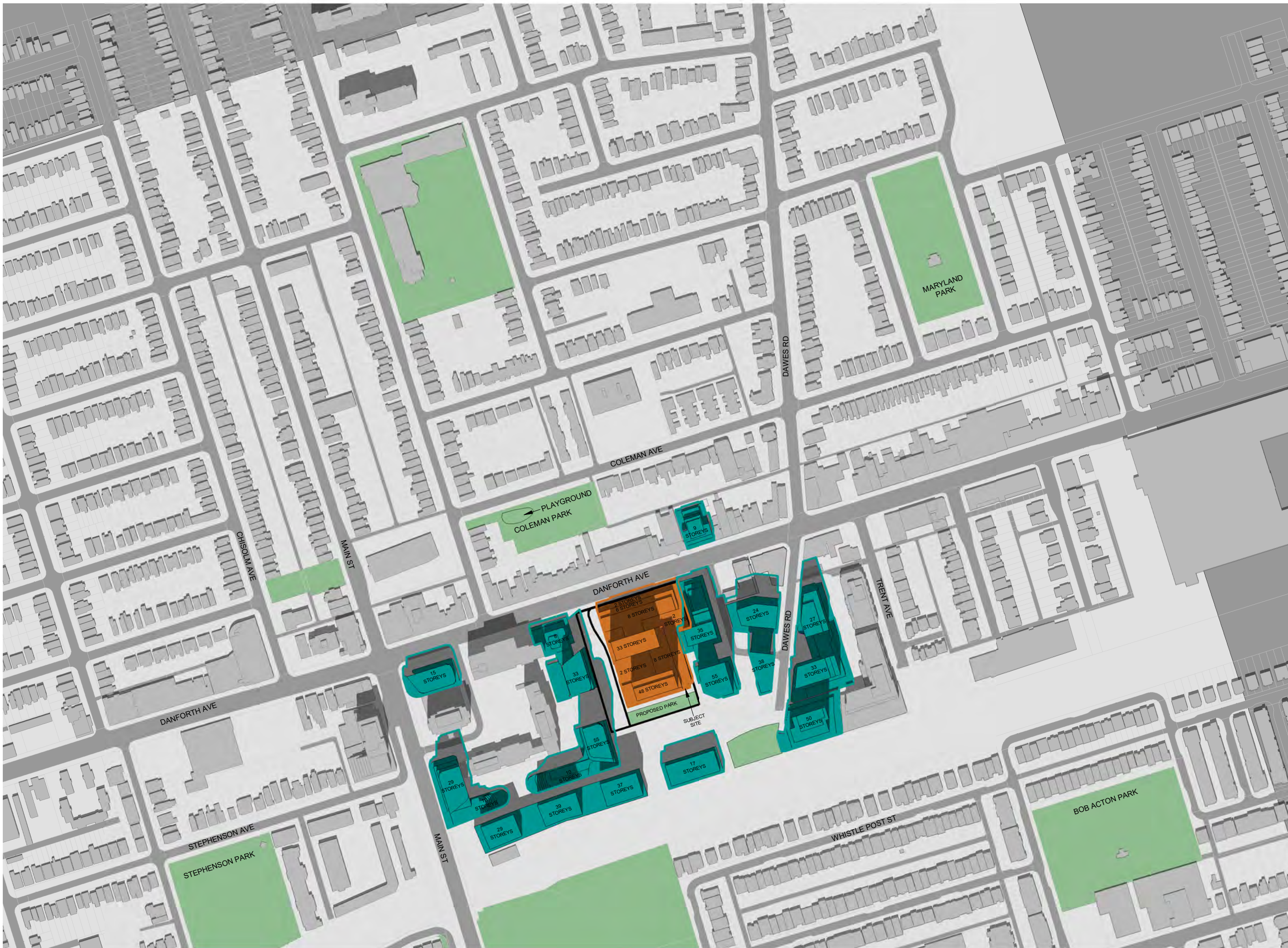
1 JUNE 21 - 01:18 PM RZ815/ 1 : 3500