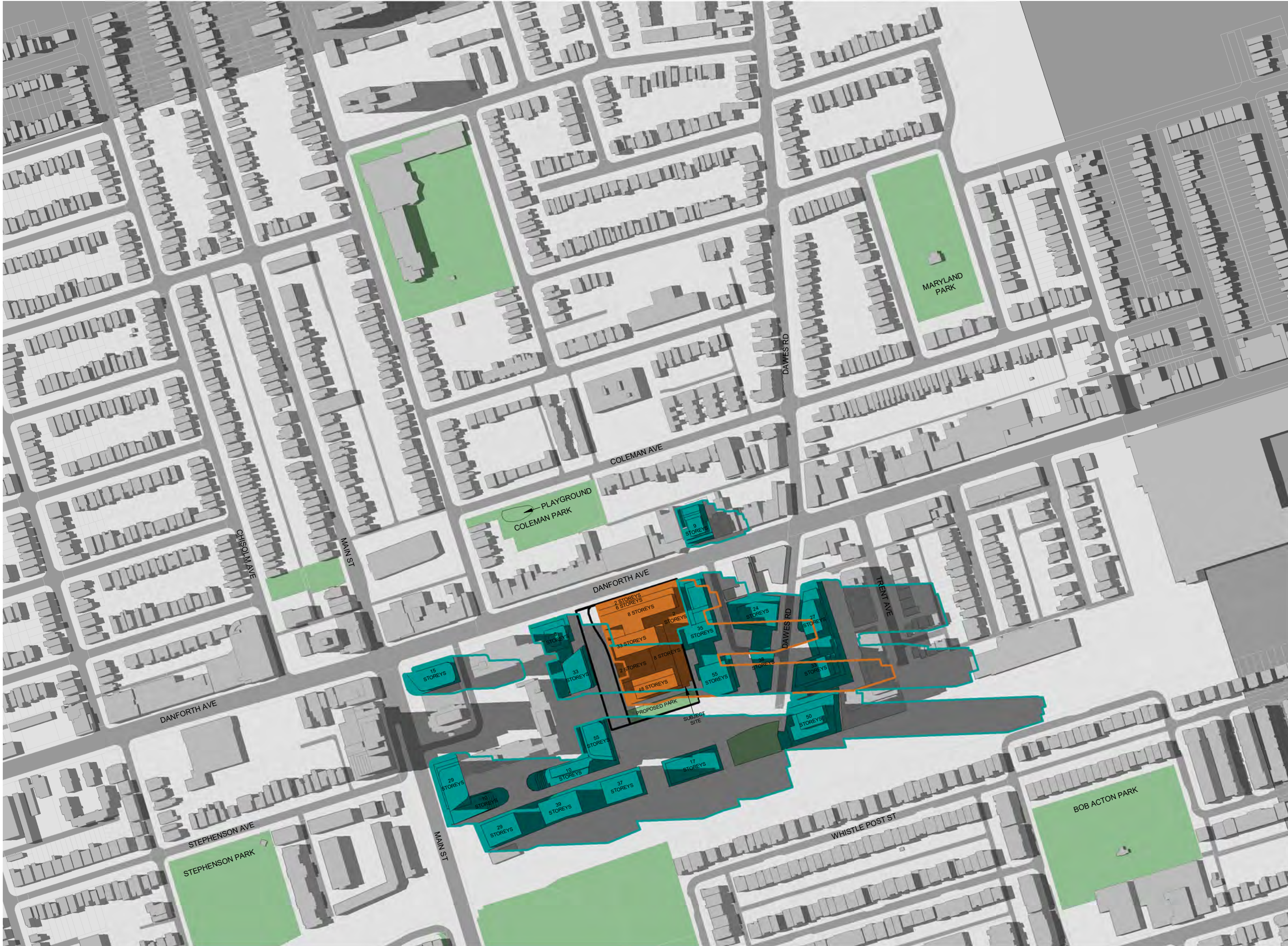
1 JUNE 21 - 05:18 PM RZ816 1 : 3500