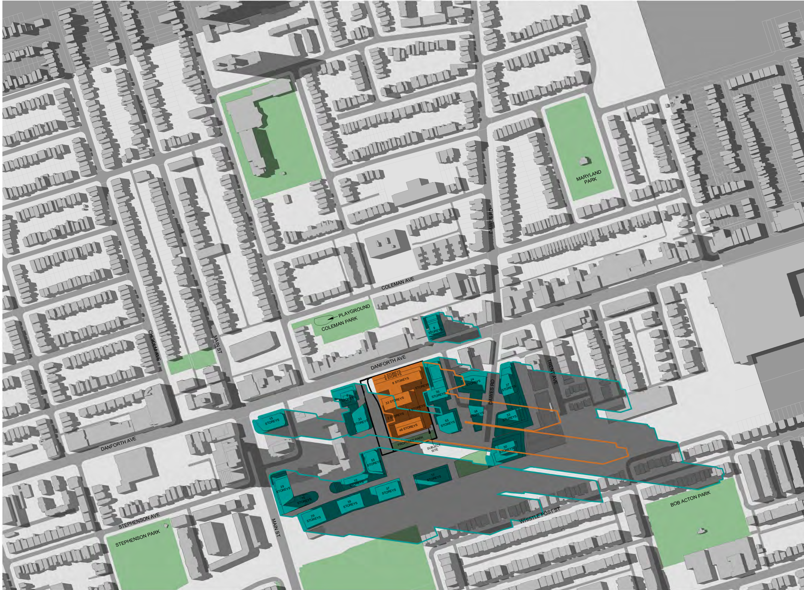
2 JUNE 21 - 06:18 PM RZ816 1 : 3500

This drawing, as an instrument of service, is provided by and is the property of Turner Fleischer Architects Inc. The contractor must verify and accept responsibility for all dimensions and conditions on site and must notify Turner Fleischer Architects Inc. of any variations from the supplied information. This drawing is not to be scaled. The architect is not responsible for the accuracy of survey, structural, mechanical, electrical, etc., information shown on this drawing. Refer to the appropriate consultant's drawings before proceeding with the work. Contractor must conform to all applicable codes and requirements of authorities having jurisdiction. The contractor working from drawings not specifically marked "For Construction" must assume full responsibility and bear costs for any corrections or damages resulting from his work.