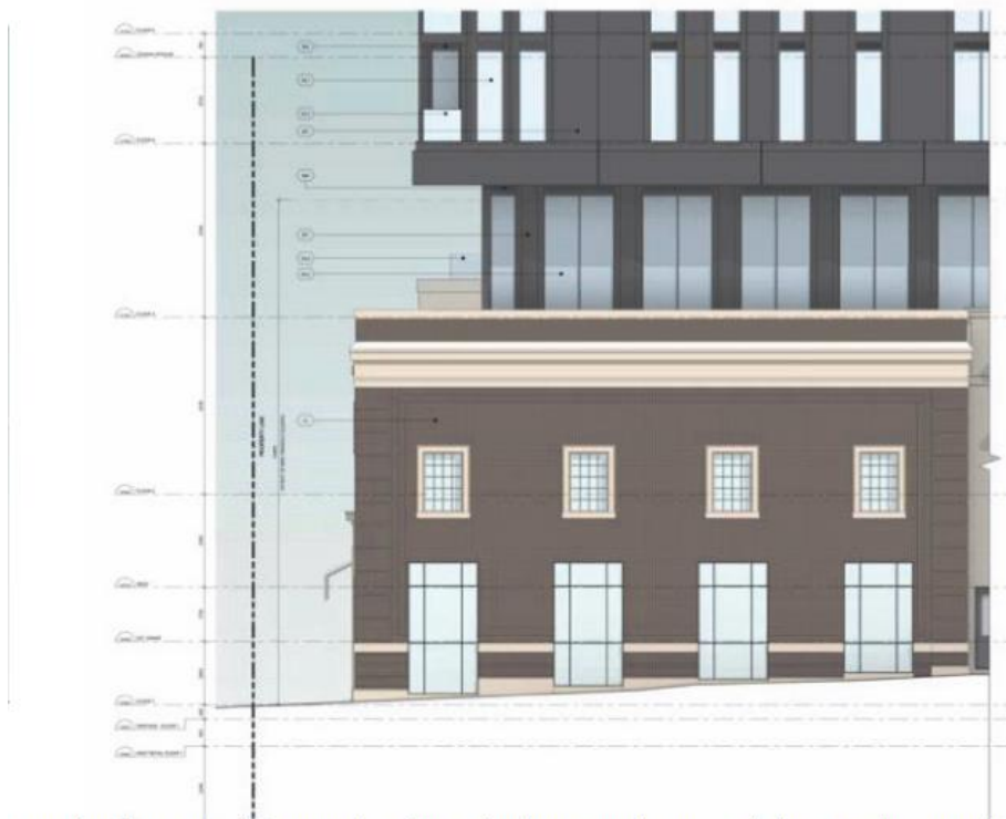
East elevation: Detail showing the relationship between the retained elevation along Duplex Avenue and the proposed tower above.

(Heritage Impact Assessment, GBCA Architects, March 2024)