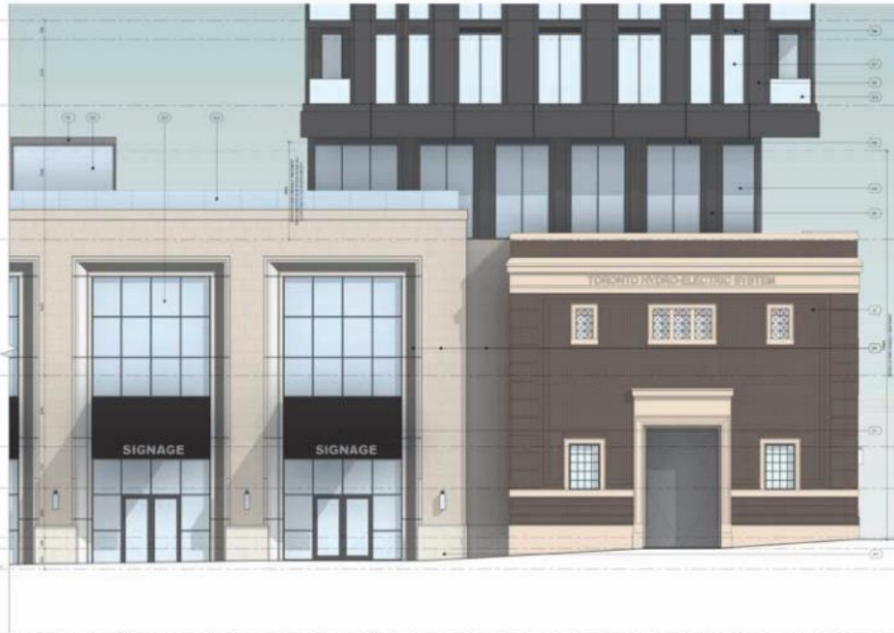
South elevation: Detail showing relationship between adjacent, and supplanted volumes along Eglinton Avenue West.

(Heritage Impact Assessment, GBCA Architects, March 2024)