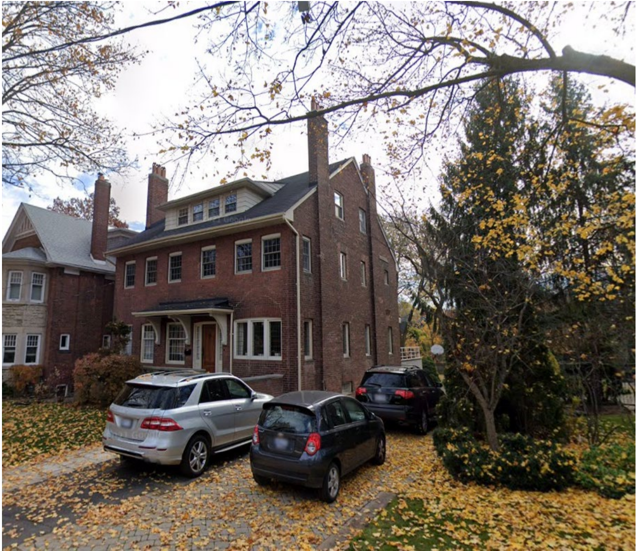
Contextual photo of the northwest elevation of the existing building at 135 Roxborough Drive prior to the unauthorized alterations.