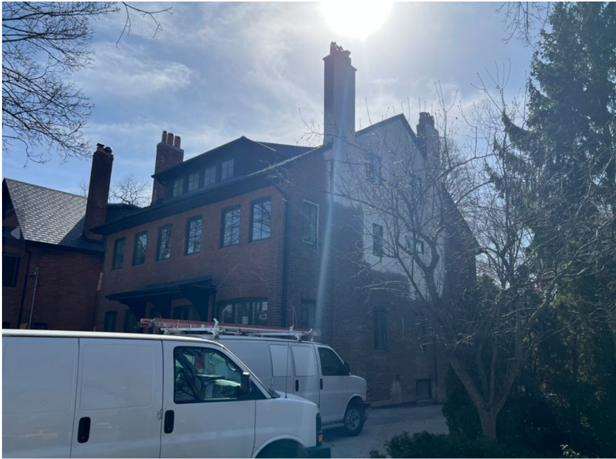
Contextual photo of the northwest elevation of the existing building at 135 Roxborough Drive showing the extent of unauthorized painting done to the side of the dwelling (2024).