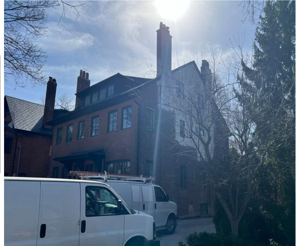
Photograph of the northwest elevation of the existing building at 135 Roxborough Drive (2024)