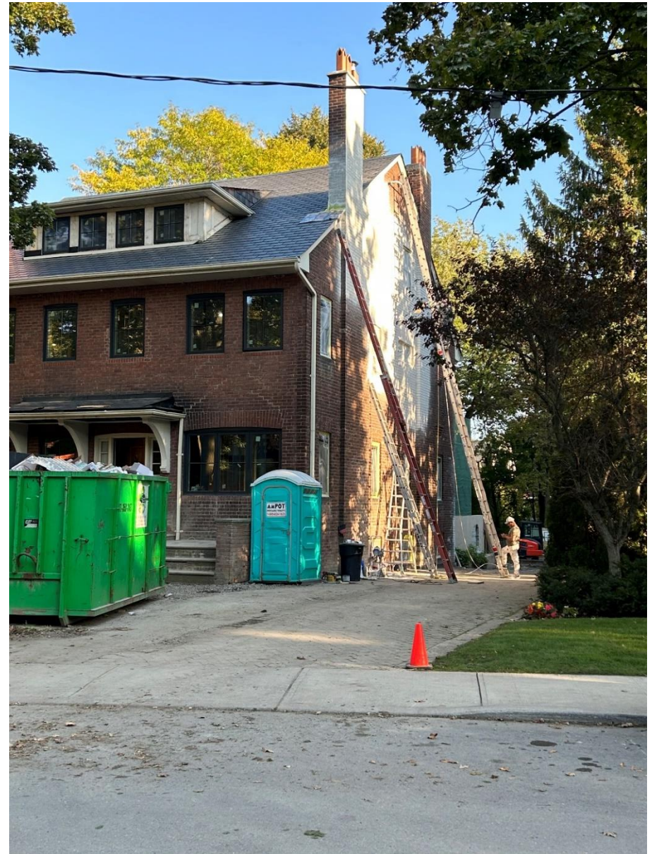
Photograph of the North elevation of the existing building at 135 Roxborough Drive (2024)