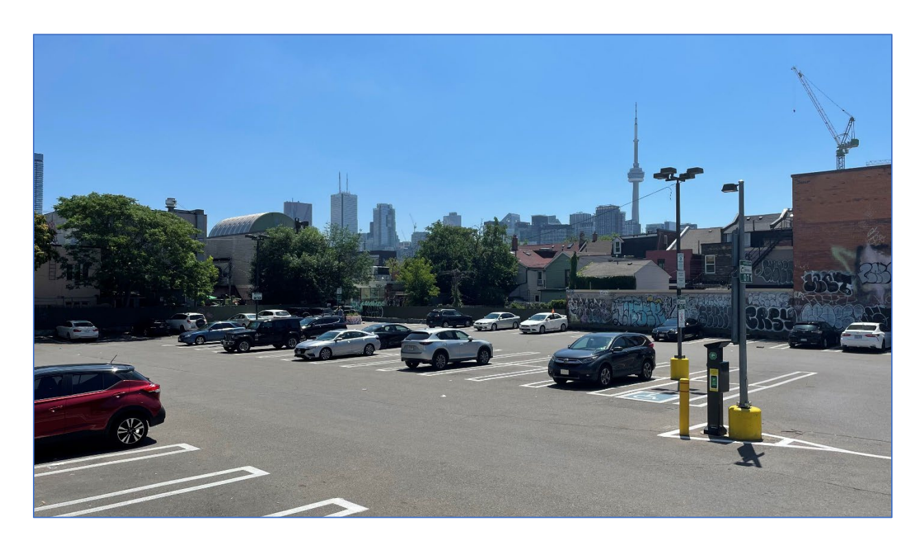
Appendix 'C' - 405 Sherbourne St. (July 2024)