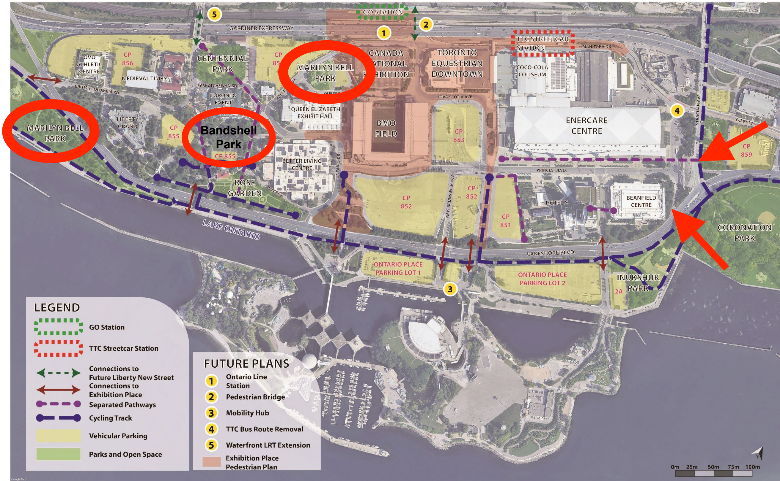
Figure 2-1: Existing Sustainable Transportation Network and Future Plans