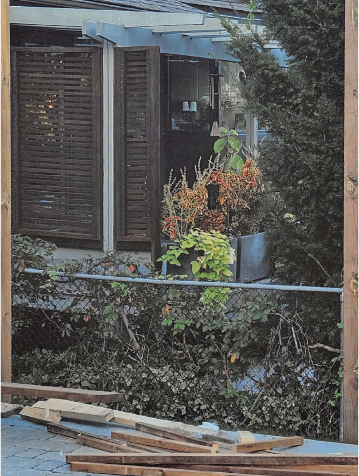
Fence Exemption Request – 63 Glenaden Ave. E.