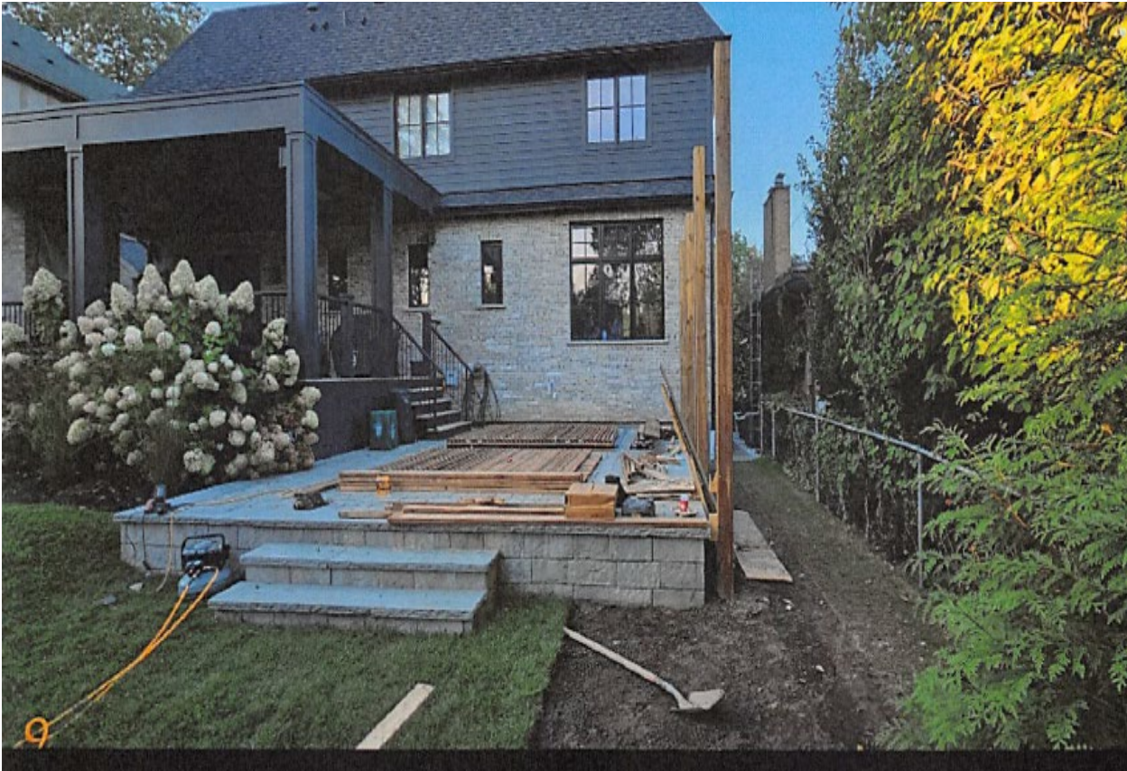
Attachment D – view of rear yard looking north