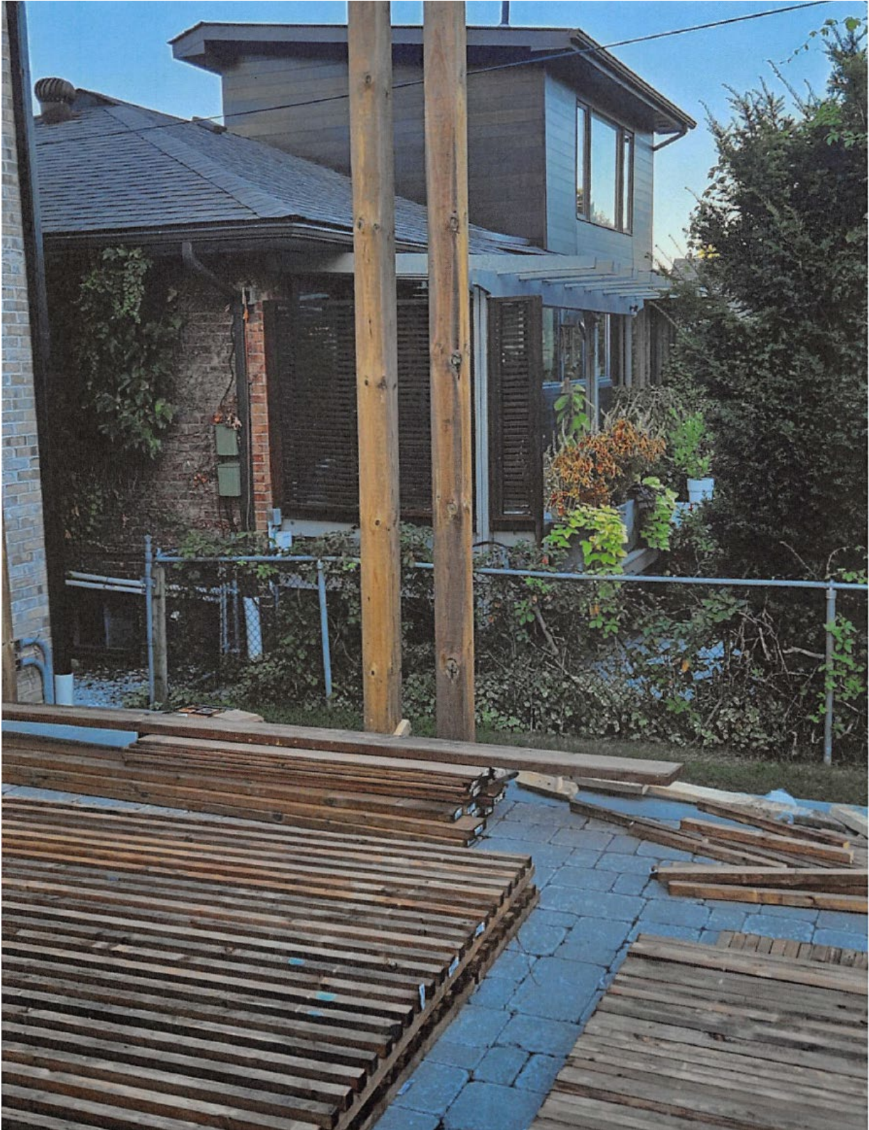
Fence Exemption Request – 63 Glenaden Ave. E.