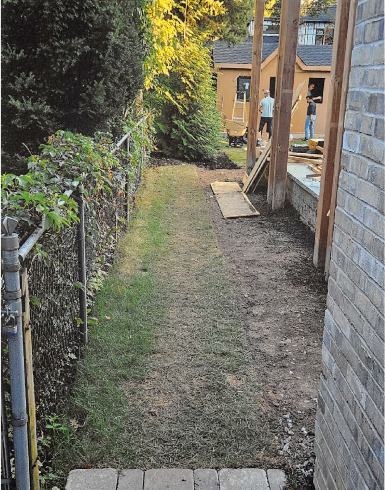
Fence Exemption Request – 63 Glenaden Ave. E.