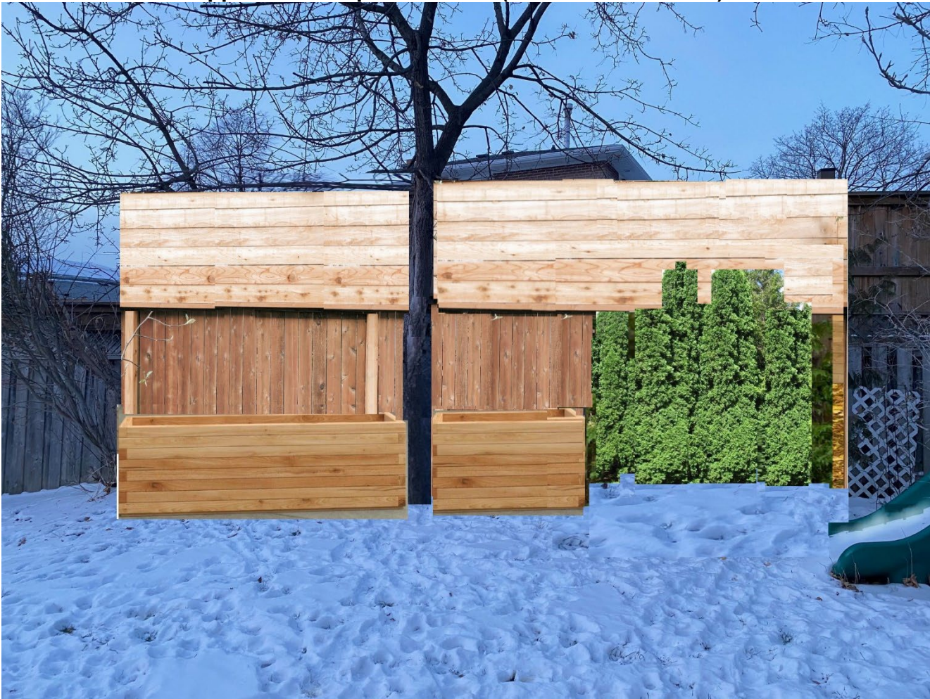
Attachment 4: Applicant's Proposed Fence (Software Enhanced)