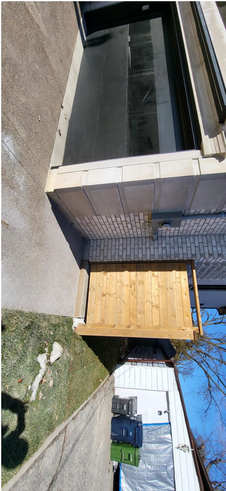
Attachment 3: Municipal Standards Officer's Photo - 130 Goulding Ave - Rear Yard