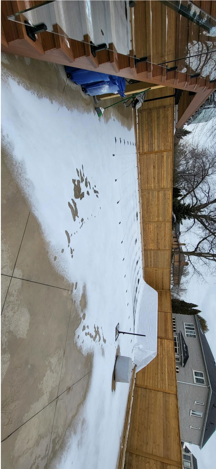
Attachment 4: Municipal Standards Officer's Photo - 130 Goulding Ave - Rear Yard west side