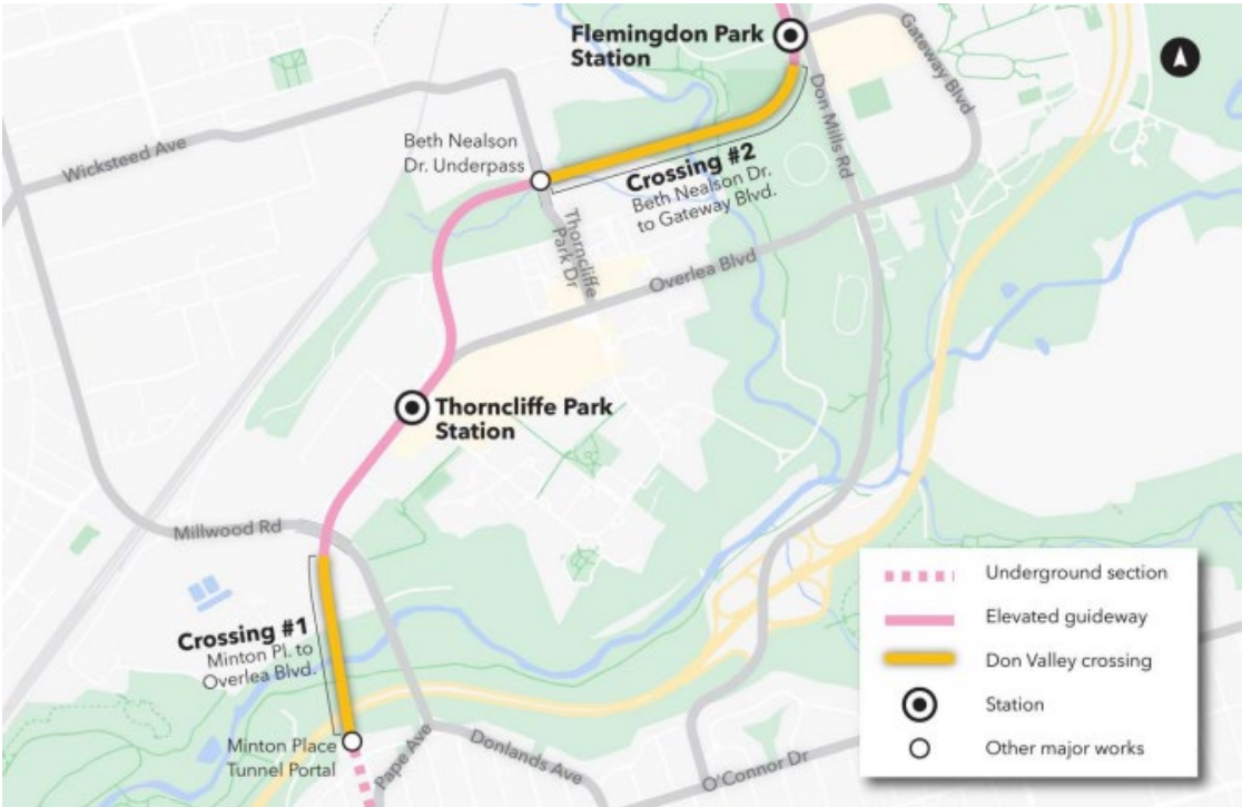
Figure 2: Map of Don Valley Crossing Bridge locations in North York