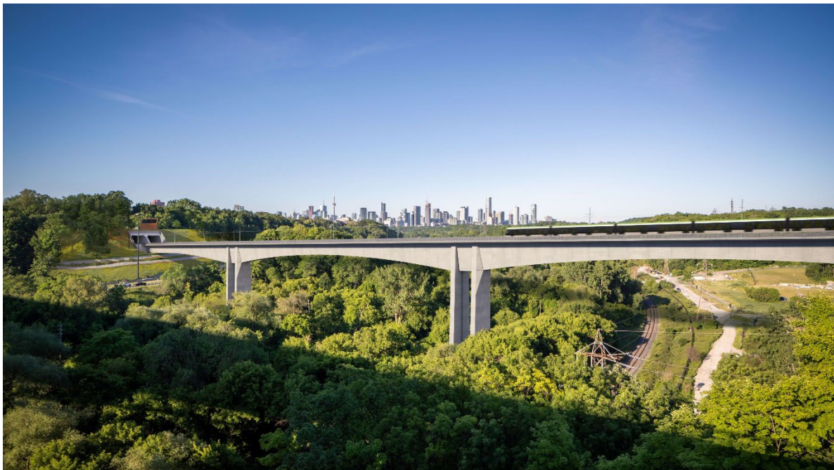
Figure 4: Rendering of the tunnel portal at Minton Place, where Ontario Line trains will emerge from underground onto the Don Valley Crossing bridge