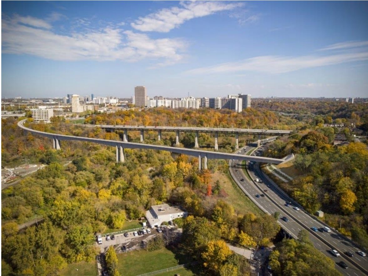
Figure 3: Conceptual rendering of future Don Valley Crossing bridge, which will carry Ontario Line trains between the Minton Place tunnel portal and Thorncliffe Park