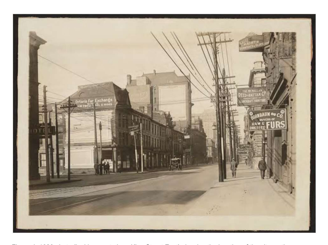
Figure 4. 1920 photo (looking west along King Street East) showing the location of the site on the southwest corner of King Street East and George Street (City of Toronto Archives).