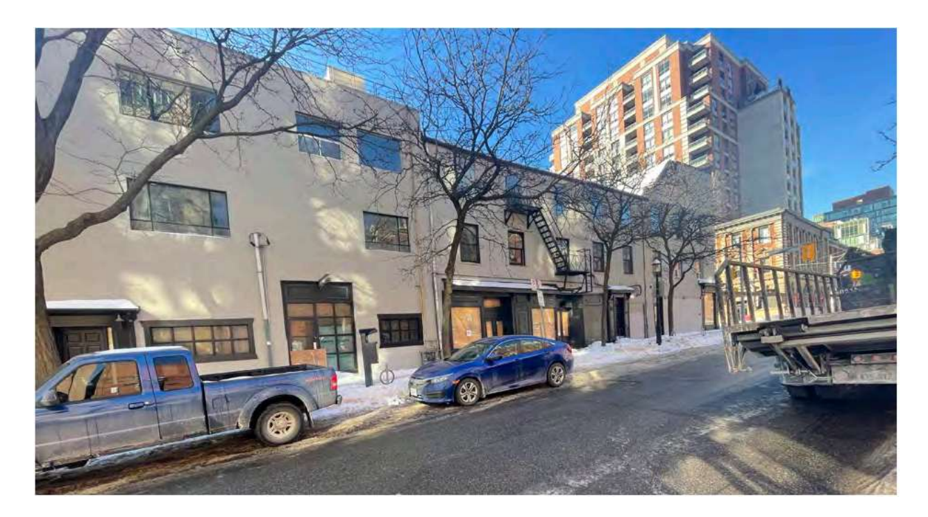
Figure 7. Photograph showing the east elevation of the development site on George Street.