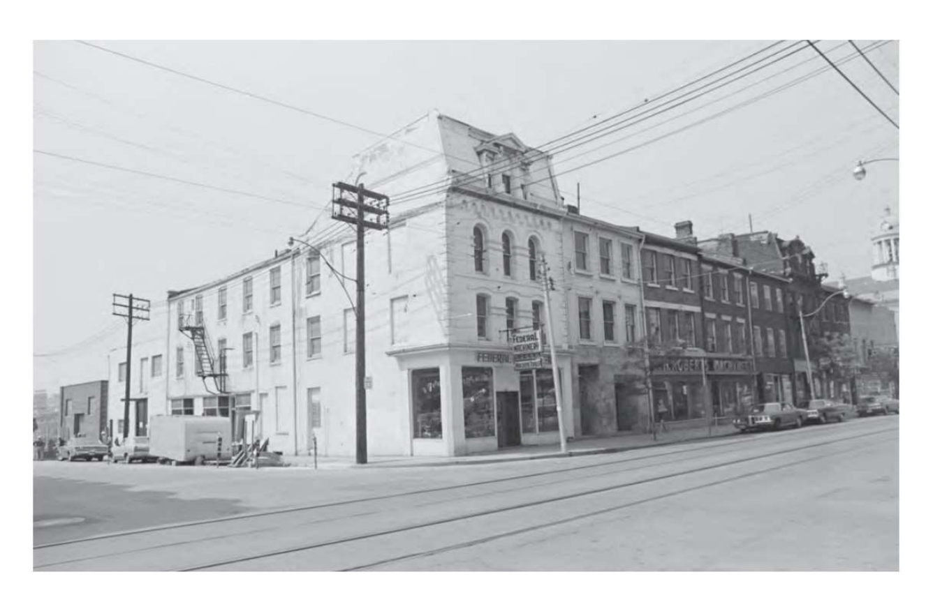
Figure 5. 1972 photo (looking southwest) showing the location of the site on the southwest corner of King Street East and George Street.