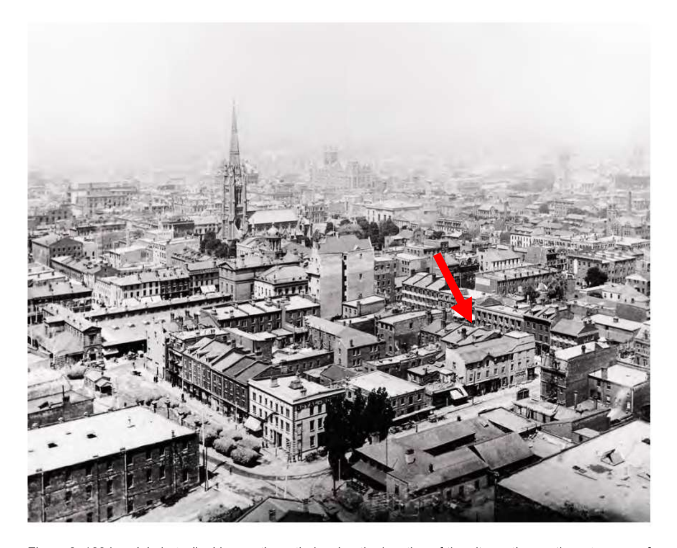
Figure 3. 1894 aerial photo (looking northwest) showing the location of the site on the southwest corner of King Street East and George Street.