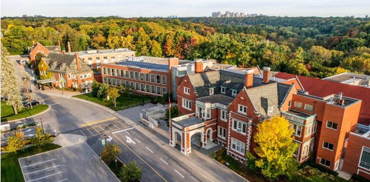
Aerial view of the subject site showing 318 Lawrence Ave E at the far right, 306 Lawrence Ave E to the left, and 294 Lawrence Ave E at the far left with later 20 th century additions positioned on sloping tableland between the estate houses