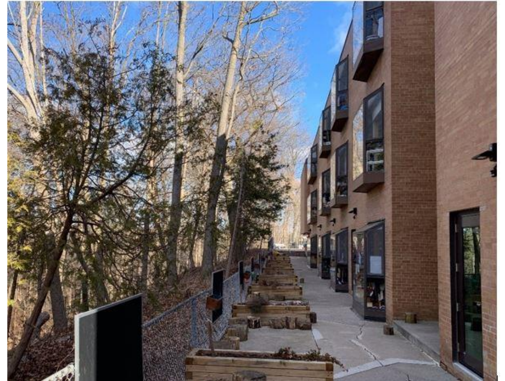
North or ravine elevation of 101 Mildenhall Road (Heritage Planning, 2024)