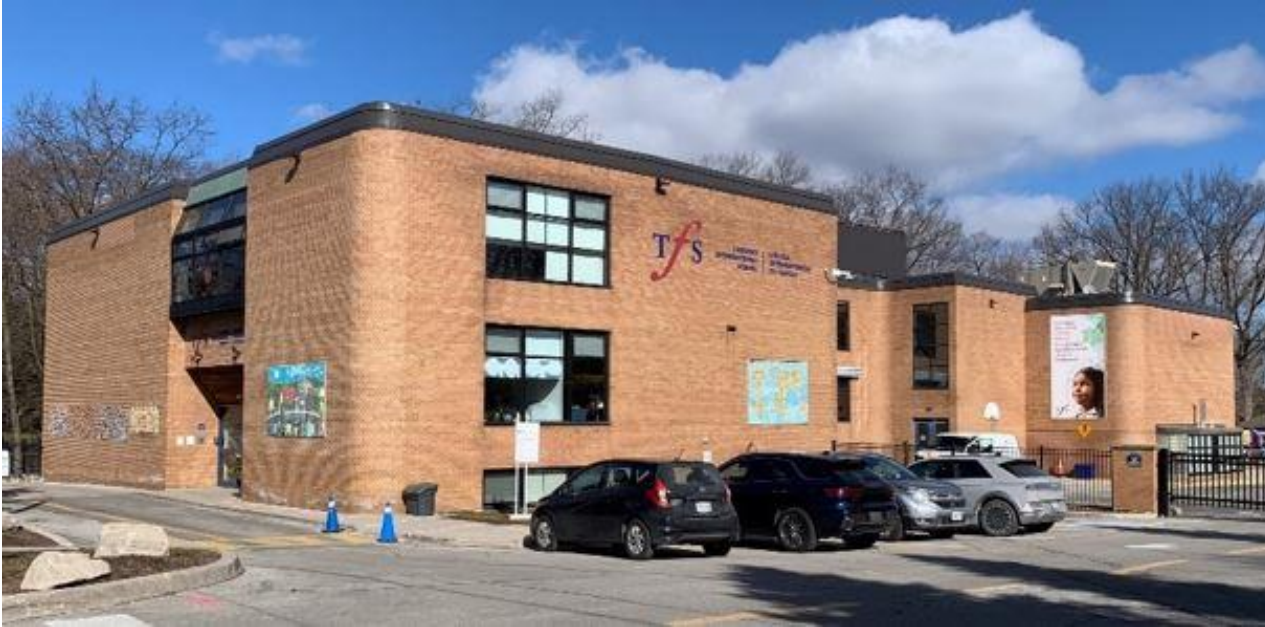
101 Mildenhall Road (1969) showing west (primary) and south elevations (Heritage Planning, 2024)

294, 306 & 318 Lawrence Avenue East and 101 Mildenhall Road