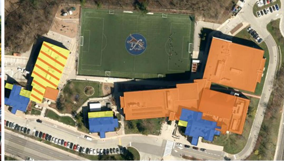
Additions (yellow: 1964-1981 and orange: 1981-present) to the estate houses (blue) have been constructed to the rear, on sloping tableland, and reflect the historical evolution of the site from residential to religious to educational uses