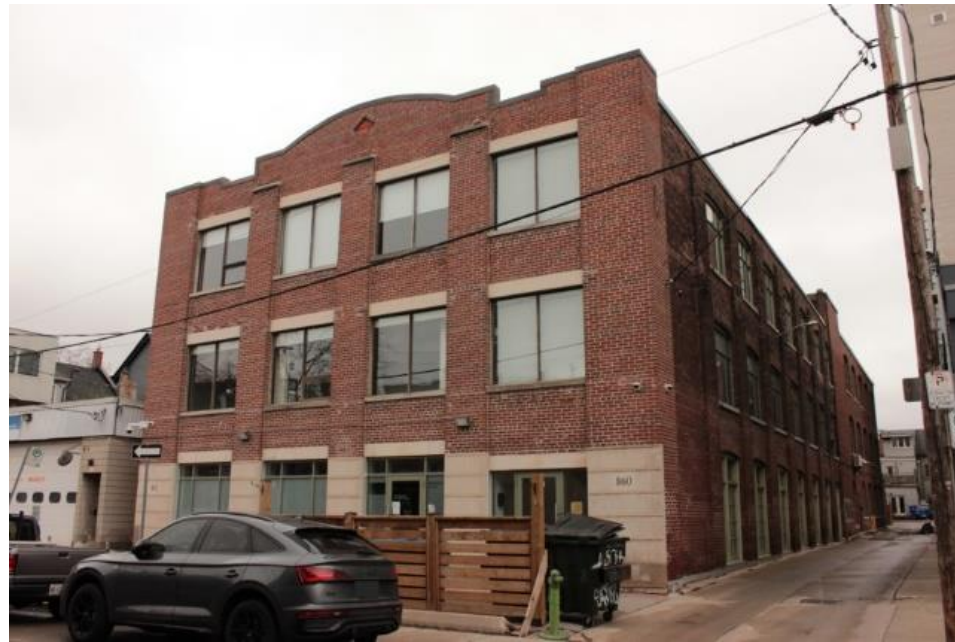
860 Richmond Street West, Heritage Planning, 2024

Constructed in 1913, the property holds design and physical value as a representative example of an early-twentieth century factory/warehouse type building with Edwardian Classical detailing. The property also supports and maintains the mixed industrial and working-class residential character of its neighbourhood, and is physically, visually, and historically linked to its surroundings.