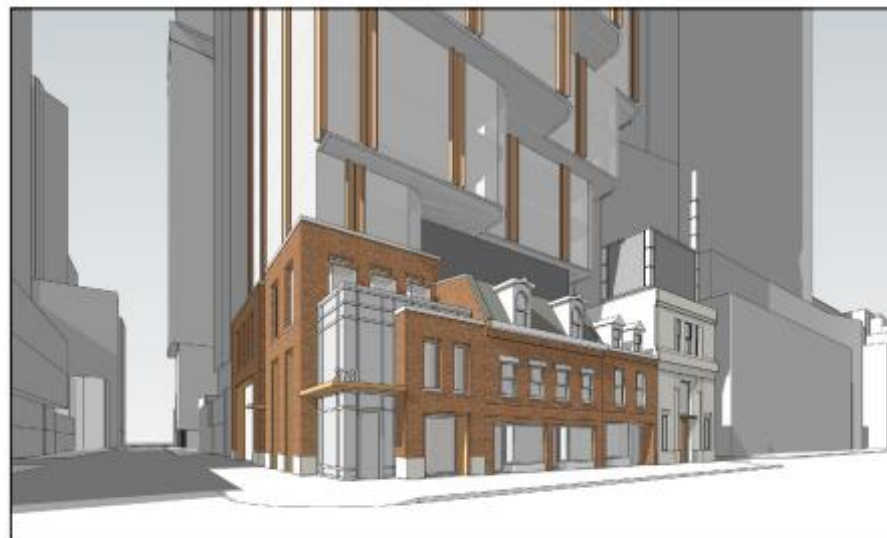
View of “podium” from SE HIA