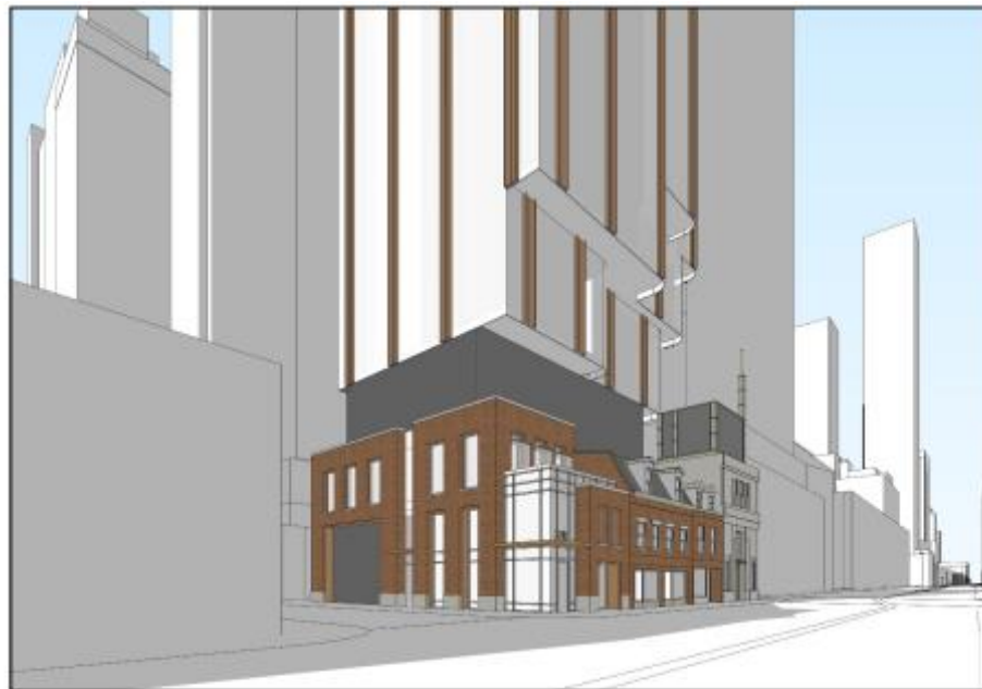
View of “podium” from SE Proposed