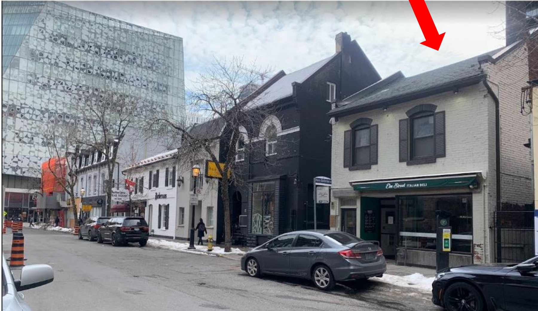
15 Elm Street within its context looking east (Heritage Planning, 2023)