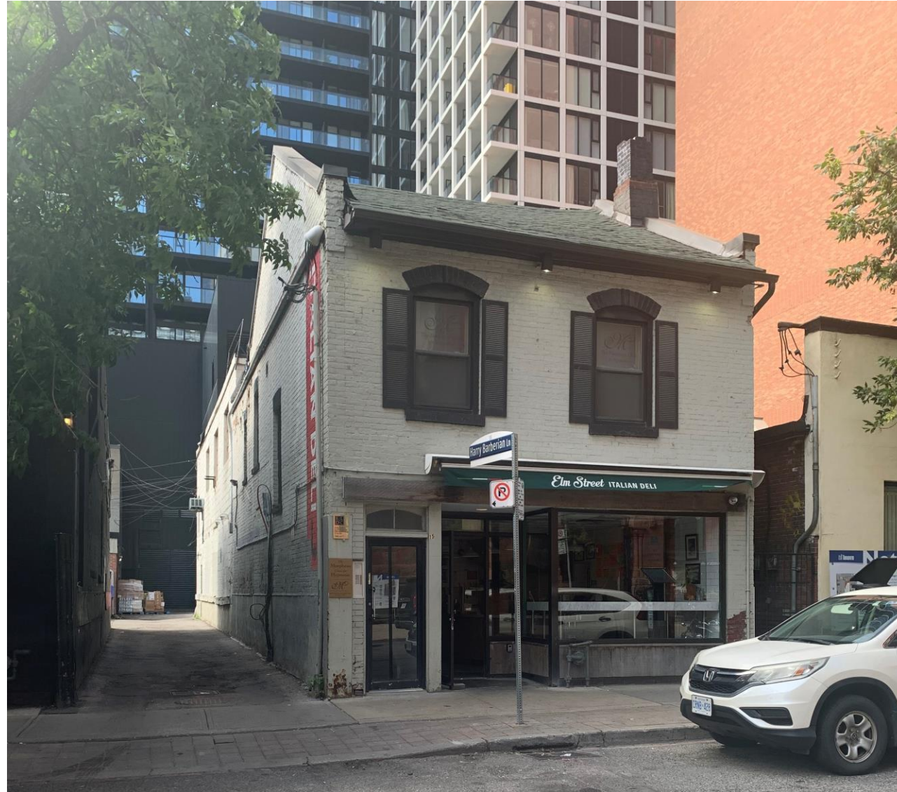
Principal (north) elevation of 15 Elm Street (Heritage Planning, 2024)