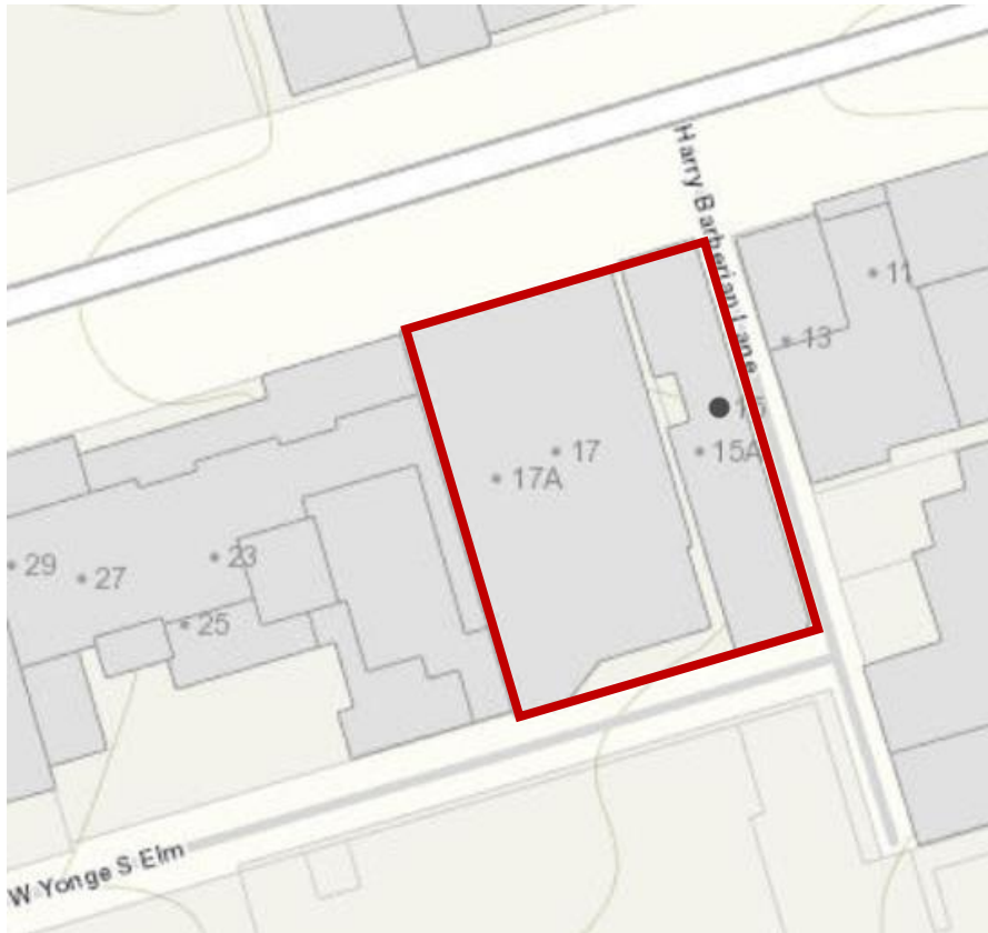
Planning Application site at 15-17 Elm Street