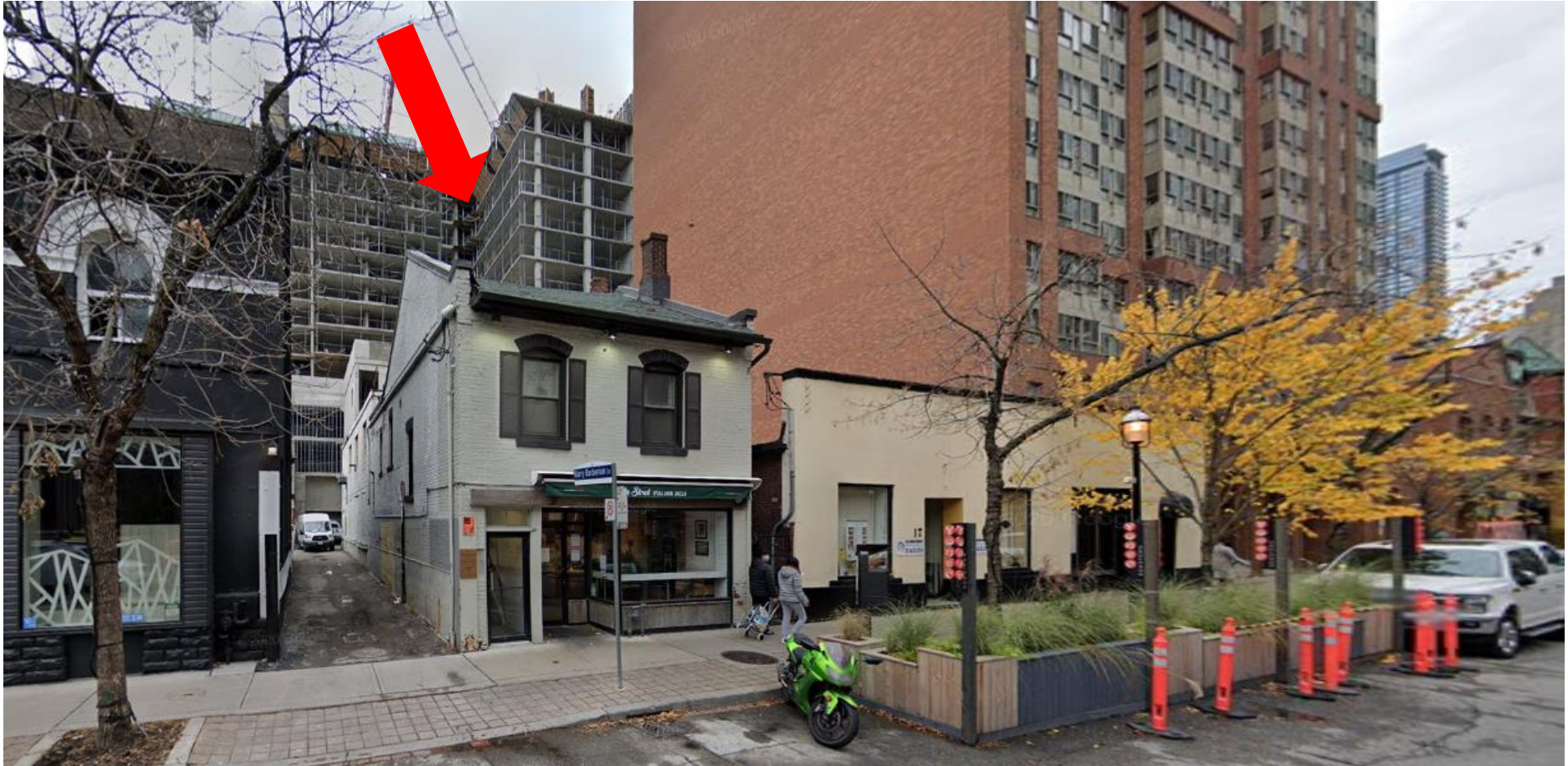
15 Elm Street within its context looking west