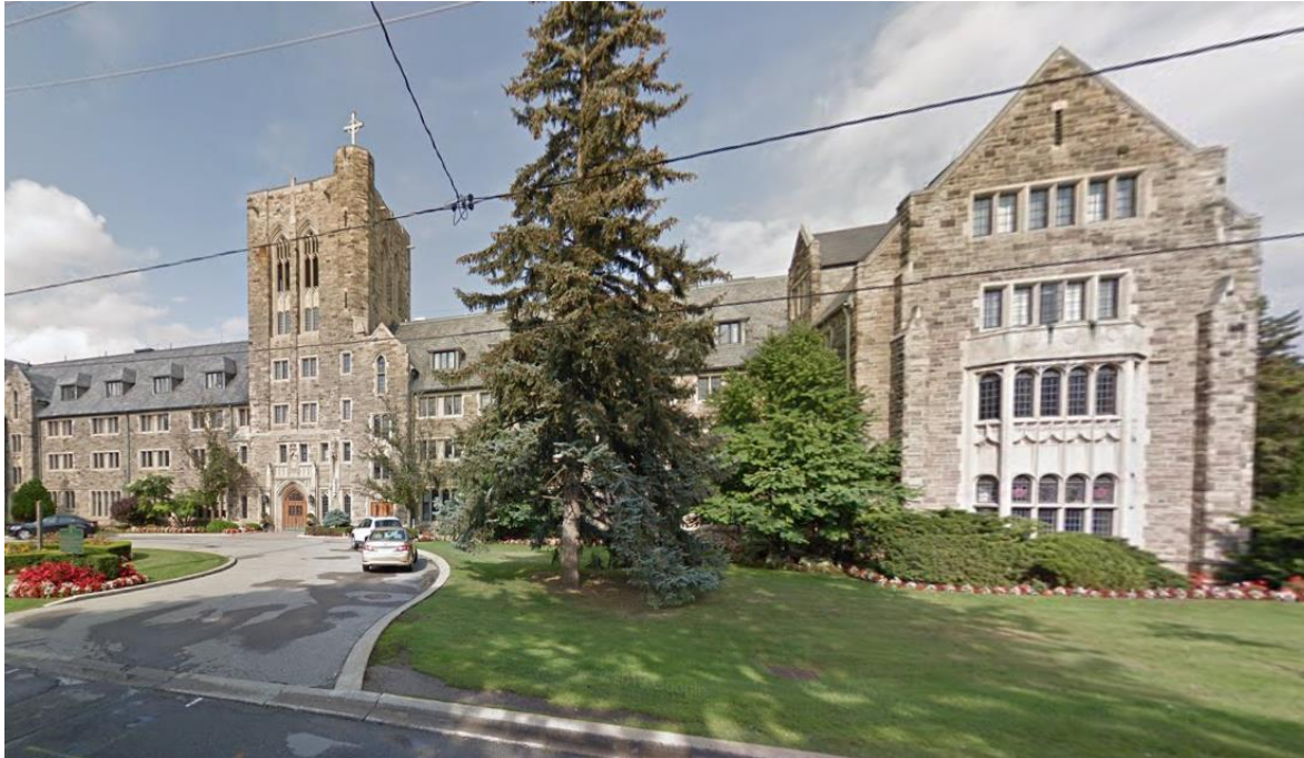
Partial view of the east elevation of the building (showing the School Wing and Chapel) looking west (ERA Architects Inc., May 2022).