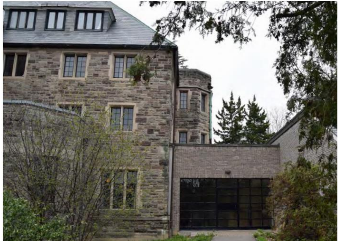
Partial view of the east elevation of the Convent (north) Wing that shows the one-storey service component (ERA, May 2022).