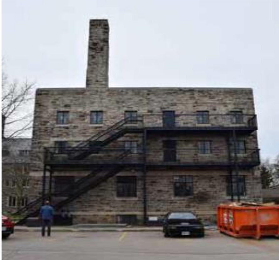
View of east elevation of the Convent (north) Wing with fire escape (ERA, May 2022).