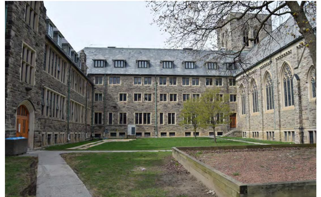
Partial view of the primary (west) elevation of the building from Mason Avenue looking east (Google Maps, 2017).