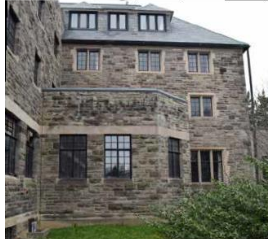
Partial view of the east elevation of the Convent (north) Wing, looking west, that shows the one-storey service component that is proposed to be demolished (ERA, May 2022).