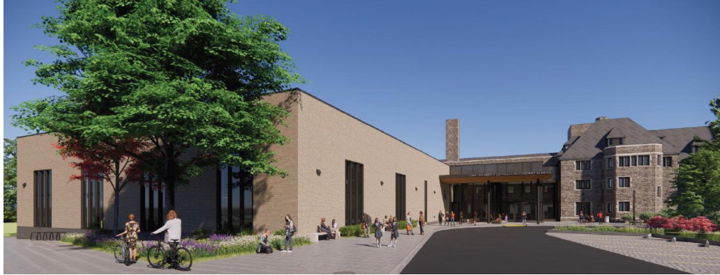
Main entrance and addition rendering (Moffet & Duncan; Diamond Schmitt (June 2023)).