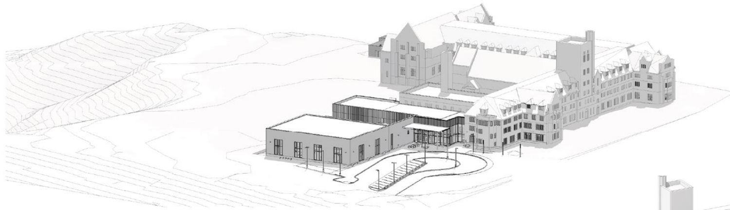
2 OVERALL WEST AXONOMETRIC A002

West and east axonometric views of 101 Mason Boulevard.