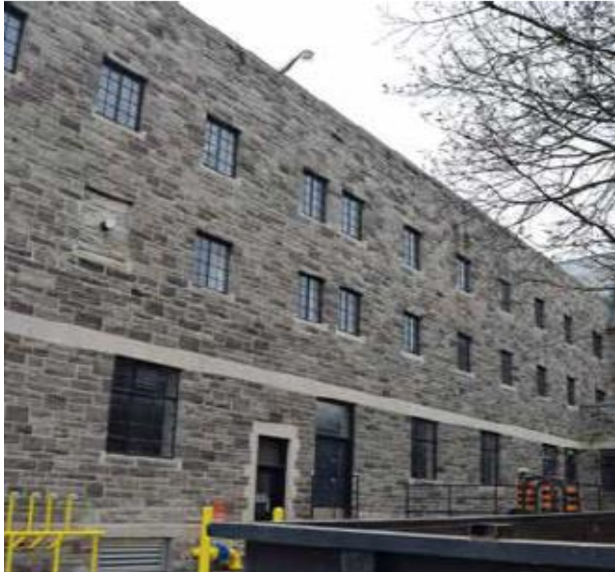
Partial view of the north elevation of the Convent, where the proposed addition is to be located (north) Wing (ERA, May 2022).