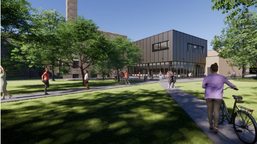
Southeast view to cafeteria and science block (Moffet & Duncan; Diamond Schmitt (June 2023)).