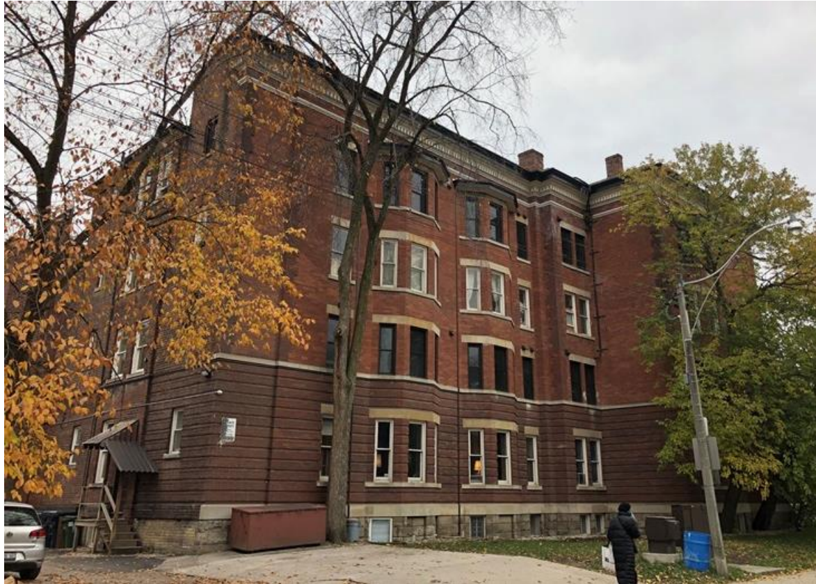
North Elevation at Lowther Avenue with North Rear Elevation in View