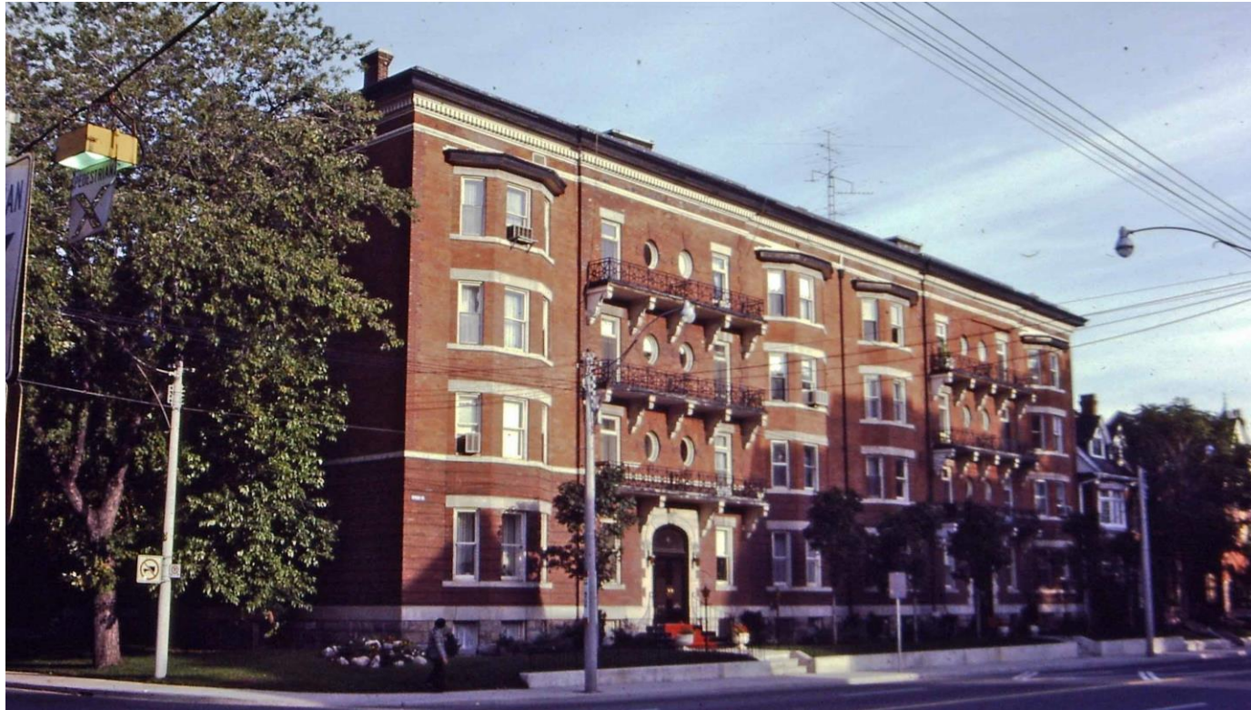
Front/West Elevation at Spadina Road