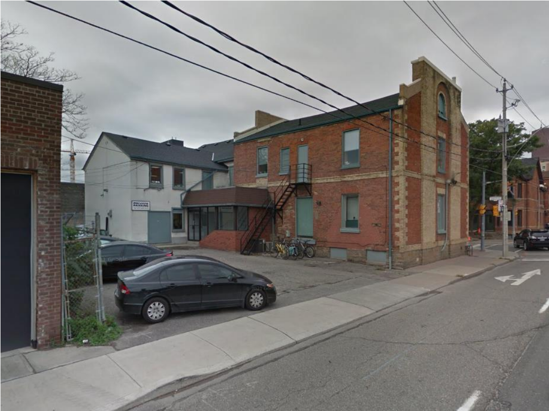
Rear elevations of 115 Berkeley Street and 111 Berkeley Street looking southwest.