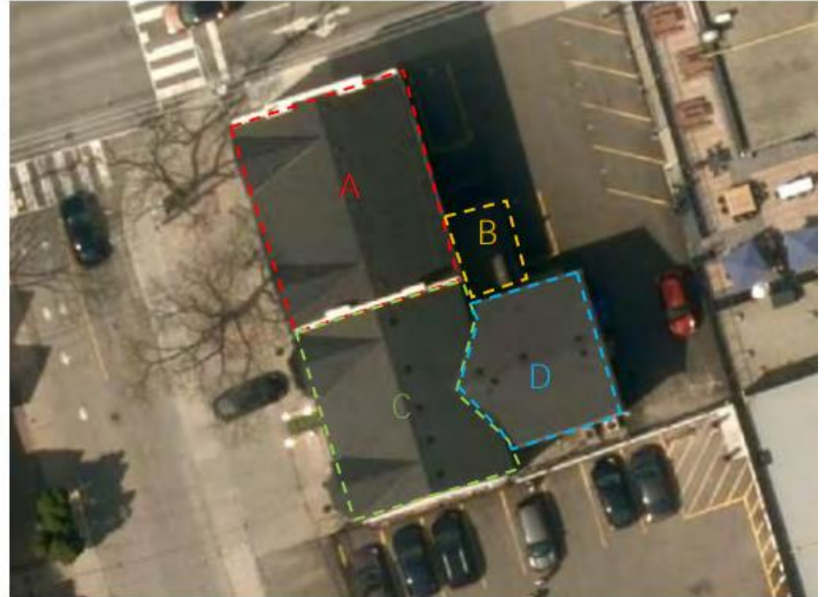
Aerial photo showing the portions of 111 Berkeley Street and 115 Berkeley Street that are proposed to be removed (MHBC, 2023).