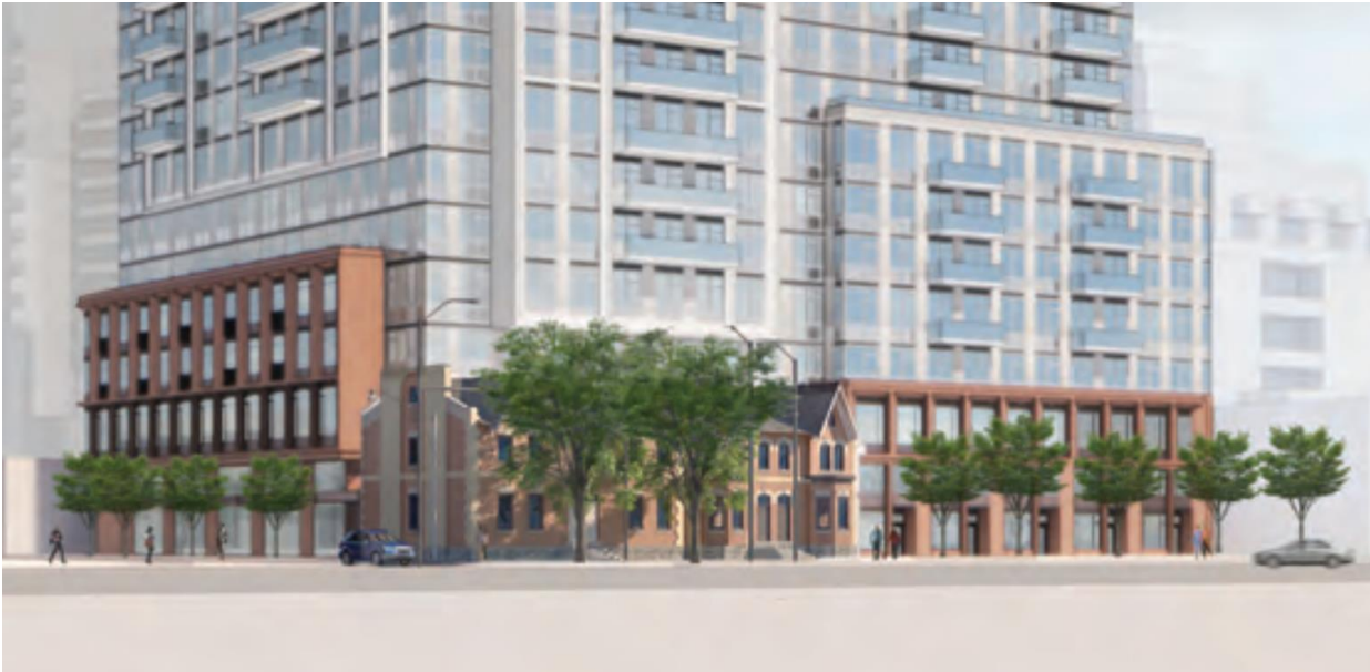
Detail of the rendering of the proposed development at 517 & 523 Richmond Street East and 97, 105, 111 & 115 Berkeley Street (Sweeny&Co Architects, dated March 22, 2024).