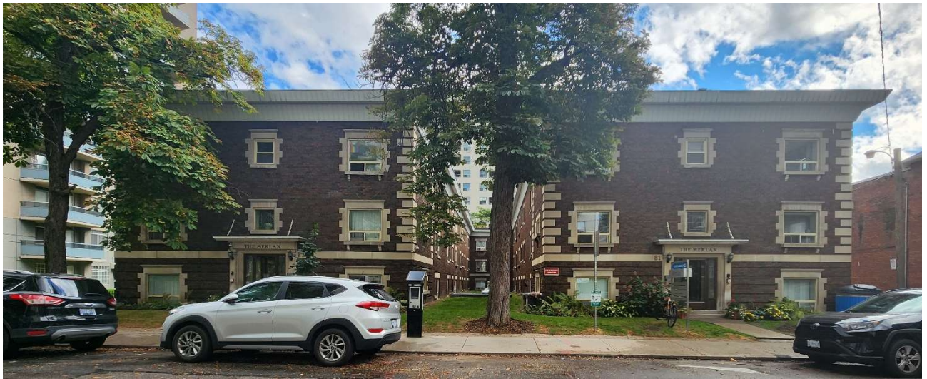
81 Isabella Street (Heritage Planning, 2024).