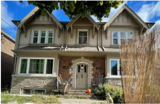
1747 Bayview Avenue