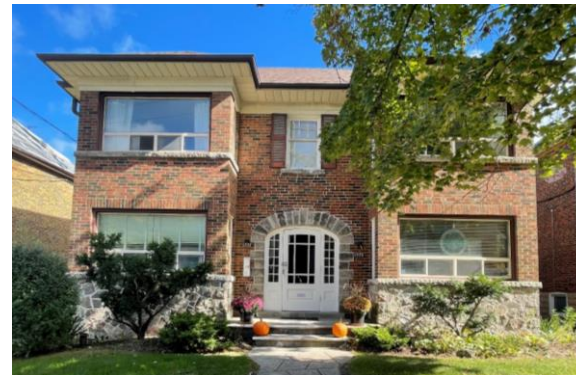
1775 Bayview Avenue