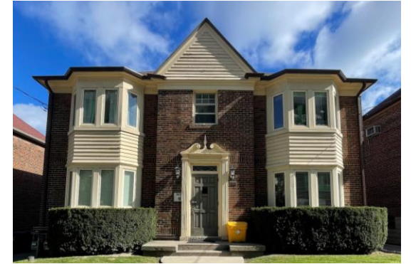
1763 Bayview Avenue