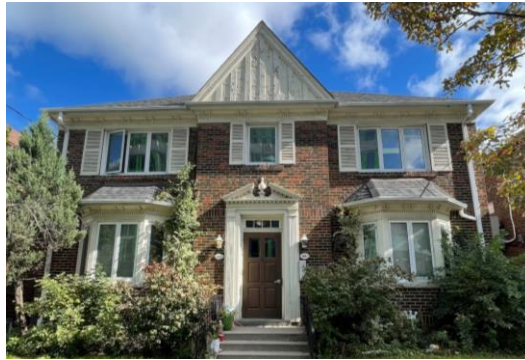
1751 Bayview Avenue