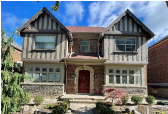
1767 Bayview Avenue