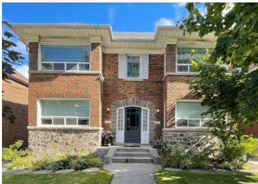
1771, 1773 Bayview Avenue