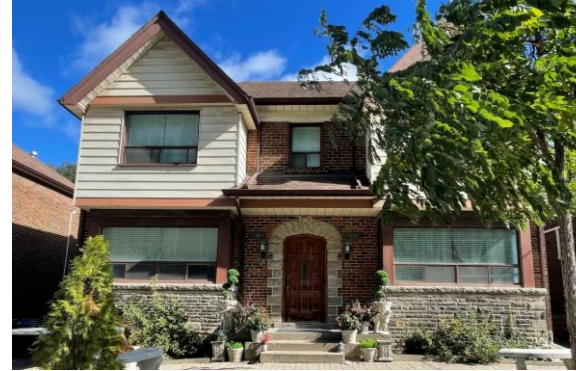
1759 Bayview Avenue