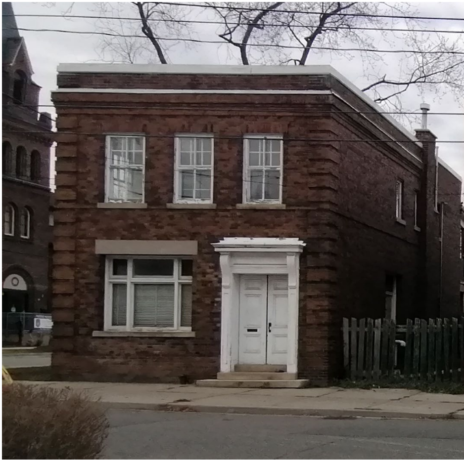
Figure 14 South and east elevations of 86 Mimico Avenue (Heritage Planning, 2023).