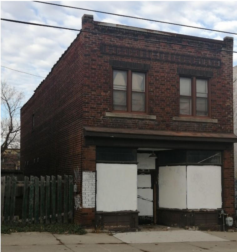
Figure 17 West and south elevations of 80 Mimico Avenue (Heritage Planning, 2023).