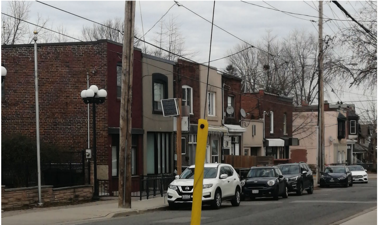
Figure 29 View looking northeast along Mimico Avenue towards Queens Avenue.