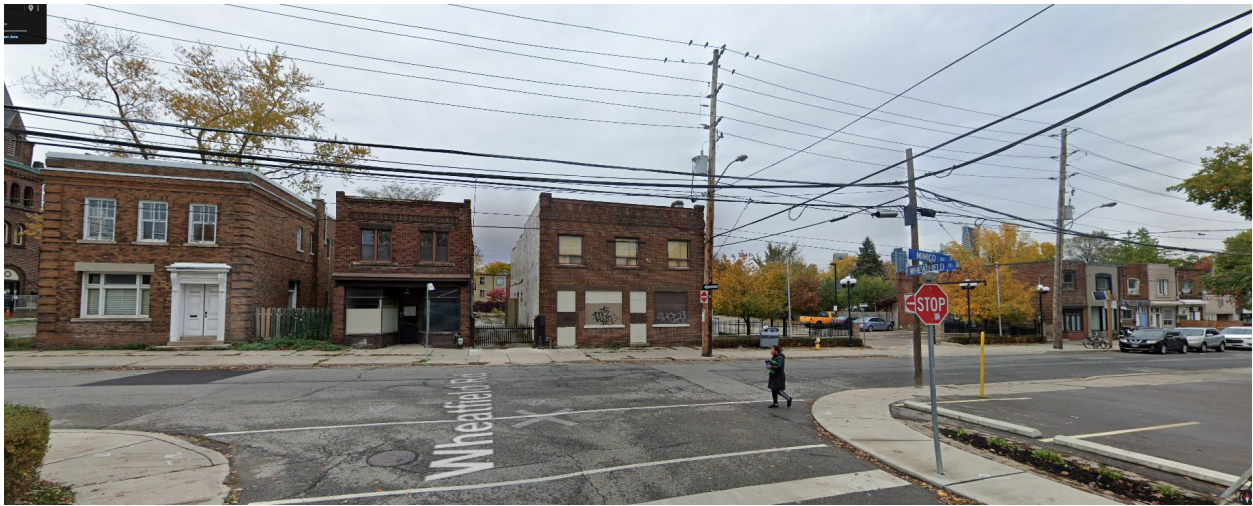
Figure 30 Wide view showing the properties at 78-86 Mimico Avenue to the left and commercial properties at Mimico Avenue and Queens Avenue to the right.