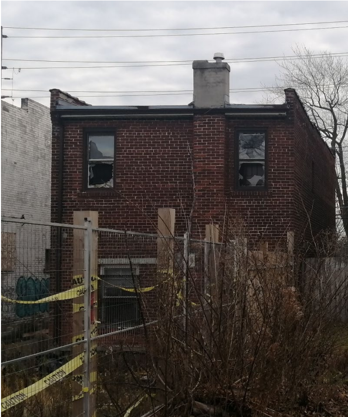
Figure 19 North elevation of 80 Mimico Avenue (Heritage Planning, 2023).