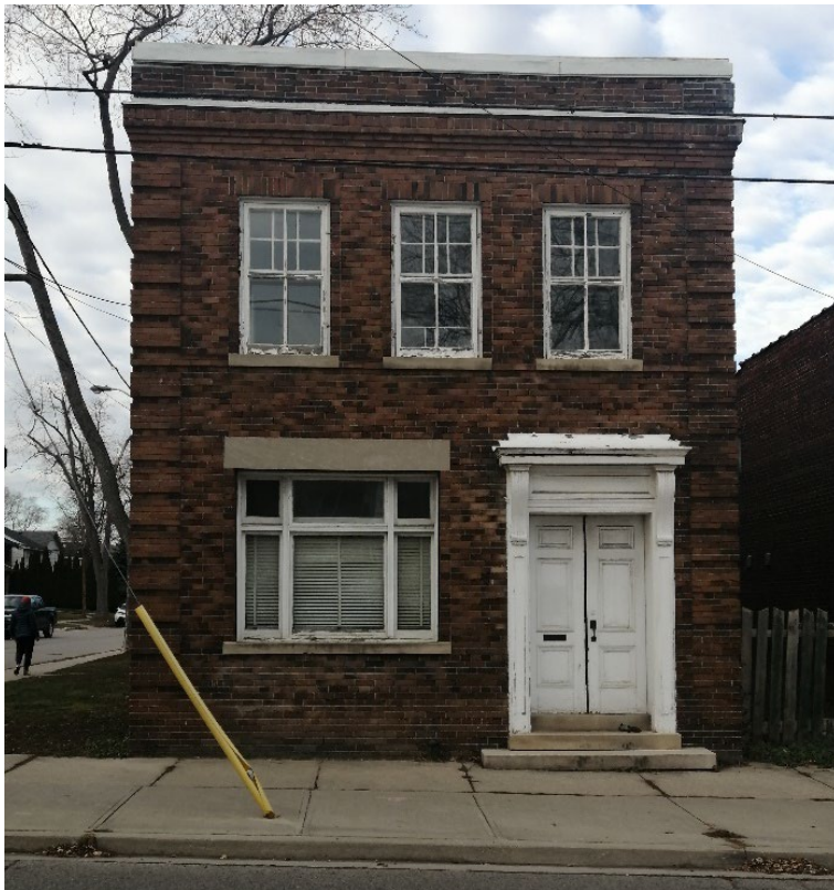
Figure 3 86 Mimico Avenue (Heritage Planning, 2023).