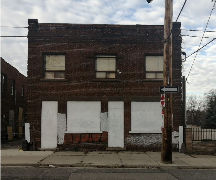
Figure 20 South elevation of 78 Mimico Avenue.