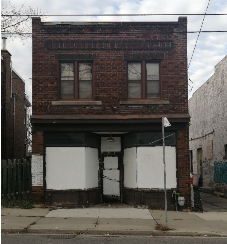
Figure 2 80 Mimico Avenue (Heritage Planning, 2023).