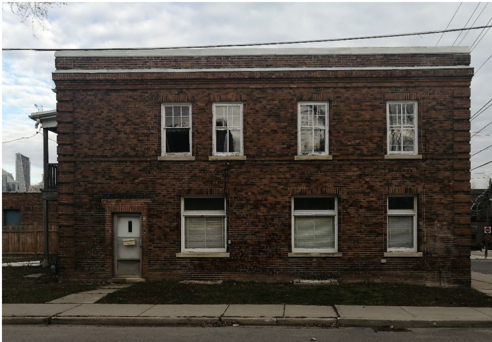
Figure 15 West elevation of 86 Mimico Avenue (Heritage Planning, 2023).