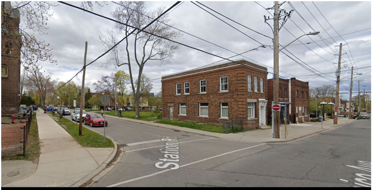
Figure 28 View looking northeast towards the properties at 78-86 Mimico Avenue (Google, May 2021).