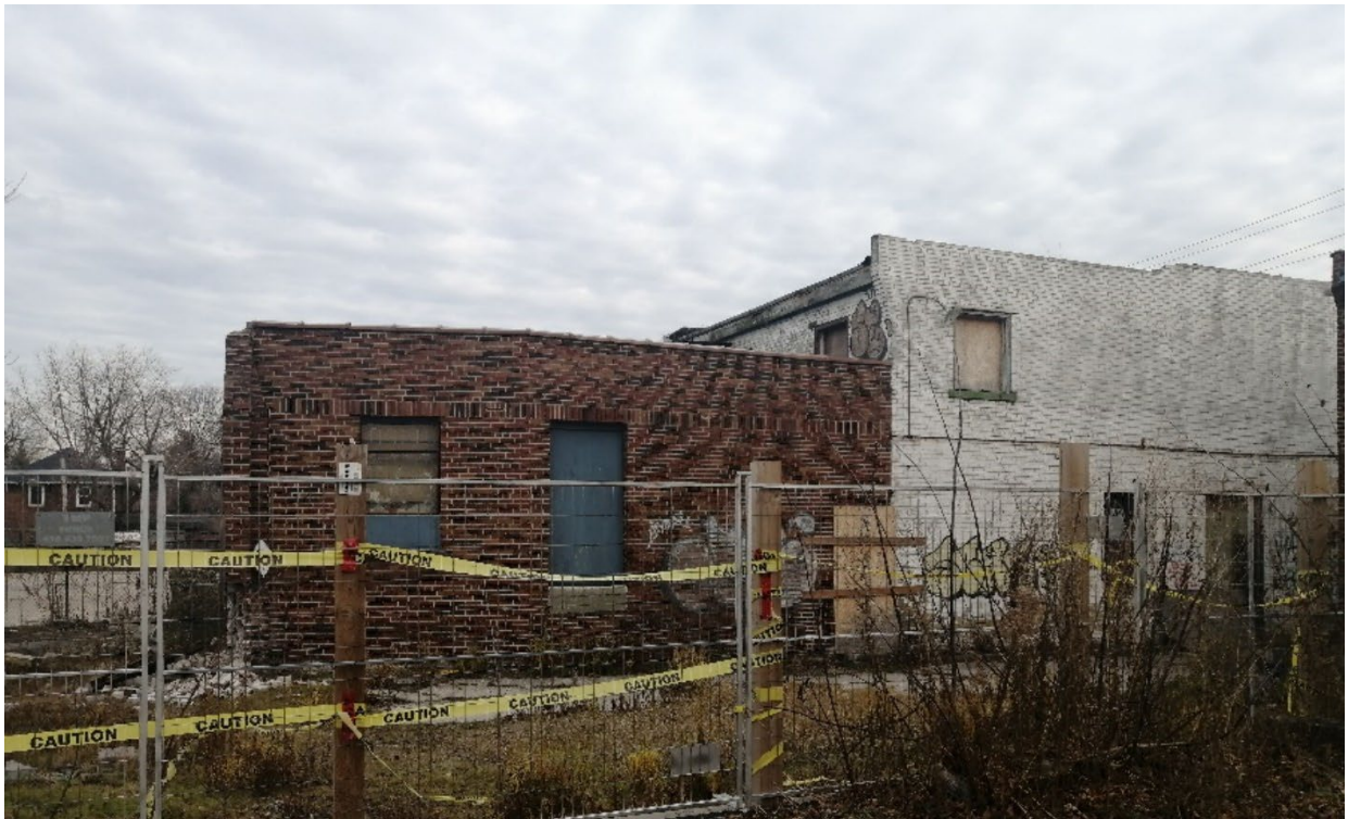
Figure 22 Rear of west elevation of 78 Mimico Avenue (Heritage Planning, 2023).