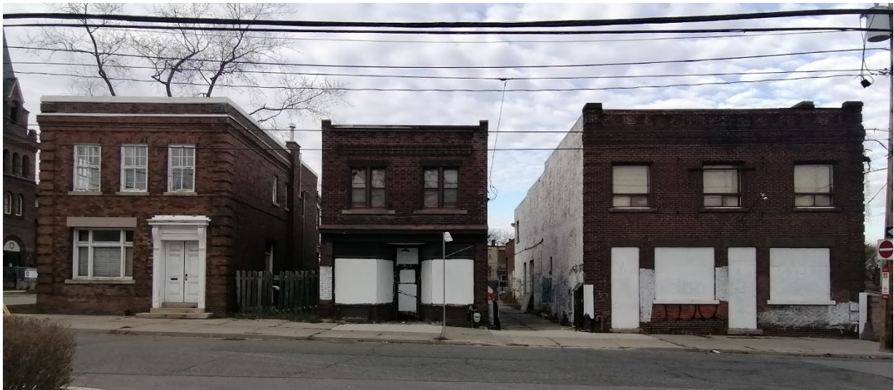
Figure 13 South elevations of (right to left) 78, 80 and 86 Mimico Avenue (Heritage Planning, 2023).