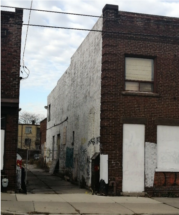
Figure 21 West elevation of 78 Mimico Avenue (Heritage Planning, 2023).