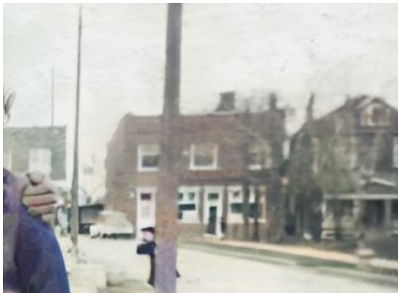
Figure 11 C.1940 photograph looking north along Wheatfield Road toward Mimico Avenue with 78 Mimico Avenue in the centre and the east half of 80 Mimico Avenue to the right (Flanagan, 2023).