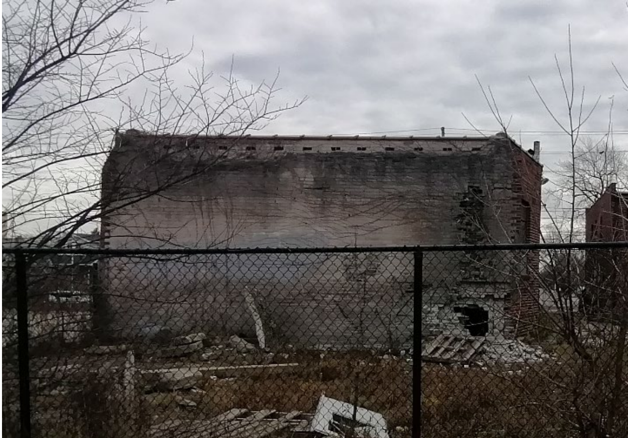
Figure 23 North elevation of 78 Mimico Avenue (Heritage Planning, 2023).