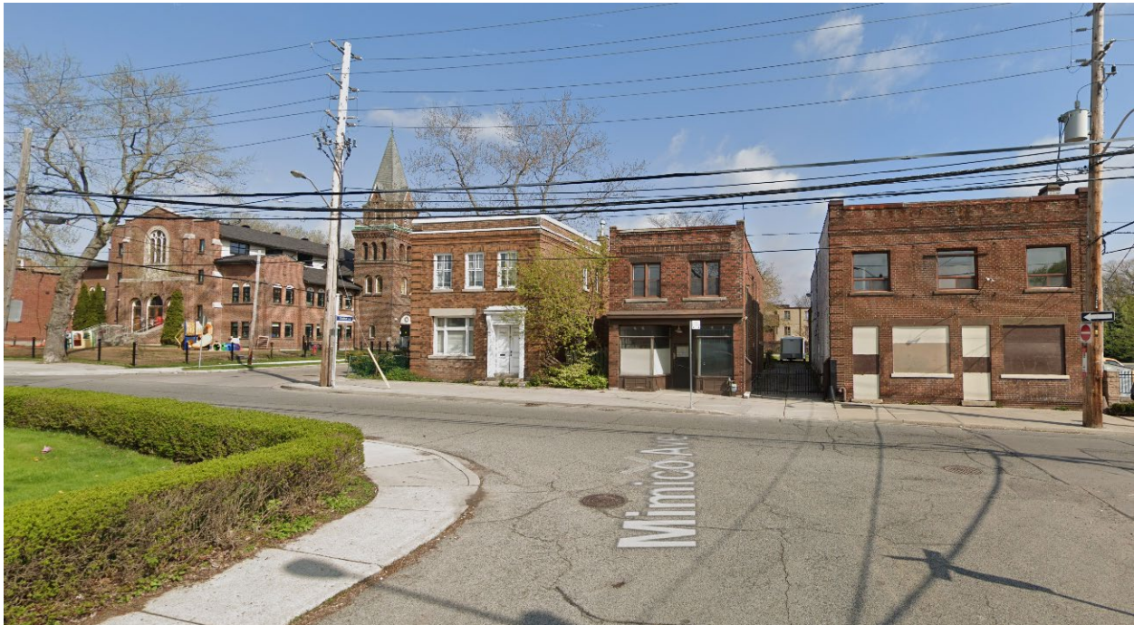
Figure 27 Wide view looking northwest towards the intersection of Mimico Avenue and Station Road (Google, April 2019).