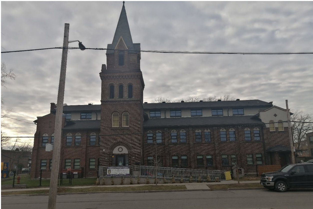
Figure 26 View looking west from 86 Mimico Avenue towards the former Wesley Mimico United Church (Heritage Planning, 2023).