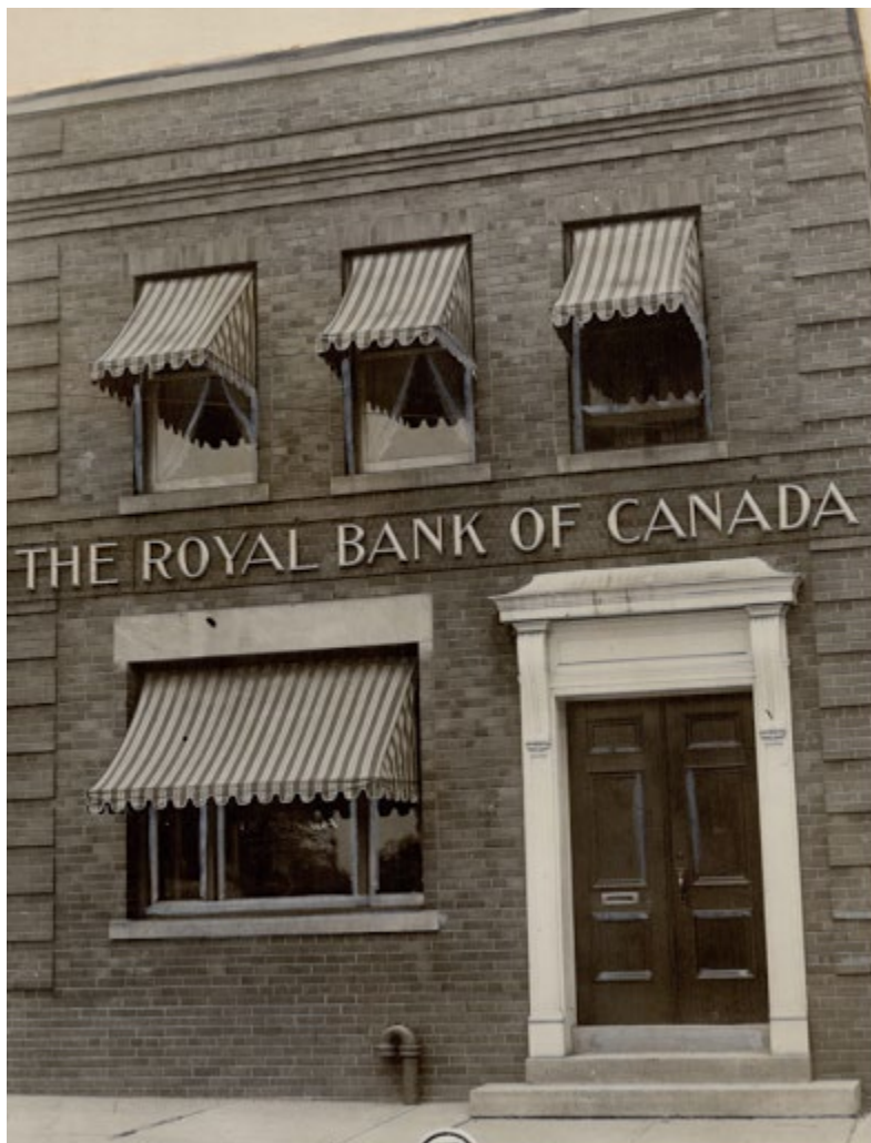
Figure 10 1933 photograph of 86 Mimico Avenue.