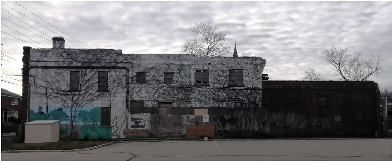
Figure 24 East elevation of 78 Mimico Avenue (Heritage Planning, 2023).