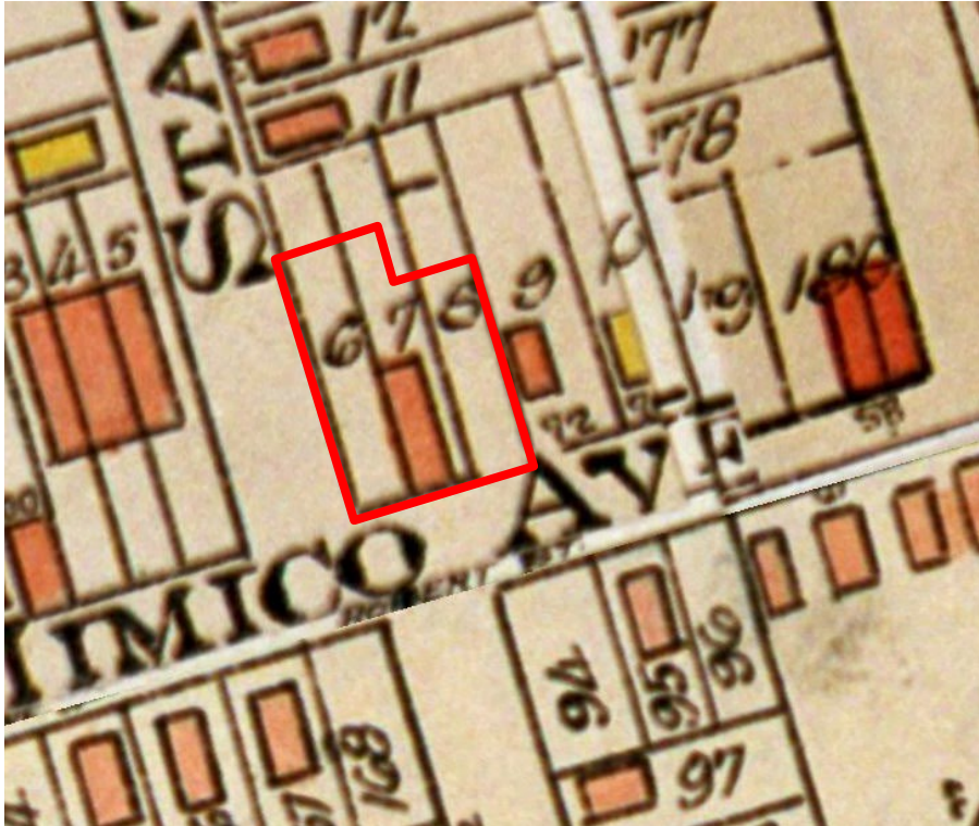
Figure 6 Goad's 1924 Atlas of the City of Toronto with 78-86 Mimico Avenue outlined in red.