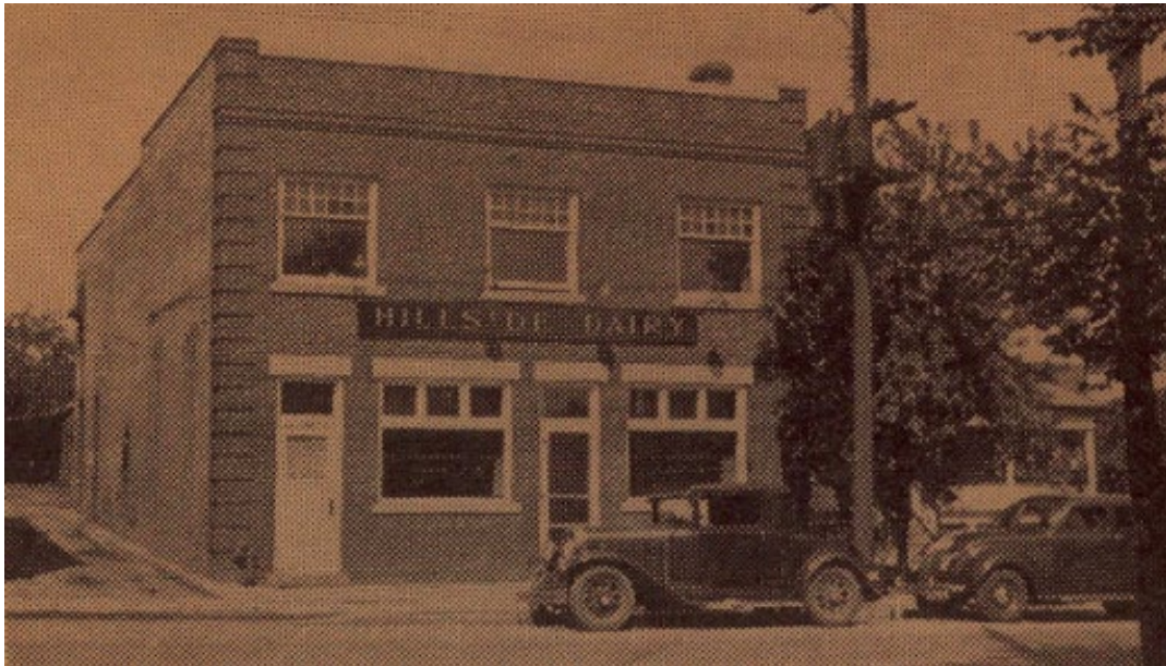
Figure 9 1930s photograph of 78 Mimico Avenue (Harrison, 2011).