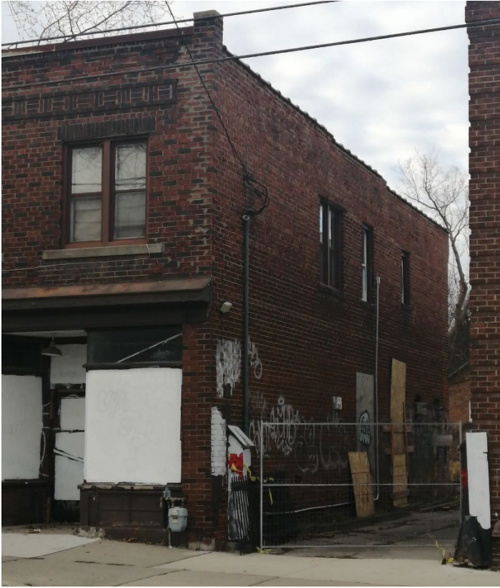
Figure 18 East elevation of 80 Mimico Avenue (Heritage Planning, 2023).