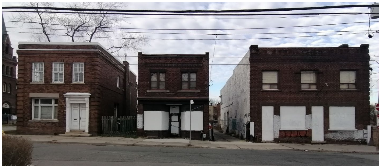
Figure 1 78-86 Mimico Avenue (right to left) (Heritage Planning, 2023).