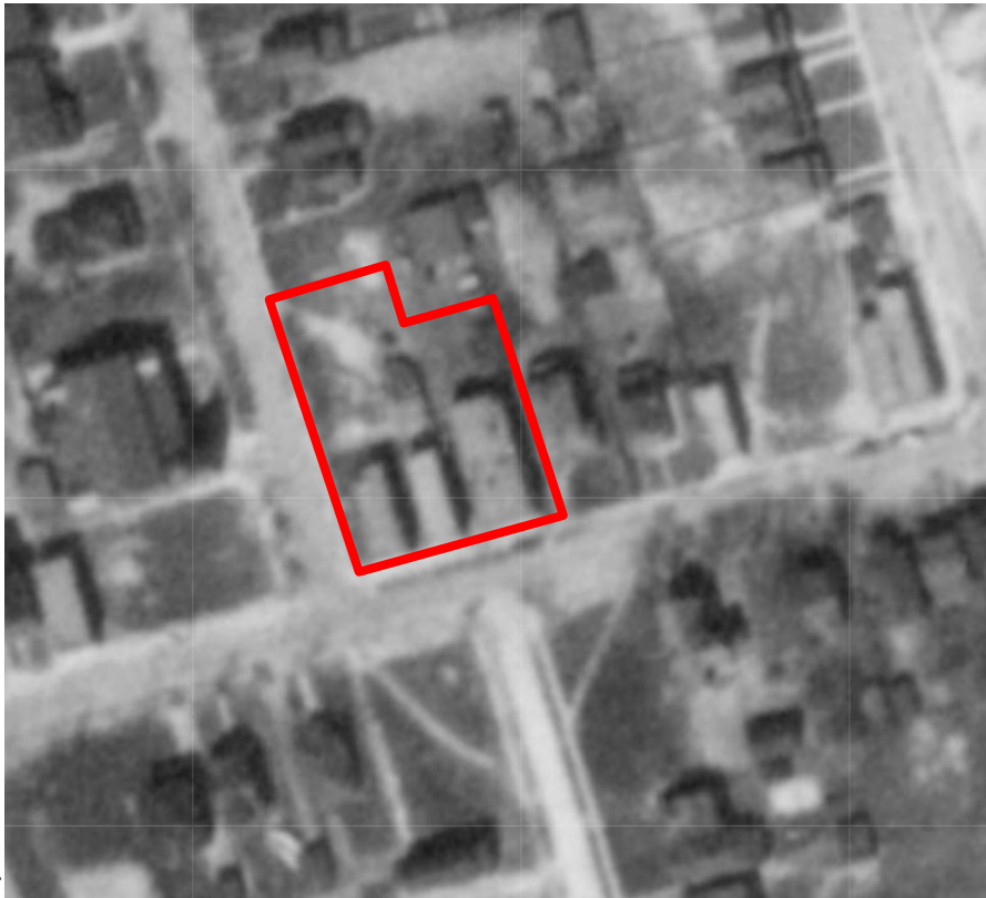
Figure 7 1931 aerial photograph with 78-86 Mimico Avenue outlined in red.