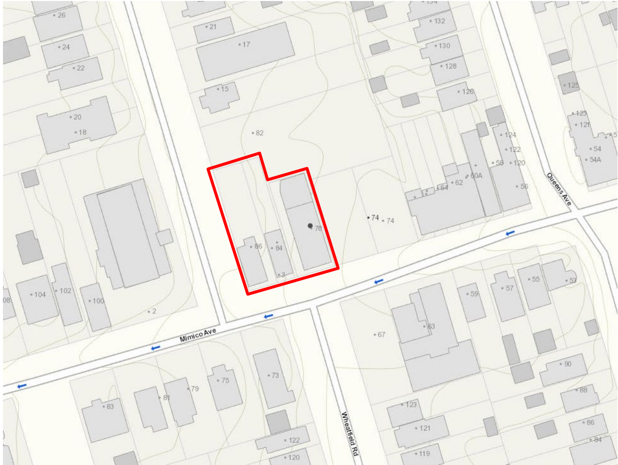
Figure 4 iView map showing the properties at 78-86 Mimico Avenue outlined in red (City of Toronto).