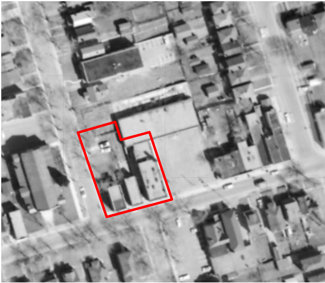
Figure 8 1950 aerial photograph with 78-86 Mimico Avenue outlined in red, note the 1947-50 warehouse to the rear of 78 Mimico Avenue.