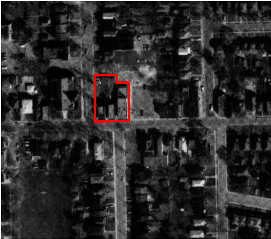
Figure 12 1975 aerial photograph with 78-86 Mimico Avenue outlined in red, note the 1947-50 warehouse to the rear of 78 Mimico Avenue has been demolished.