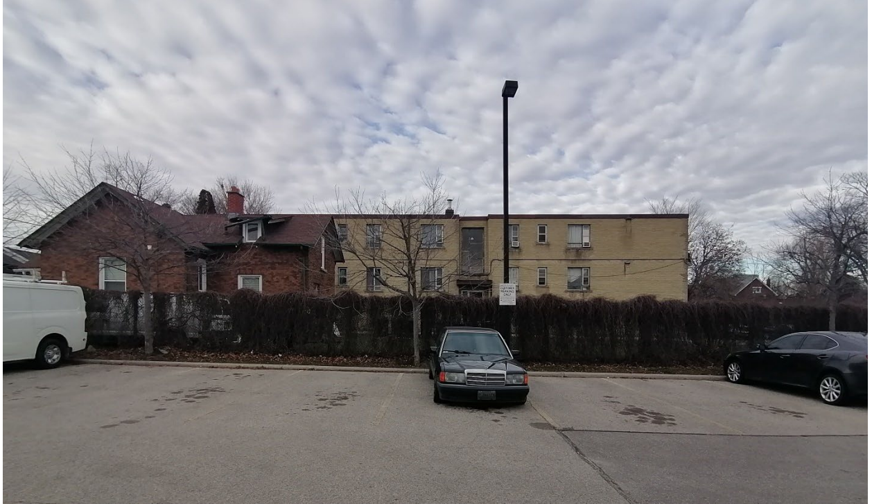
Figure 25 View looking north from 78-86 Mimico Avenue (Heritage Planning, 2023).