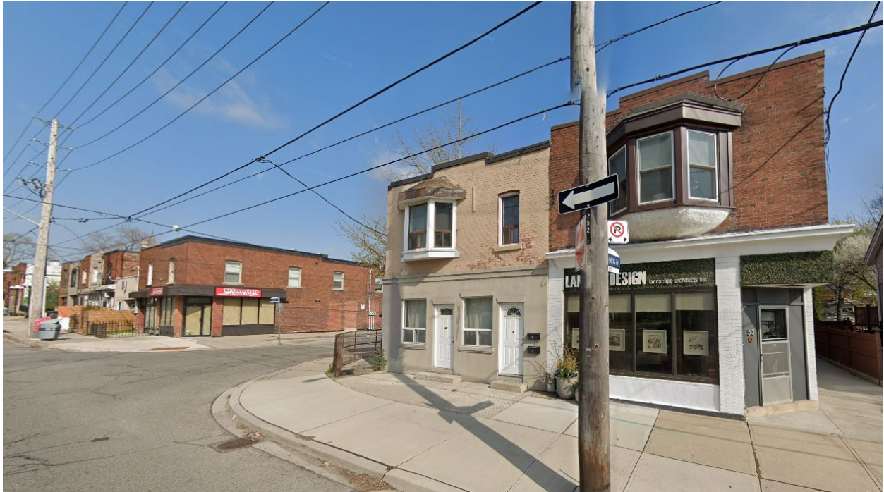
Figure 31 View looking northwest towards the commercial properties on the north side of Mimico Avenue at Queens Avenue.