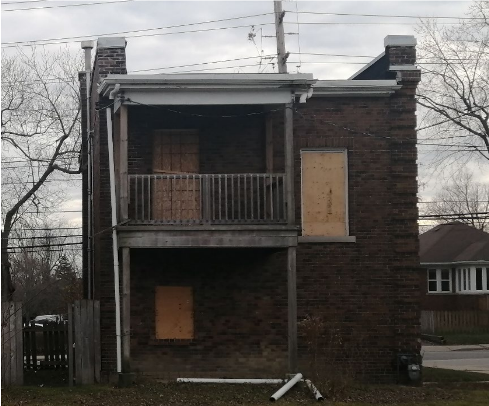
Figure 16 North elevation of 86 Mimico Avenue (Heritage Planning, 2023).