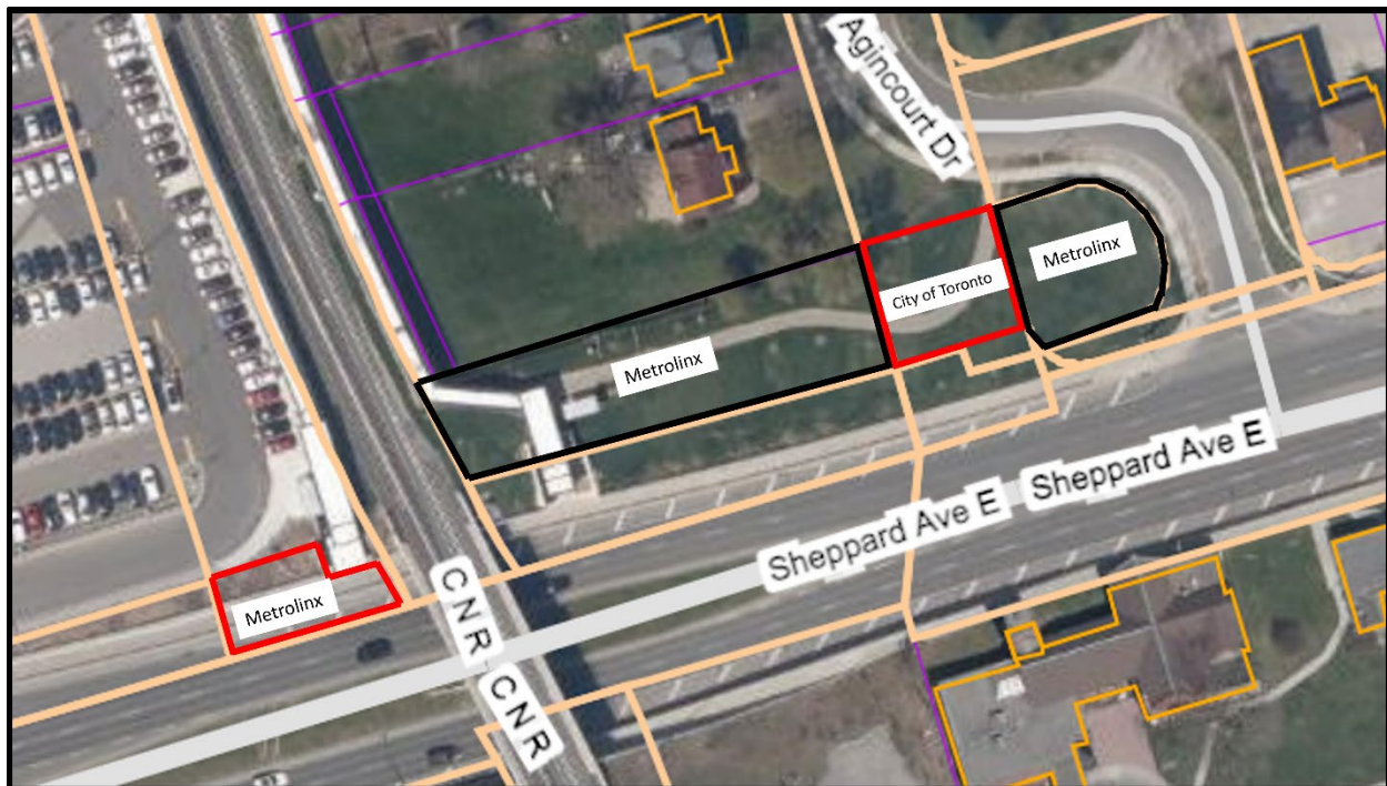
Figure 1 – Remnant Land Parcels

A grade separation was constructed on Sheppard Avenue East to improve traffic operations and accommodate increased service capacity for the Stouffville GO rail line. This grade separation required a partial realignment of both Agincourt Drive and Sheppard Avenue East, resulting in remnant land parcels, highlighted in red in Figure 1 below.