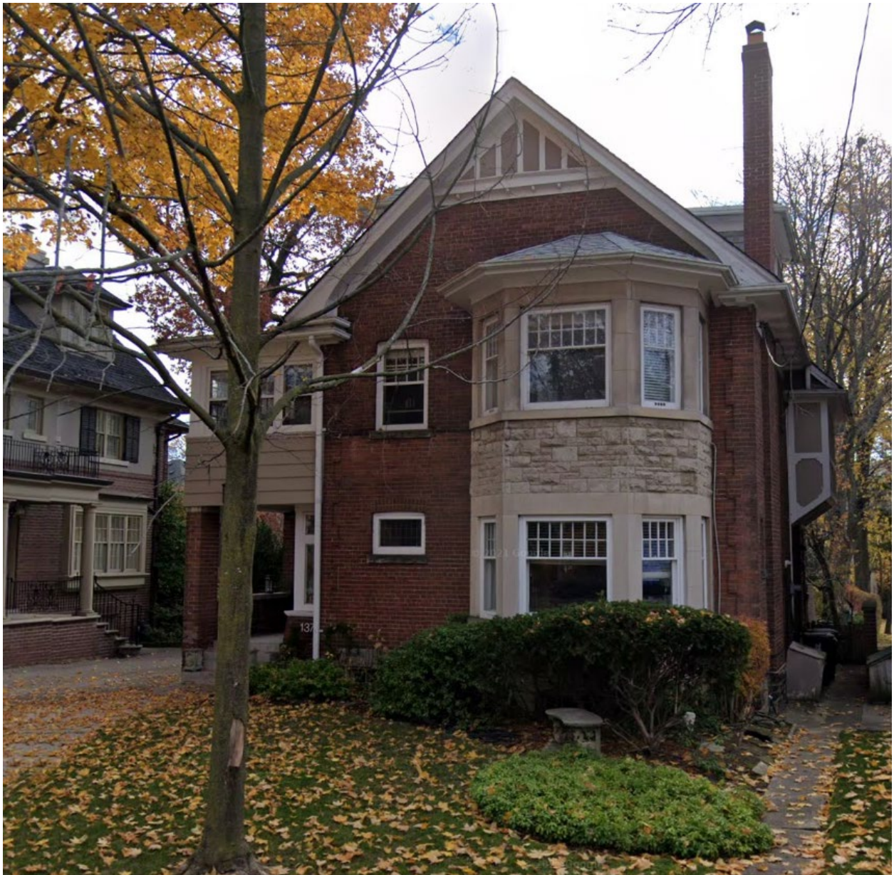
Contextual photo of the north elevation of the existing building at 137 Roxborough Drive prior to the unauthorized alterations.