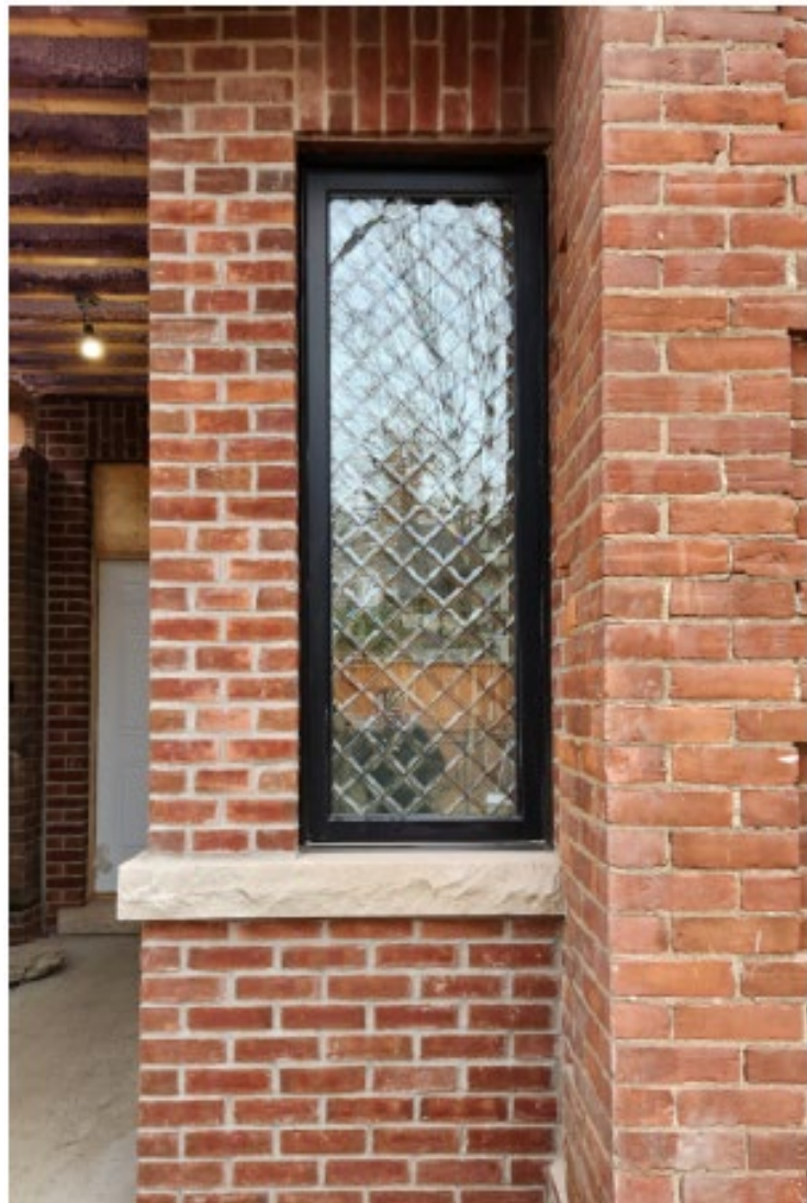
Photographs showing the original bay window in the front porch (on left) and the current masonry projection within the front porch (on right)