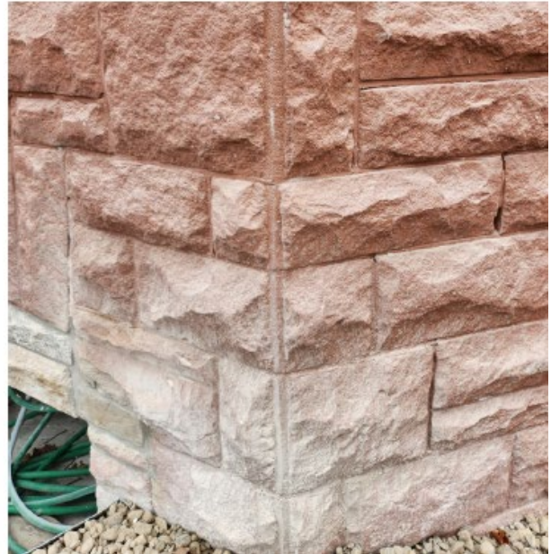
Detailed photo of the north elevation of the existing building at 137 Roxborough Drive showing the extent of the unauthorized work done to the natural cut and cast stone on the two-storey bay window (Boldera, 2024).