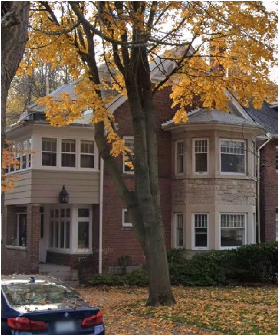
Contextual photo of the northeast elevation of the existing building at 137 Roxborough Drive prior to the unauthorized alterations (Google Maps, 2020).