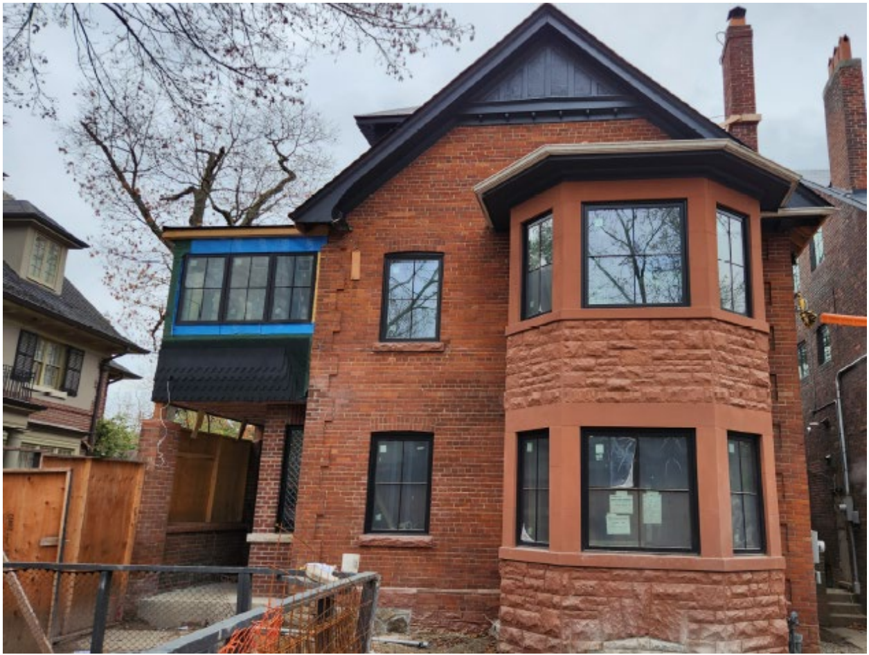
Contextual photo of the north elevation of the existing building at 137 Roxborough Drive showing the extent of unauthorized work done to the windows and the first-storey window opening (Boldera, 2024).