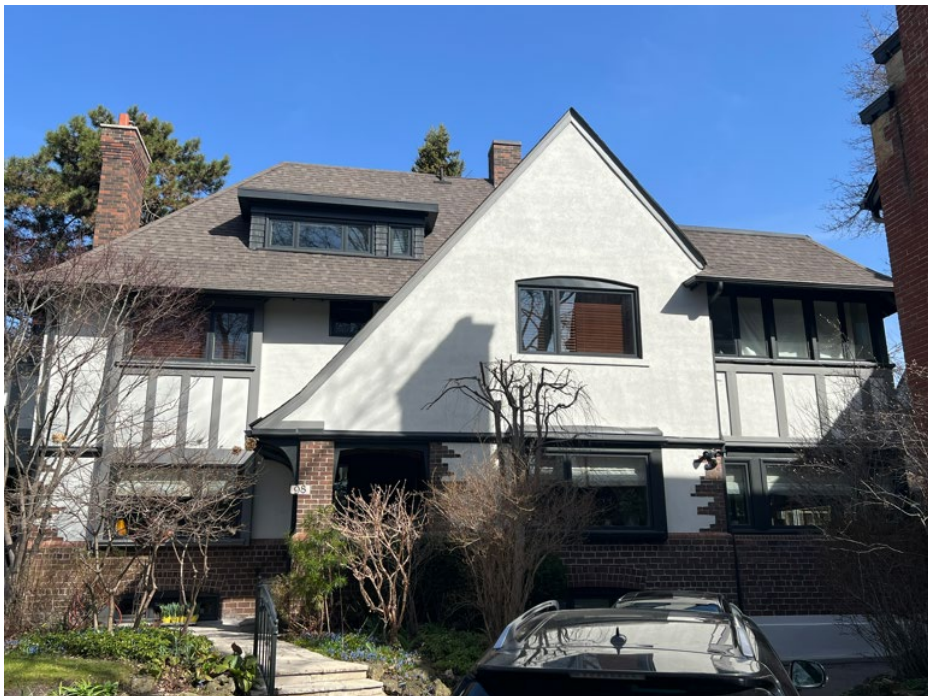
Contextual photo of the south elevation of the existing building at 98 Highland Avenue after the unauthorized alterations (City of Toronto, 2024).