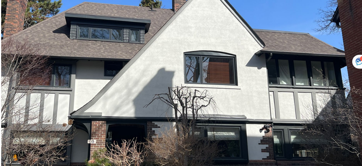
Detailed photo of the south elevation of the existing building at 98 Highland Avenue after the unauthorized alterations (City of Toronto, 2024).