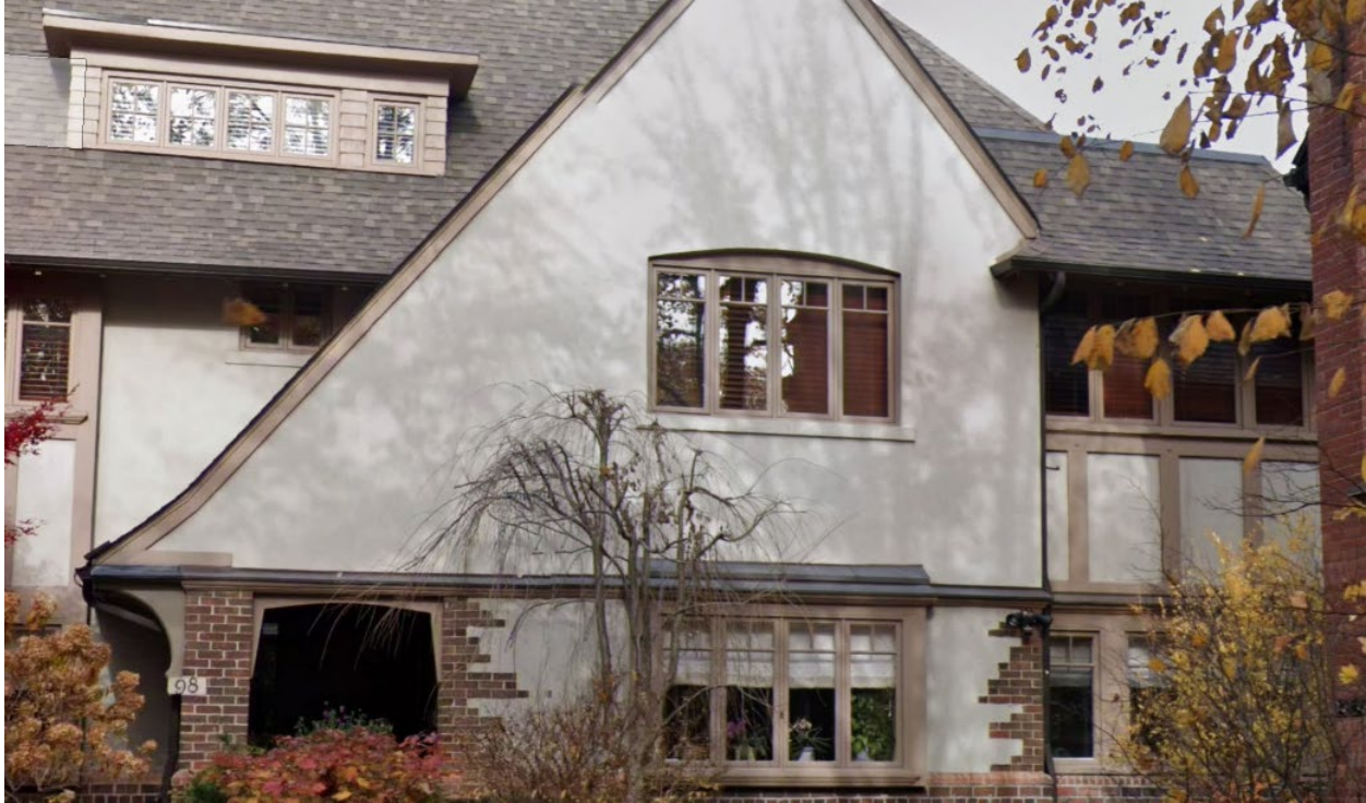
Detailed photo of the south elevation of the existing building at 98 Highland Avenue prior to the unauthorized alterations.