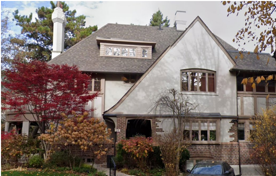
Contextual photo of the south elevation of the existing building at 98 Highland Avenue prior to the unauthorized alterations.