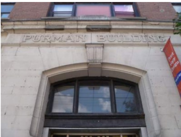
Transom above building entrance (north façade).