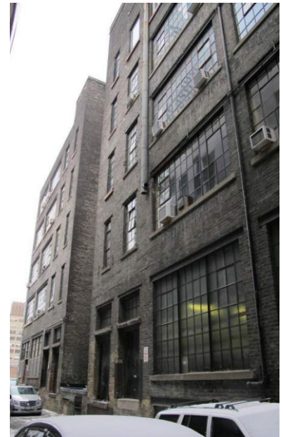
Rear (south) elevation.