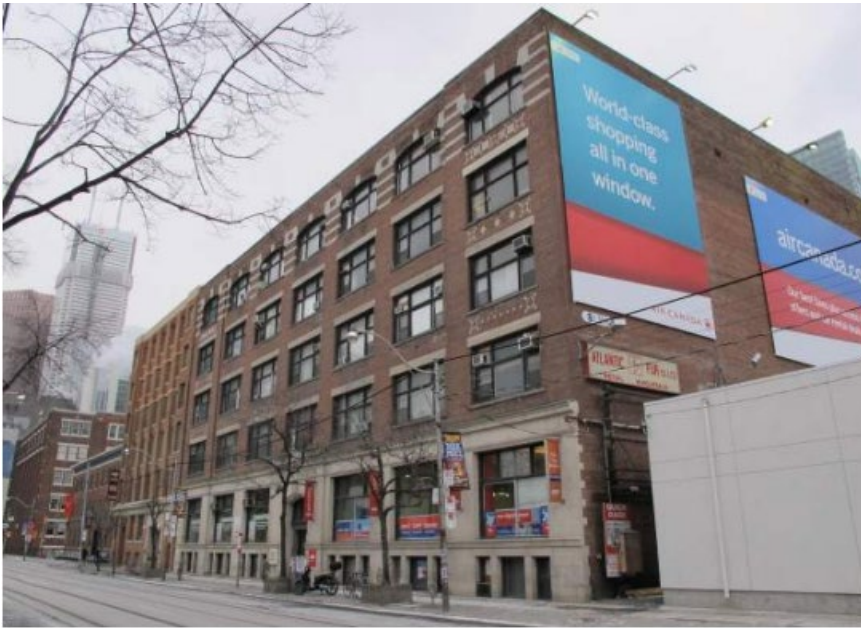
Principal (north) and west elevations.