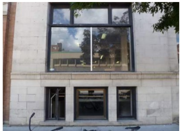
Easternmost bay windows.