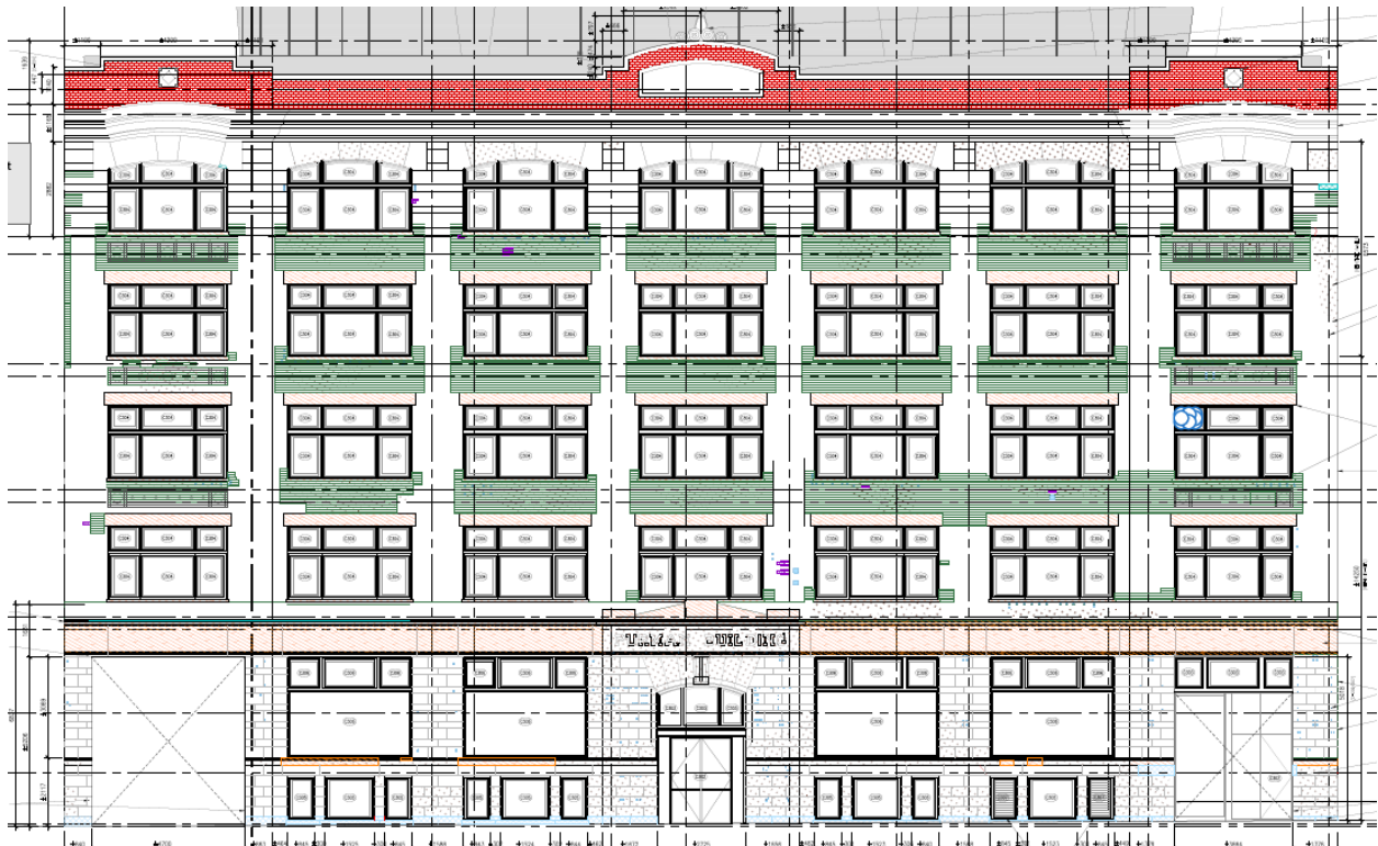
Elevation showing conservation/restoration treatments to front façade (red = rebuild, green = repoint, yellow = new precast or stone units to match original)