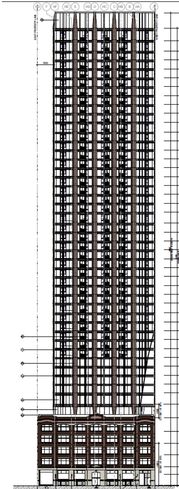
Front elevation (Source: Quadrangle Architects Limited)