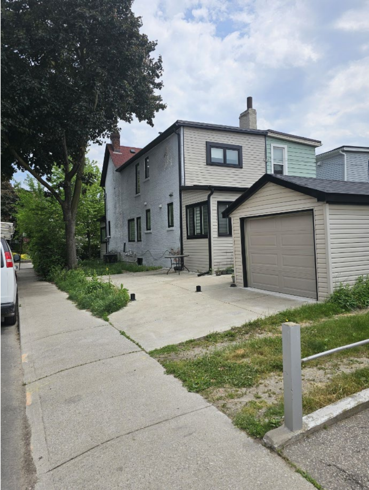
Attachment 3: Photo of the Shanly St flank of 308 Delaware Avenue