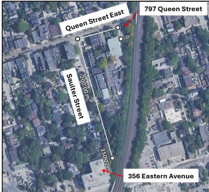
Figure 2 – Replacement Parking Lot Location

During this construction period, Fontbonne Ministries will remain operational, and Metrolinx will provide a replacement parking solution to mitigate the impact of the temporary closure. A temporary parking lot will be made available at 356 Eastern Avenue, located approximately 350 metres (a five-minute walk) away from the Fontbonne Ministries building. This replacement parking lot will accommodate staff, residents, and visitors, ensuring continuity of services to the Fontbonne Ministries. Figures 2 and 3 show the location of the replacement parking lot and its layout at 356 Eastern Avenue.