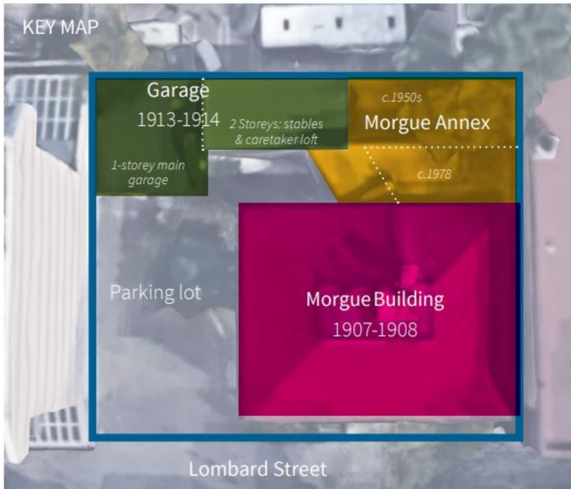
Figure 8: Key map of 86 Lombard Street showing the Morgue Building, Morgue Annex and Garage, Stables & Caretaker Loft (Google 2022, annotated by ERA Architects Inc.).