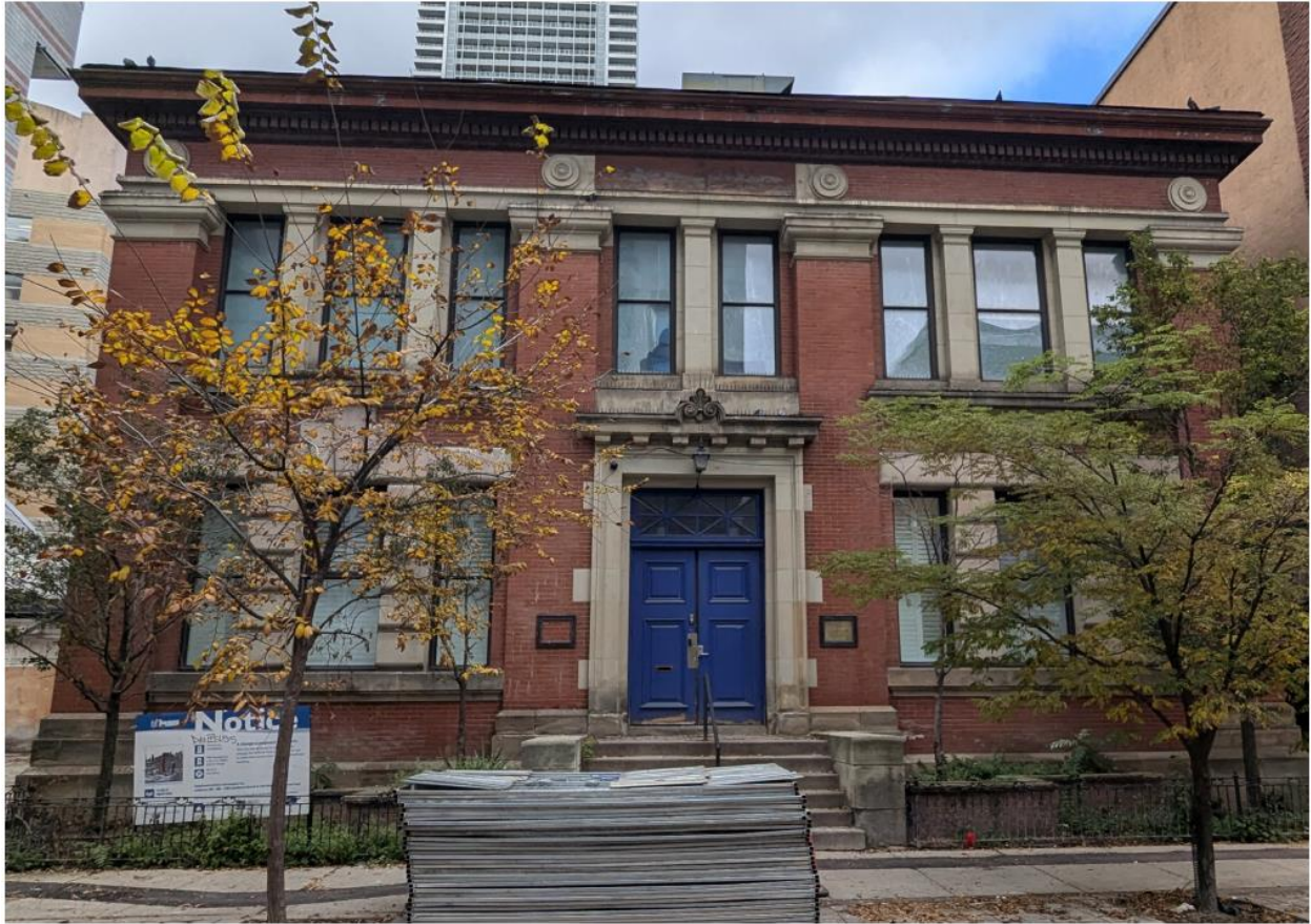
Figure 3: South (principal) elevation of 86 Lombard Street (ERA Architects Inc., 2024).