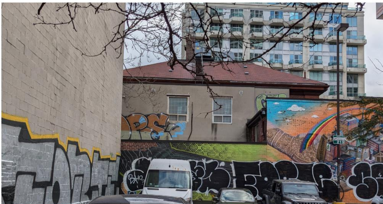
Figure 5: North (rear) elevation of 86 Lombard Street. The Morgue Annex, located at the rear of the property, is visible (ERA Architects Inc., 2024).