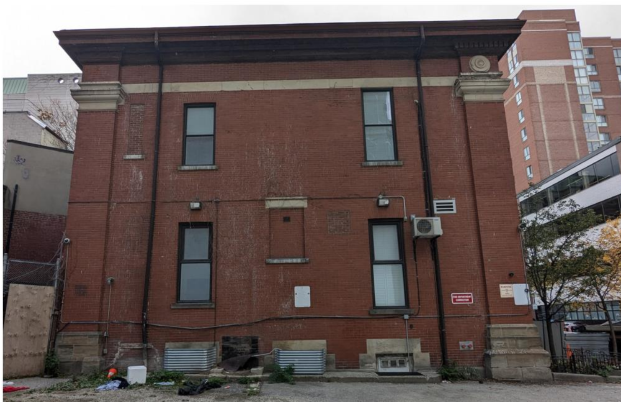
Figure 4: West (side) elevation of 86 Lombard Street (ERA Architects Inc., 2024).