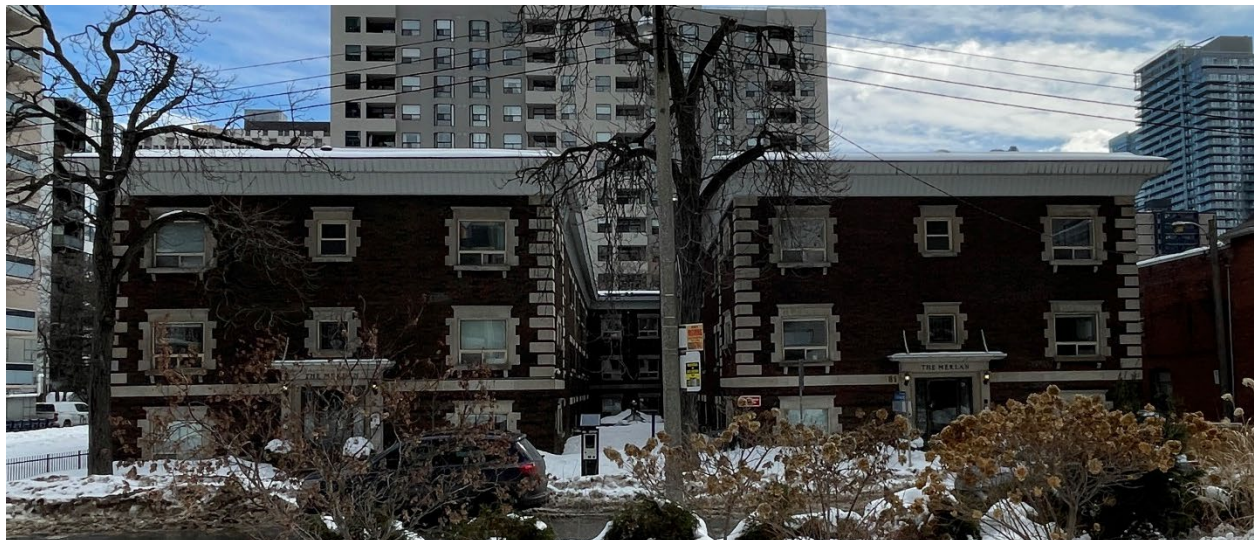
Figure 2. The principal (north) elevations of 81 Isabella Street (Heritage Planning, 2025).