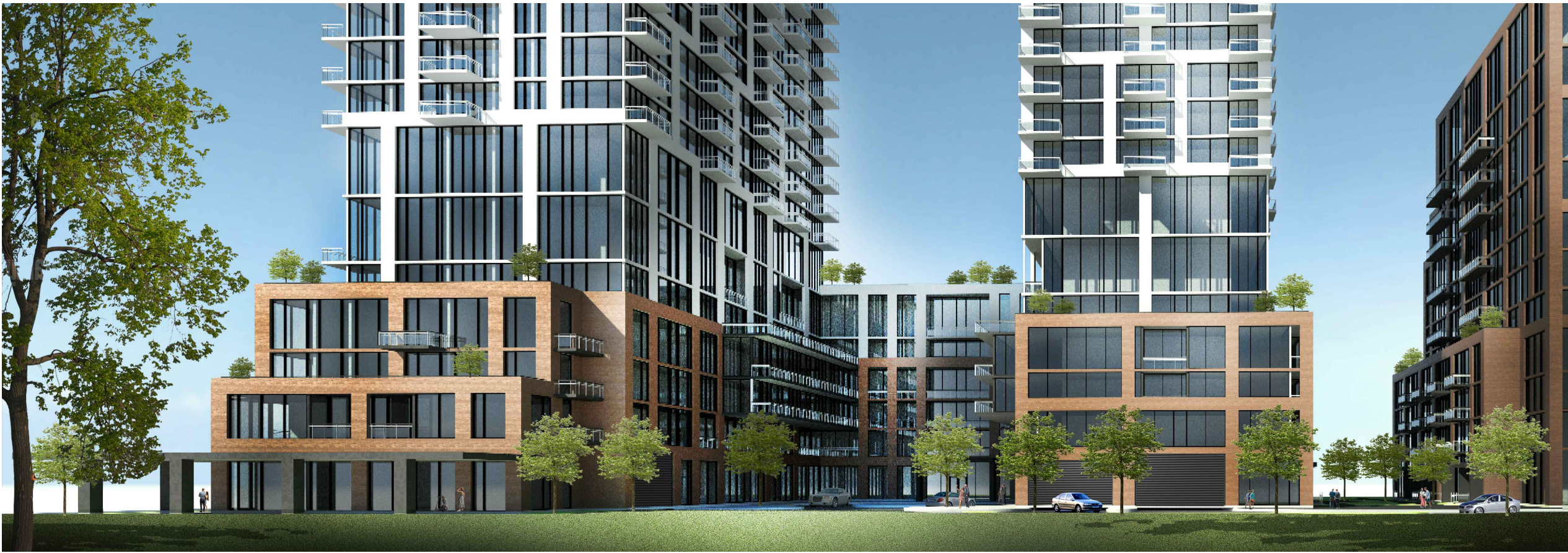
VIEW LOOKING NORTH AT PODIUM