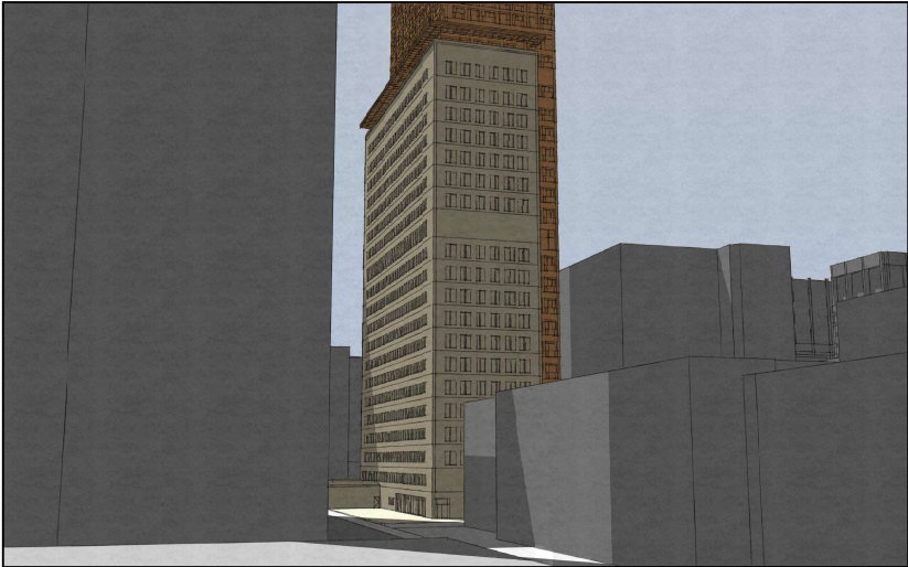
STREET VIEW FROM EDWARD STREET LOOKING WEST