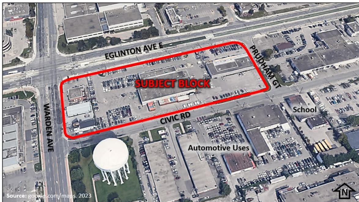
Figure 1 – SE Eglinton/Warden Block Context

In our experience, where a municipal road is to be widened, the land required for the widening is typically acquired equally from both sides of the road, particularly where there are properties with frontage and access on both sides. In this instance, as reflected in Figure 1 below, in addition to the municipal water tower located at the southeast corner of the intersection of Warden Avenue and Civic Road, there are a series of low-rise commercial / automotive uses with direct access on the south side of Civic Road between Warden Avenue and Prudham Gate.