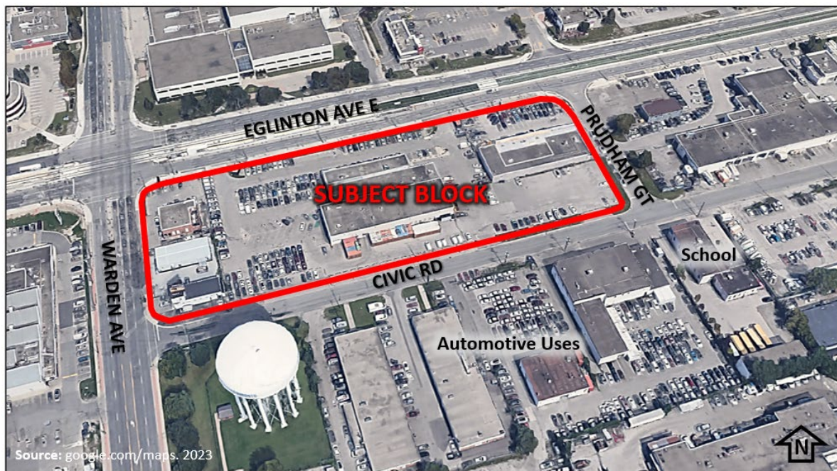
Figure 1 – SE Eglinton/Warden Block Context

The SE Eglinton/Warden Block is currently heavily automobile-oriented and very low-density, being comprised of extensive surface parking and outdoor automobile display areas, with a relatively poor pedestrian realm. Figures 1 and 2, below, illustrate the existing land use context of the SE Eglinton/Warden Block, together with the surrounding area.