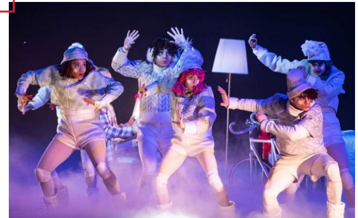
‘Twas the Night Before...at Meridian Hall

30,022,280 Media impressions 200 Media mentions