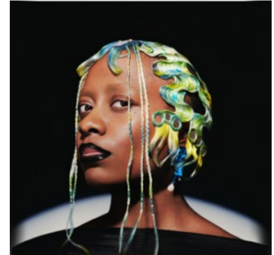
Cécile McLorin Salvant

Radio-Canada, November 29, 2024. “Y a pas deux matins pareil” French language interview with Cécile McLorin Salvant| Meridian Arts Centre | Listen here