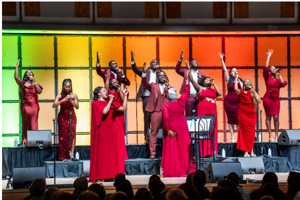
Kingdom Choir at Meridian Arts Centre

| Meridian Arts Centre | Caribbean Camera, December 06, 2024 “Kingdom Choir brings holiday magic to Toronto concert ” |Meridian Arts Centre| View Article 6k Reach