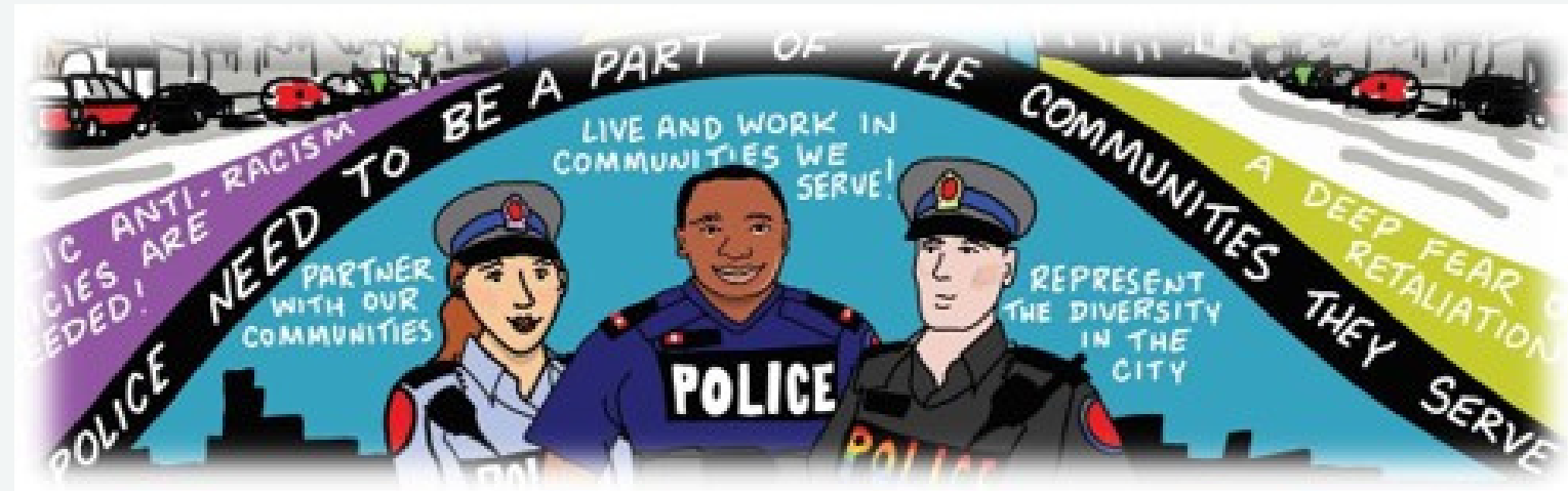
81 Recommendations August 2020

Toronto Police Service Board's 81 Recommendations for Police Reform