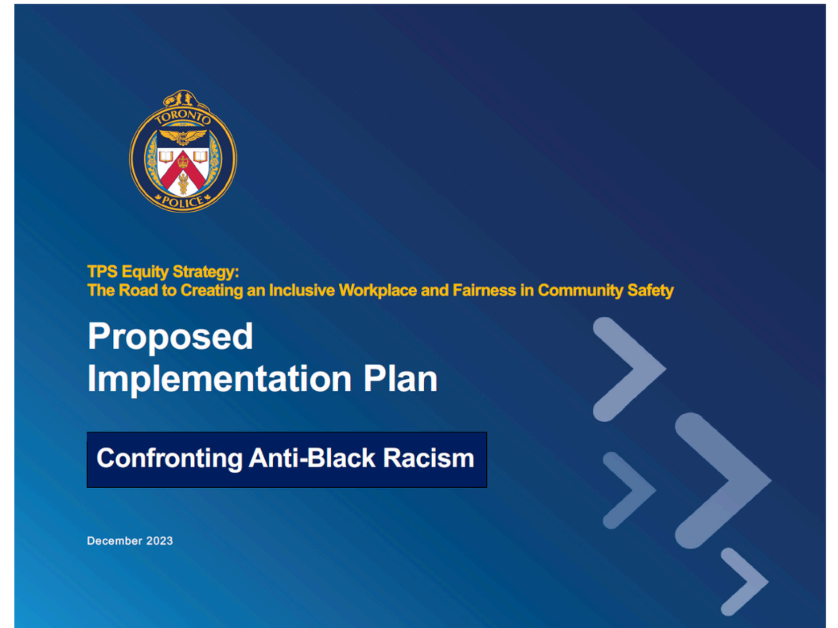
TPS Equity Strategy - CABR Implementation Plan