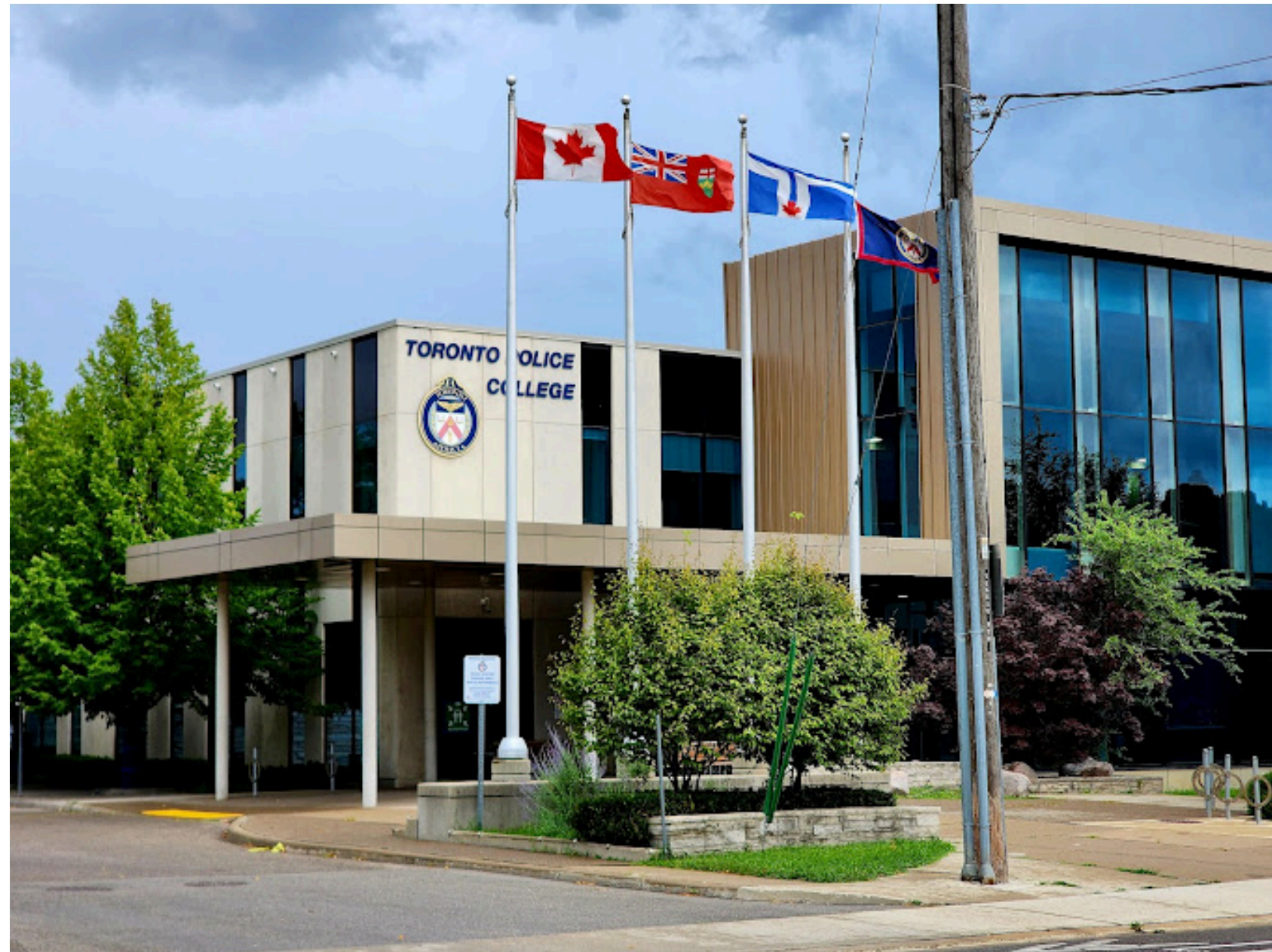
Training - Centering Black Experiences