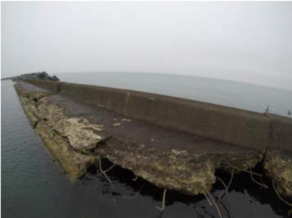
Photo of significant local deterioration of cap block.