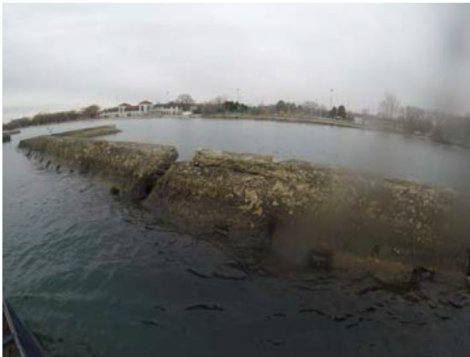
Photo of extensive damage near west end of structure.