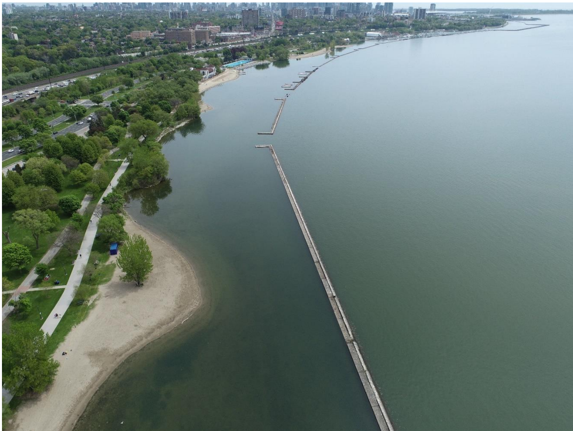
Photo of Western Beaches breakwaters located in Lake Ontario south of Toronto shoreline.