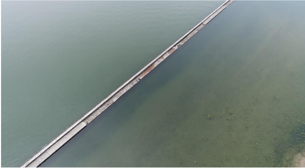
Photo of mid-section of Western Beaches breakwaters, across from Cazsimir Gzowski Park Beach.