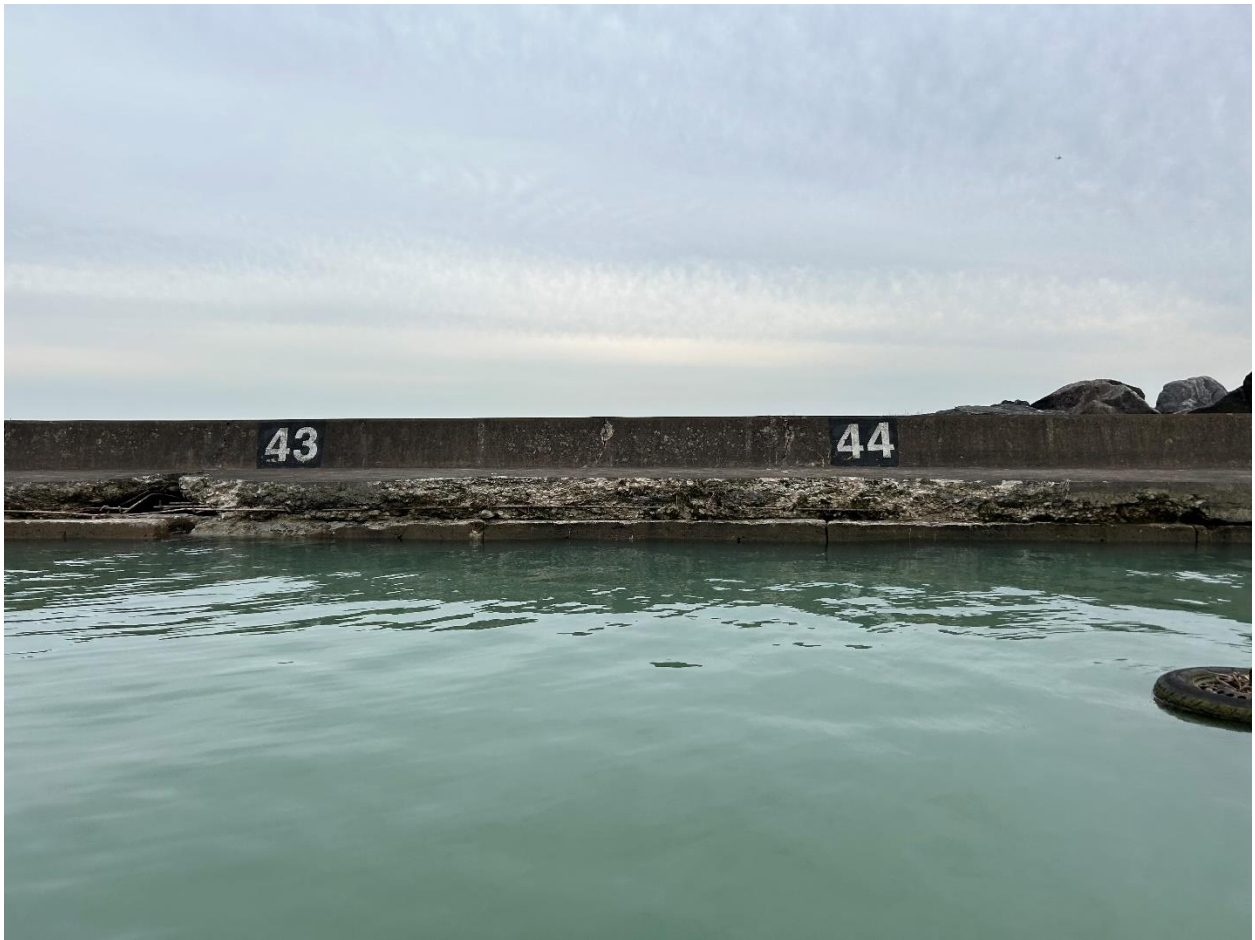
Photo of damage to concrete cap.