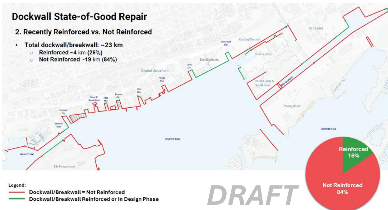
Figure 4: Preliminary mapping of Central Waterfront dock walls reinforcement needs