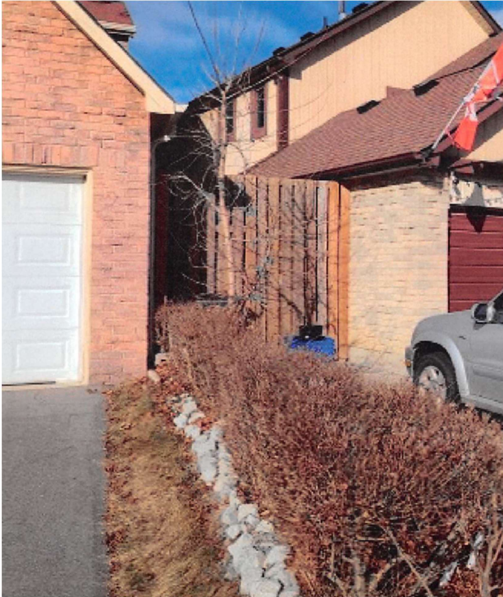
Attachment B – Photo showing location of fence on southwest side of property